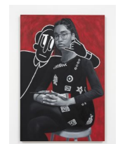
Portrait of the Artist Taking a Call , 2019 Oil on panel 36 x 24 inches (91.4 x 61 cm)