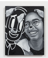
Dog Eat Dog , 2019 Oil on panel 14 x 11 inches (35.6 x 27.9 cm)