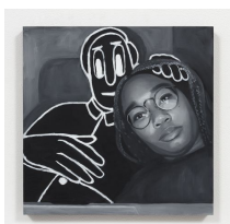
American Gothic , 2019 Oil on panel 12 x 12 inches (30.5 x 30.5 cm)