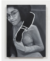
Ouch! , 2019 Oil on panel 12 x 9 inches (30.5 x 22.9 cm)