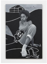
Let's Meet by the Picnic House, 2019 Oil on panel 36 x 24 inches (91.4 x 61 cm)