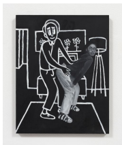
Is it ok if Brittany sleeps over?, 2019 Oil on panel 14 x 11 inches (35.6 x 27.9 cm)