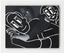
Three is Company, 2019 Oil on panel 16 x 20 inches (40.6 x 50.8 cm)