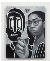
The Waiting Game , 2019 Oil on panel 16 x 12 inches (40.6 x 30.5 cm)