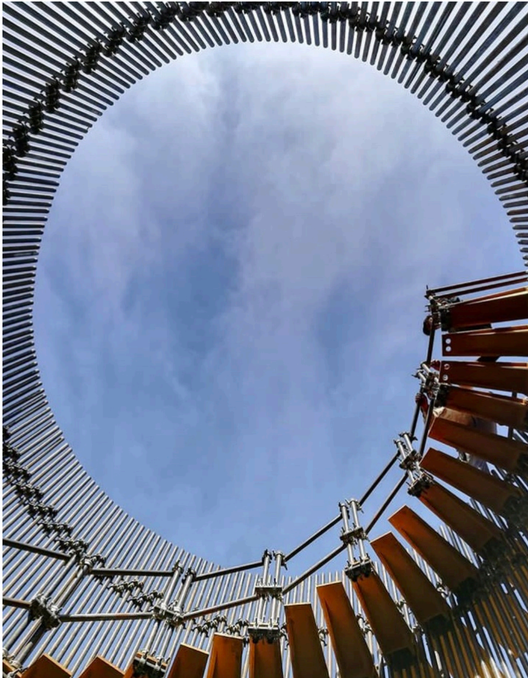
Starting Zone, 2018 Metal pipes, plywood, clamps 6,40 x 6,40 m Art Basel Cities, Buenos Aires 2018

GALERIE ALBERTA PANE 47 rue de Montmorency - 75003 Paris Calle dei Guardiani 2403/h Dorsoduro - 30123 Venezia info@albertapane.com - www.albertapane.com