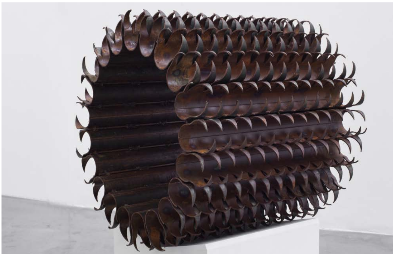
Untitled , 2018 iron pipes 71,5 x 71,5 x 71,5 cm

GALERIE ALBERTA PANE 47 rue de Montmorency - 75003 Paris Calle dei Guardiani 2403/h Dorsoduro - 30123 Venezia info@albertapane.com - www.albertapane.com