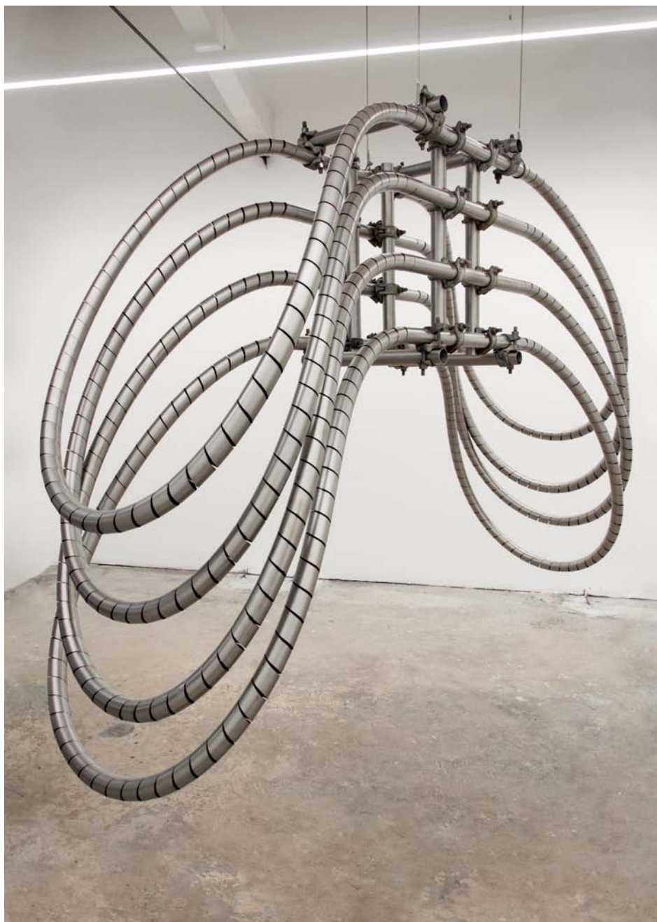
Untitled , 2018 stainless steel pipes, scaffolding clamps 180 x 90 x 280 cm

GALERIE ALBERTA PANE 47 rue de Montmorency - 75003 Paris Calle dei Guardiani 2403/h Dorsoduro - 30123 Venezia info@albertapane.com - www.albertapane.com