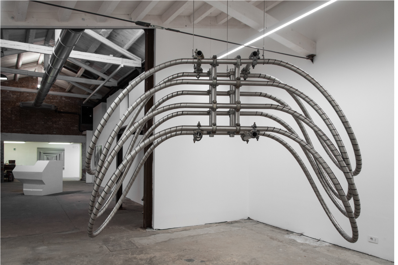
Exhibition view of Extended Architectures ©Galleria Alberta Pane, Venice, 2018 Photo. Irene Fanizza