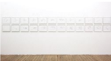
Anthony McCall Leaving (with Two-Minutes Silence), 2006/8 Working Drawings Graphite on paper 24 pieces each 40,5 x 33 cm (framed)