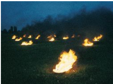
Anthony McCall Landscape for Fire, 1972 Film of the performance "Landscape for Fire (II)" performed in North Weald, UK (27 August 1972) 16mm transferred to DVD 2006, colour, sound 7 min