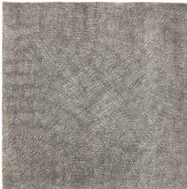
Anthony McCall Pencil Duration (Short Strokes), 1974 Graphite on paper 93,5 x 93,5 cm (framed)