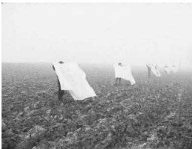
Anthony McCall Landscape for White Squares, 1972 Film, colour, sound 1:50 min