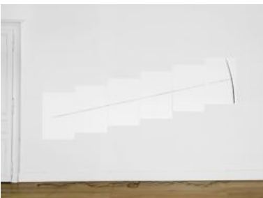
Anthony McCall Five Minute Drawing, 1974/2011 Charcoal on BFK Rives White 270 gsm + Charcoal + string 6 parts, each 63 x 90 cm (unframed)