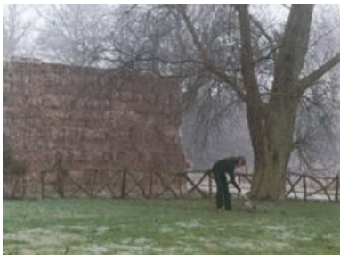
Anthony McCall Earth Work, 1972 Film, colour, sound 1:50 min