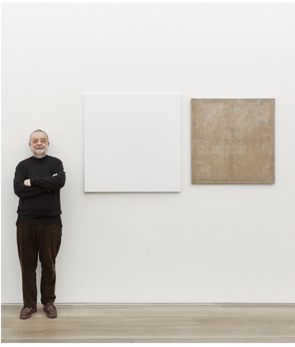
de-finition/method: repainted [1973] / de-painted [2010]. Paint on canvas. 92 x 183 cm | 36 1/4 x 72 in. Courtesy of the artist and Perrotin.