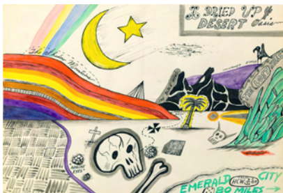
H.C. Westermann, A Dried Up Desert Oasis , 1964

sculptures to inform galleries of his production. Notable works on view include a suite of drawings featured in "Eye Infection," the celebrated exhibition curated by Robert Storr at the Stedelijk Museum in 2001; Green Planet (1967), a preparatory drawing for a lithograph of the same name, held in the collection of The Metropolitan Museum of Art; and Terrifying Sea Picture (1966), which features a death ship and an oversized shark fin, two of Westermann's most iconic images. He made many of these drawings in Connecticut, where, starting in 1969, he spent twelve years building a house and two studios for himself and his wife. Bringing to the construction of his house a level of detail found in his sculpture, Westermann's home and studio have been called his "greatest work of art." Complimenting the works on view, a portion of Westermann's own studio will be installed in the gallery.