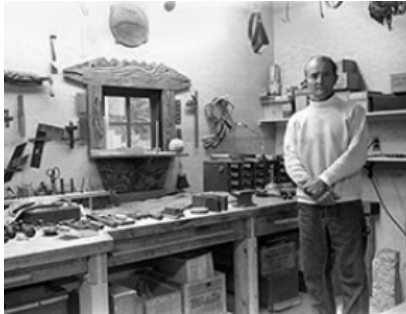
H.C. Westermann in his studio, Connecticut, c. 1975