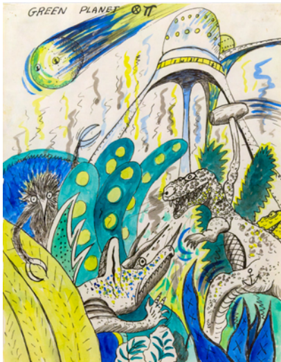
H.C. Westermann, Green Planet , 1967