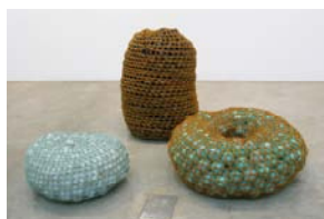
Two Floats and a Hill

polypropylene and polyester rope, plastic balls, wood 59 x 147 1/2 x 18 3/4 inches; 149.9 x 374.7 x 47.6 cm (TBG 13924)