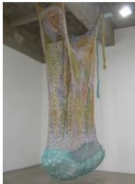
as yet untitled