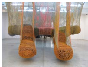
The Island Bird