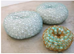
Fluffy Flo Float, H2O