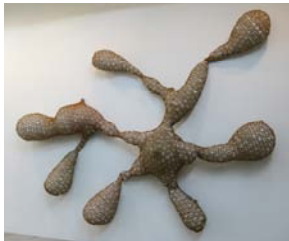
Sorry, I Don't Know Exaclly Where to Go