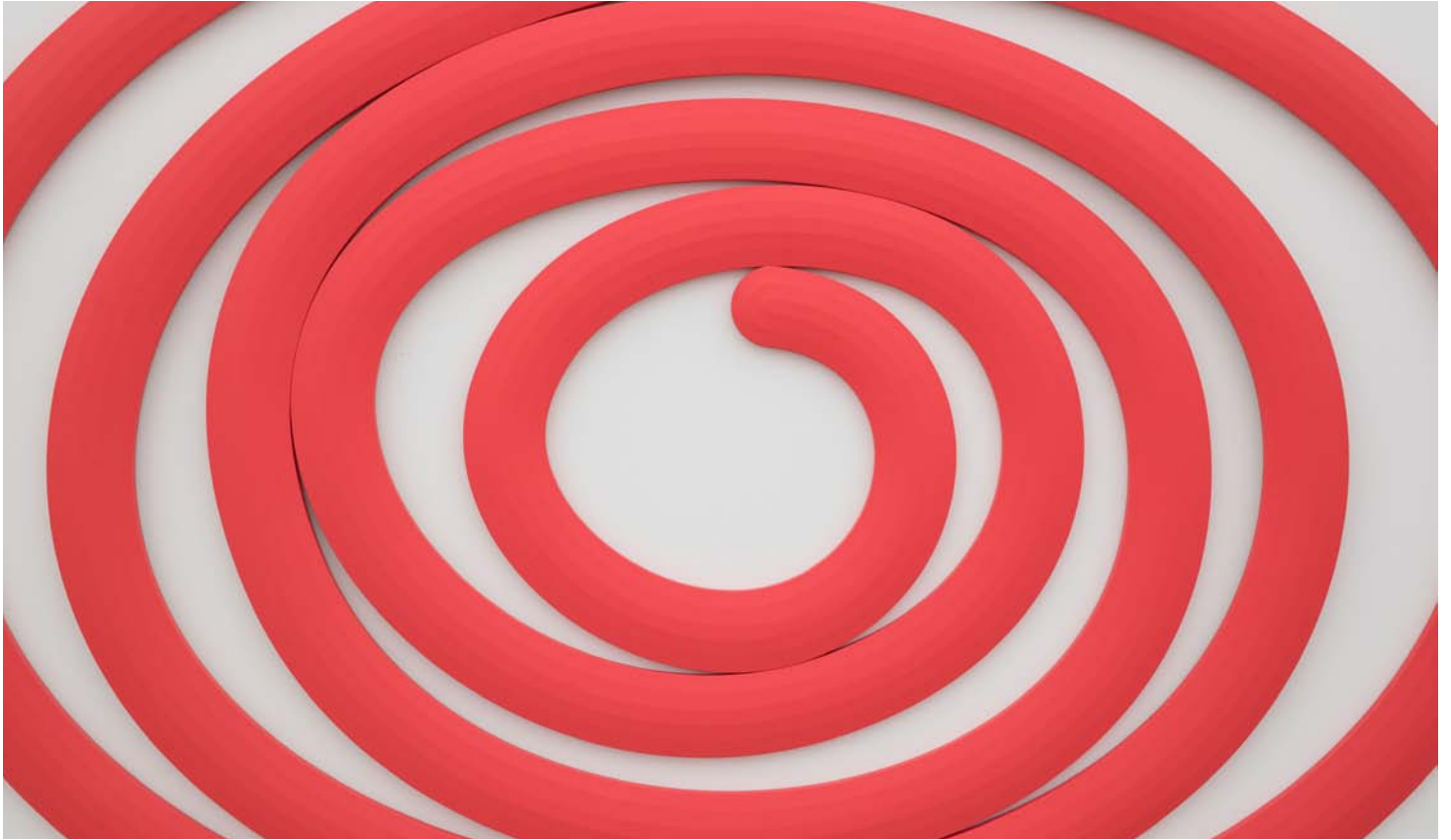
Red Eye (detail), 2018. Acrylic on canvas, 195.6 × 264.2 cm | 77 × 104 in.