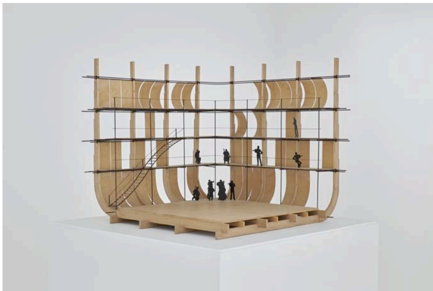
Renzo Piano Building Workshop Architects Portion of the Building - Presentation Model (Scale 1:20), 1996 Wood, metal, 64 x 74 x 74 cm (25,2 x 29,13 x 29,13 in)

In a short note to architect Renzo Piano dated 6 December 1983, Nono wrote: “No opera/ no director/ no set designer/ no traditional characters/ but/ dramaturgy-tragedy with mobile sounds that/ read discover/ empty fill up space.” Based on those indications, Piano designed a wooden auditorium that would represent a musical space within the church. The expertise of a violinmaker combined with shipbuilding construction techniques made the creation of this large soundbox possible. The project revolutionised the concept of a traditional concert hall, as the audience (up to 400 people) would be seated at the centre, while musicians were to stand around at various heights. Live electronics were designed at the German radio SWR’s Heinrich-Strobel-Stiftung experimental studio, as was the acoustic infrastructure for “the Structure”. The orchestra had to move during the performance, walking on stairs and along walkways as if on a ship deck, while Claudio Abbado conducted with the help of a monitor. In a radically new form, it recalls the musical tradition of 16 th - and 17 th -century Venice, in which several groups of singers were positioned in specific places inside a church to create striking sound effects.