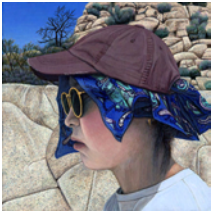
Paige Jiyoung Moon A Hiker , 2018 Acrylic on canvas 6 x 6 inches (15.2 x 15.2 cm) p.moon007344