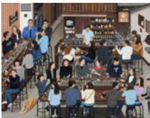
Paige Jiyoung Moon Warm House , 2018 Acrylic on panel 10 3 / 4 x 14 1 / 4 inches (27.3 x 36.2 cm) p.moon007589