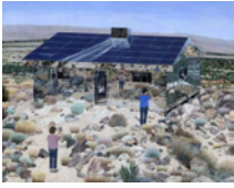
Paige Jiyoung Moon Mirror House , 2018 Acrylic on panel 11 x 14 inches (27.9 x 35.6 cm) p.moon007652