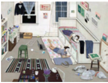
Paige Jiyoung Moon Ko's Old Apartment , 2018 Acrylic on canvas 9 1 / 2 x 12 inches (24.1 x 30.5 cm) p.moon007653