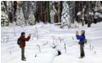
Paige Jiyoung Moon Undisturbed Nature , 2016 Acrylic on panel 7 x 11 inches (17.8 x 27.9 cm) p.moon007345