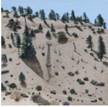
Paige Jiyoung Moon Baldy Road , 2018 Acrylic on canvas 18 x 18 inches (45.7 x 45.7 cm) p.moon007591