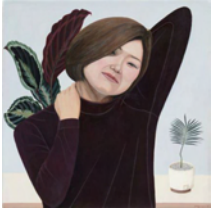
Paige Jiyoung Moon Sol , 2018 Acrylic on canvas 12 x 12 inches (30.5 x 30.5 cm) p.moon007590