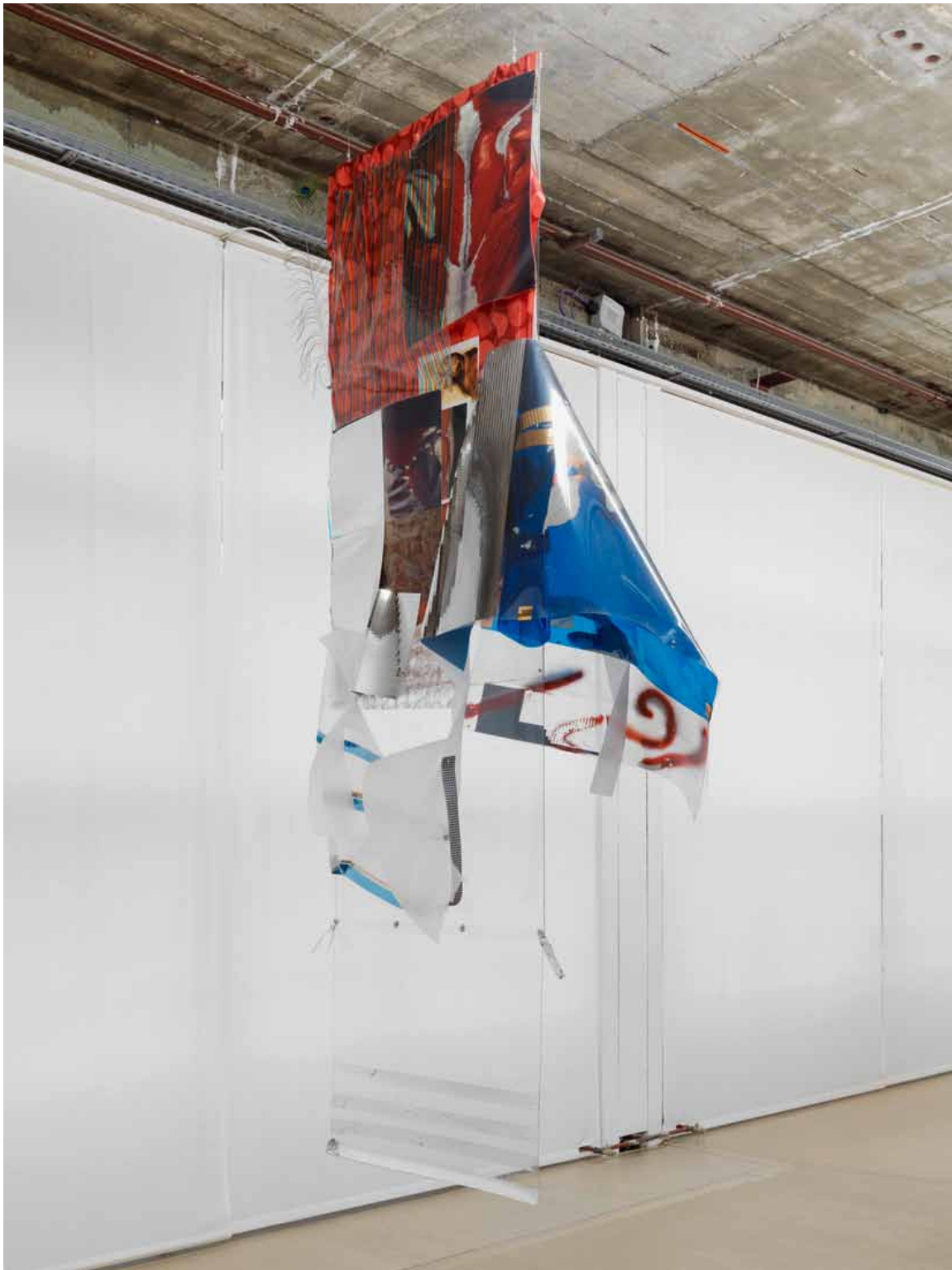
UNTITLED 2012 PERSPEX, MIRROR FOIL, COLOUR PRINTS, RIBBON, FEATHER, PLASTIC, NATURAL FIBER 275 x 160 x 40 CM / 108 1/4 x 63 x 15 3/4 IN