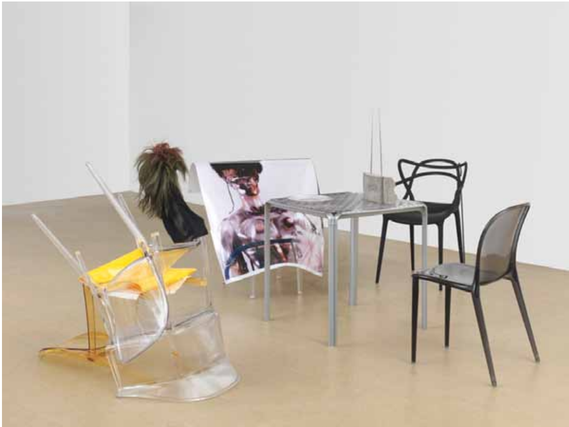
UNTITLED 2012 GLASS, PLASTIC, CONCRETE, METAL, PAINT, ADHESIVE FOIL, MASK, COLOUR PRINT 300 x 160 x 124 CM / 118 1/8 x 63 x 48 7/8 IN