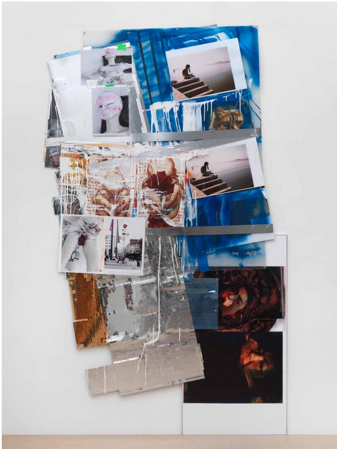
UNTITLED 2012 COLOUR PRINTS, TAPE, PAINT, MIRROR FOIL, PERSPEX, PHOTOGRAPHS 218 x 132.5 CM / 85 7/8 x 52 1/8 IN