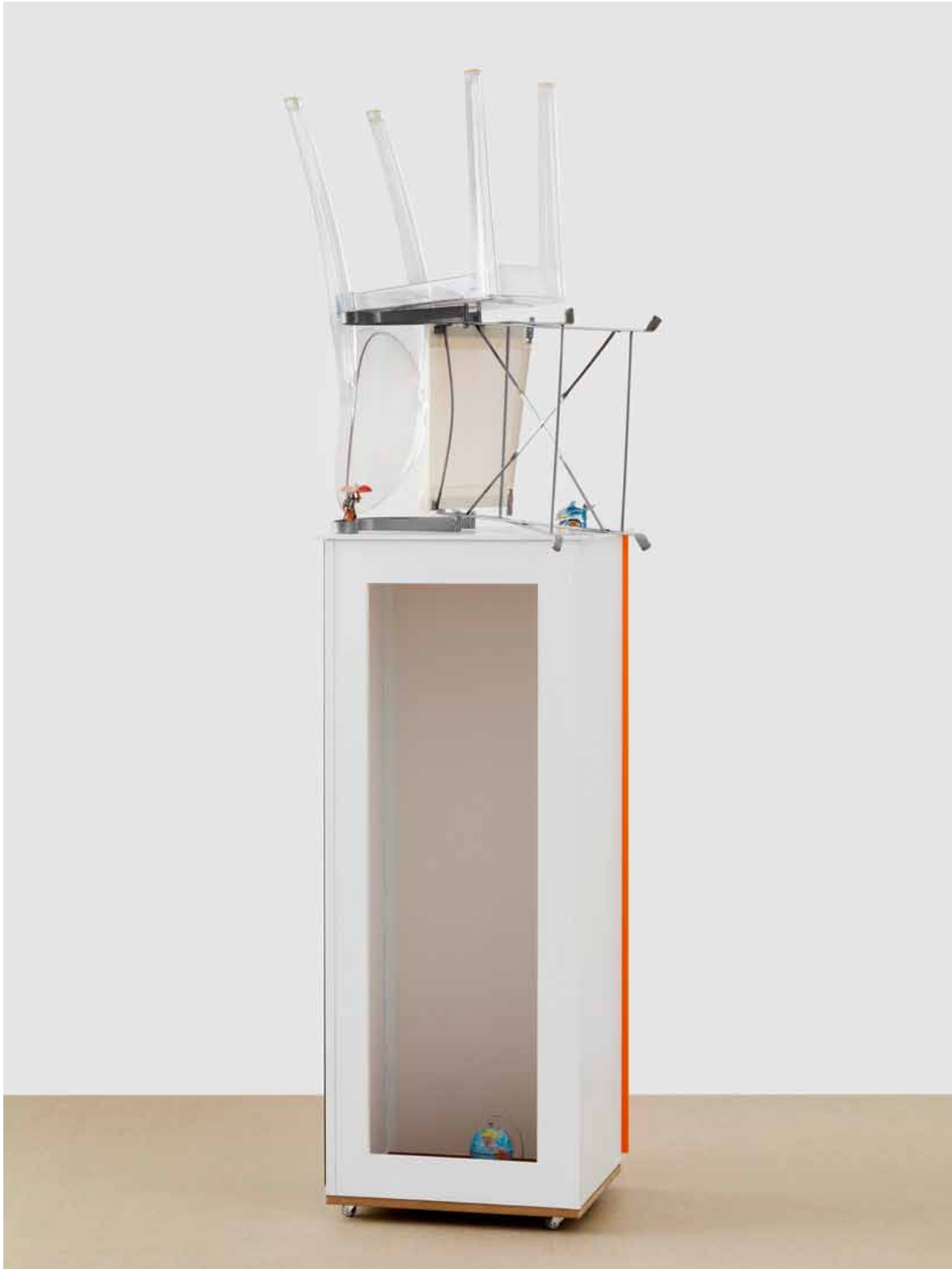
UNTITLED 2012 MDF, METAL, GLASS, PERSPEX, PAINT, GLOBE, PLASTIC AND CERAMIC FIGURES, CASTERS 244 x 86 x 83 CM / 96 1/8 x 33 7/8 x 32 5/8 IN