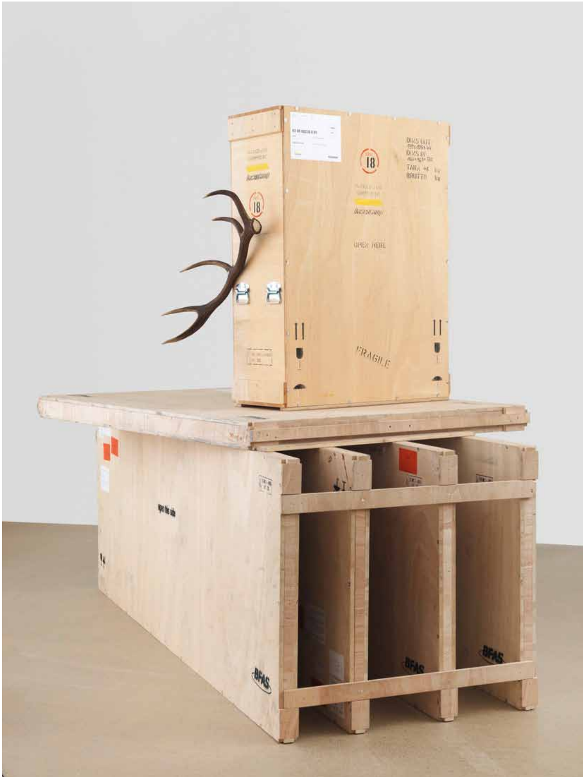
UNTITLED 2012 WOODEN CRATES, LABELS, METAL, ANTLER 264.5 x 318 x 197 CM / 104 1/8 x 125 1/4 x 77 1/2 IN