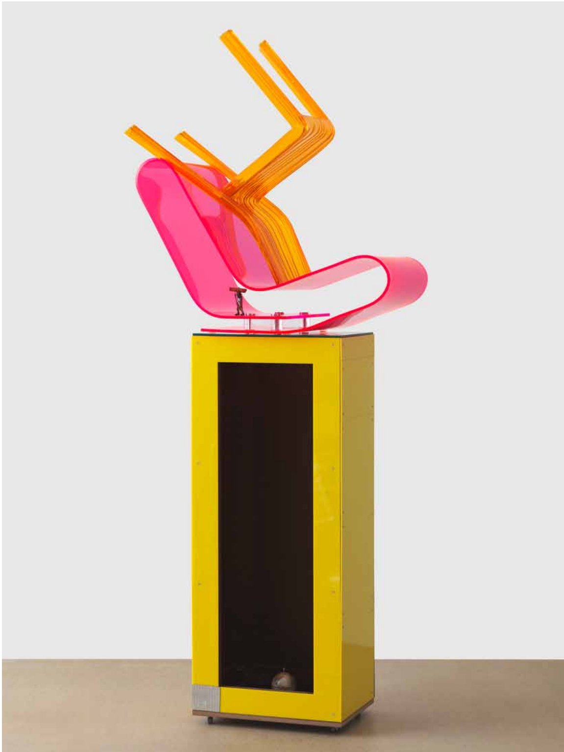
UNTITLED 2012 MDF, METAL, PLASTIC, GLASS, MIRROR FOIL, PERSPEX, GLOBE, PLASTIC FIGURE, CASTERS 245 x 55 x 100 CM / 96 1/2 x 21 5/8 x 39 3/8 IN