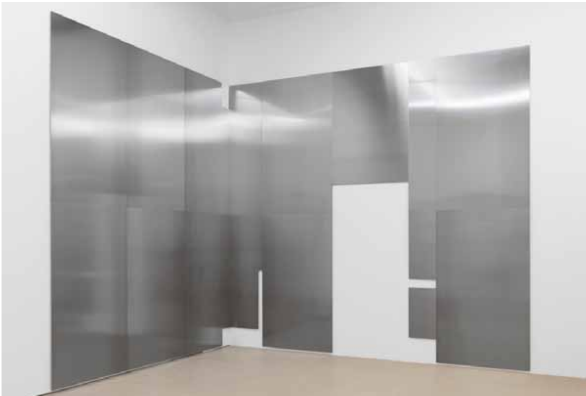
UNTITLED 2012 METAL PANELS INSTALLATION, TOTAL DIMENSIONS VARIABLE