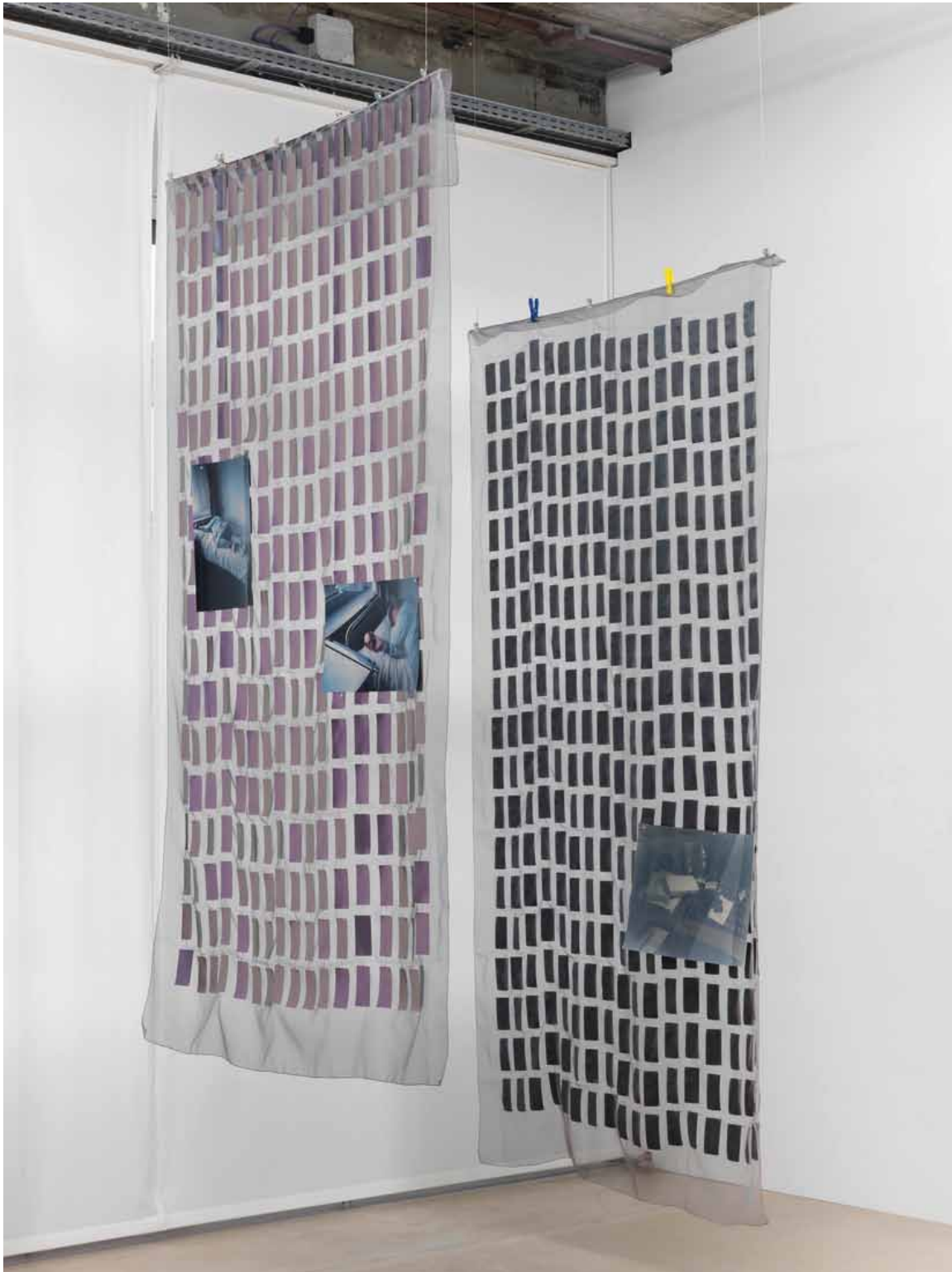
UNTITLED 2012 FABRIC, PAPER, COLOUR PHOTOGRAPHS, PLASTIC, METAL, ACRYLIC PAINT; 2 PARTS 267 x 145 CM / 105 1/8 x 57 1/8 IN