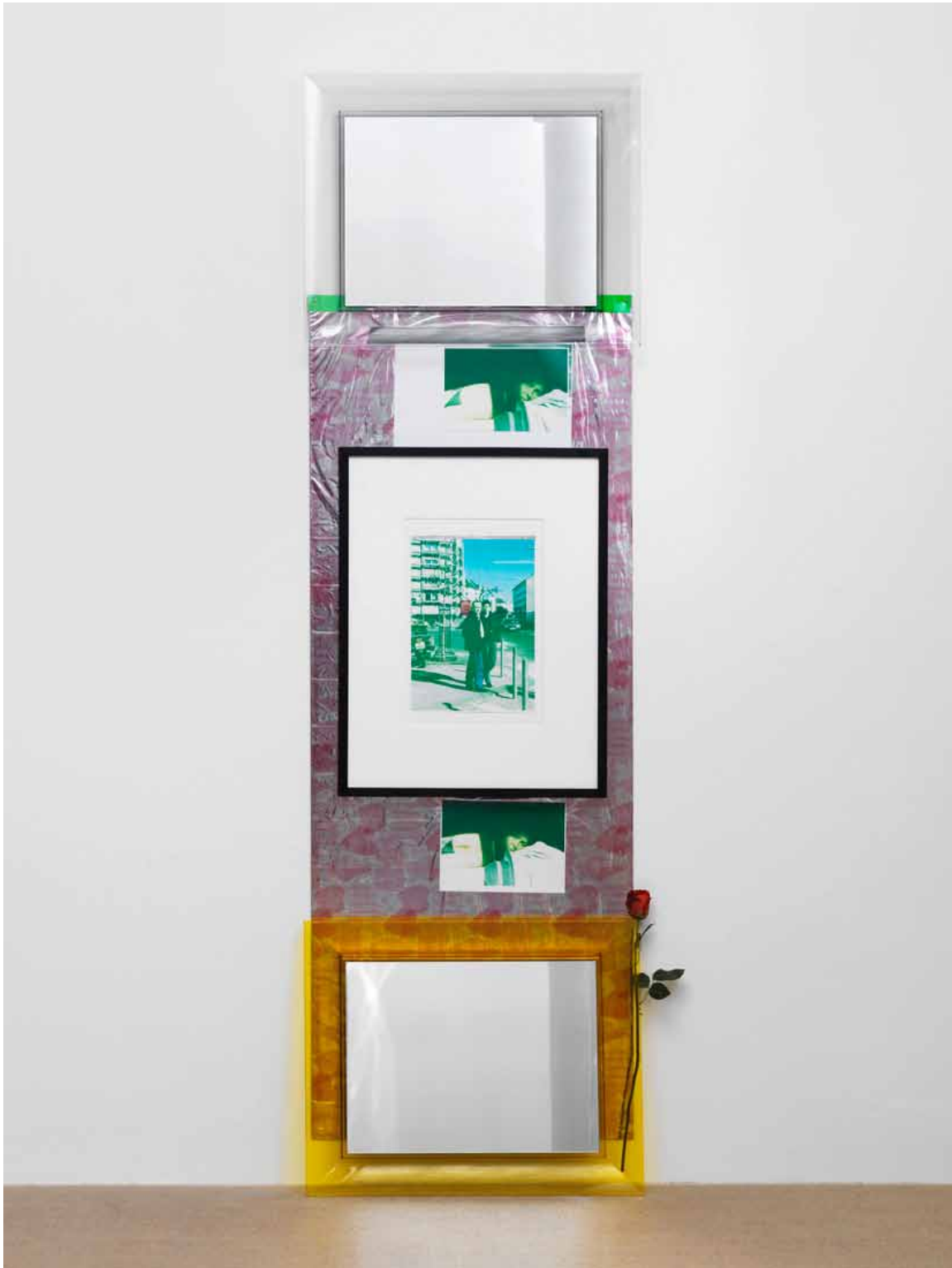
UNTITLED 2012 MIRRORS, PERSPEX, WRAPPING PAPER, TAPE, PLASTIC, ARTIFICIAL FLOWER, FRAMES, PHOTOGRAPHS, NEWSPAPER 265 x 79 x 6 CM / 104 3/8 x 31 1/8 x 2 3/8 IN