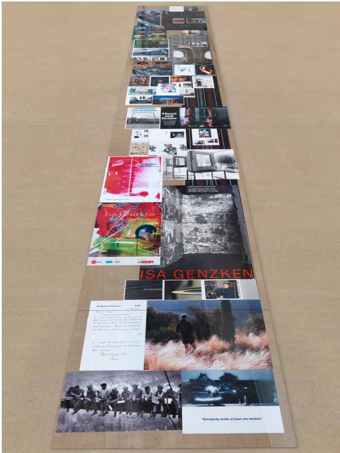
UNTITLED 2012 COLOUR PRINTS, WALLPAPER, WRAPPING PAPER, COLOUR PHOTOGRAPHS, GLASS 1200 x 100 CM / 472 1/2 x 39 3/8 IN