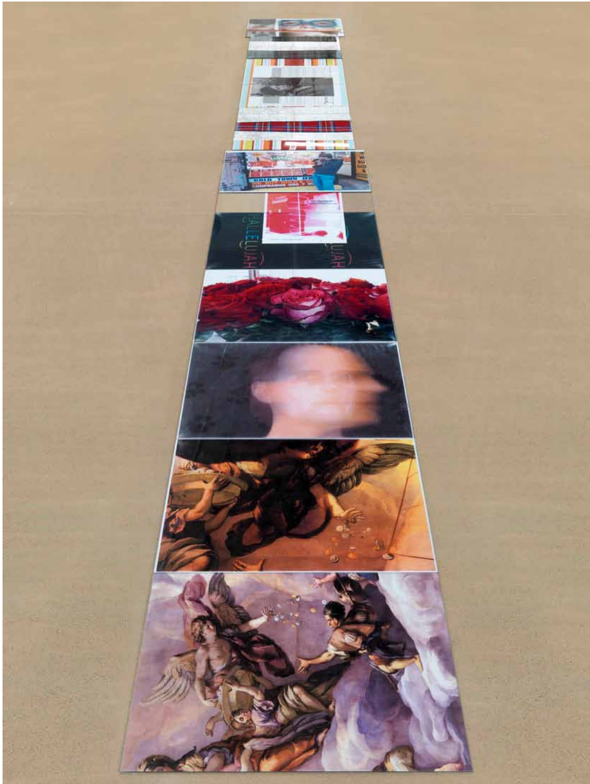
UNTITLED 2012 PHOTOGRAPHS, COLOUR PRINTS, MIRROR FOIL, TAPE, PIN, ACRYLIC PAINT, GLASS 1143 x 119 CM / 450 x 46 7/8 IN