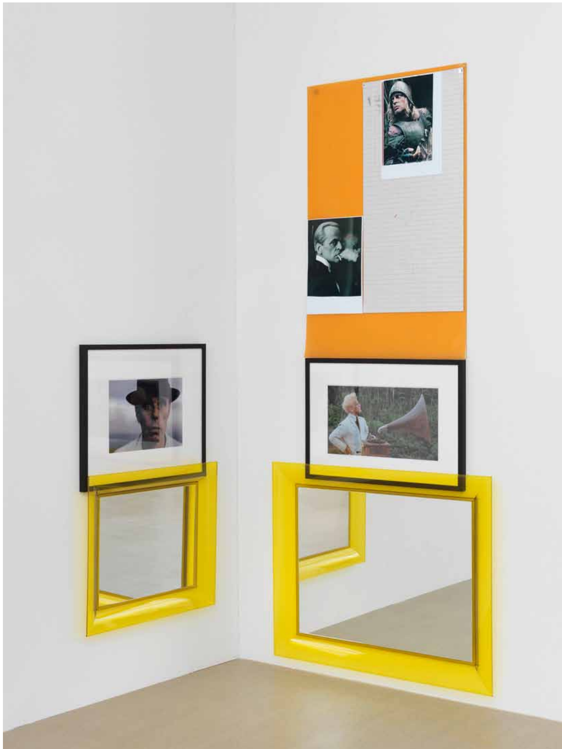
UNTITLED 2012 MIRRORS, PERSPEX, COLOUR AND B/W PRINTS, MIRROR FOIL, FRAMES, GLUE LEFT PART: 147,5 x 79 x 6 CM RIGHT PART: 260 x 211 x 6 CM