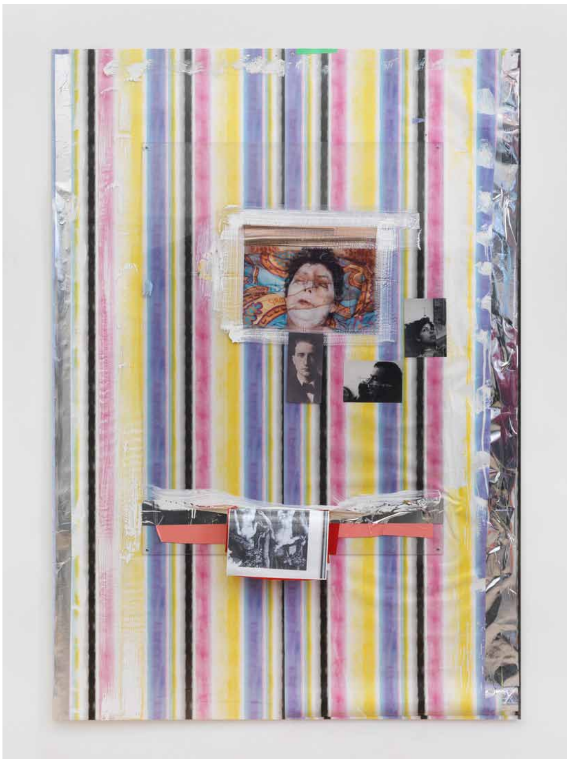
UNTITLED 2012 WRAPPING PAPER, COLOUR PRINTS, B/W PHOTOGRAPHS, PERSPEX, MIRROR FOIL, PAPER, TAPE, ACRYLIC PAINT 202 x 140.5 x 9 CM / 79 1/2 x 55 3/8 x 3 1/2 IN