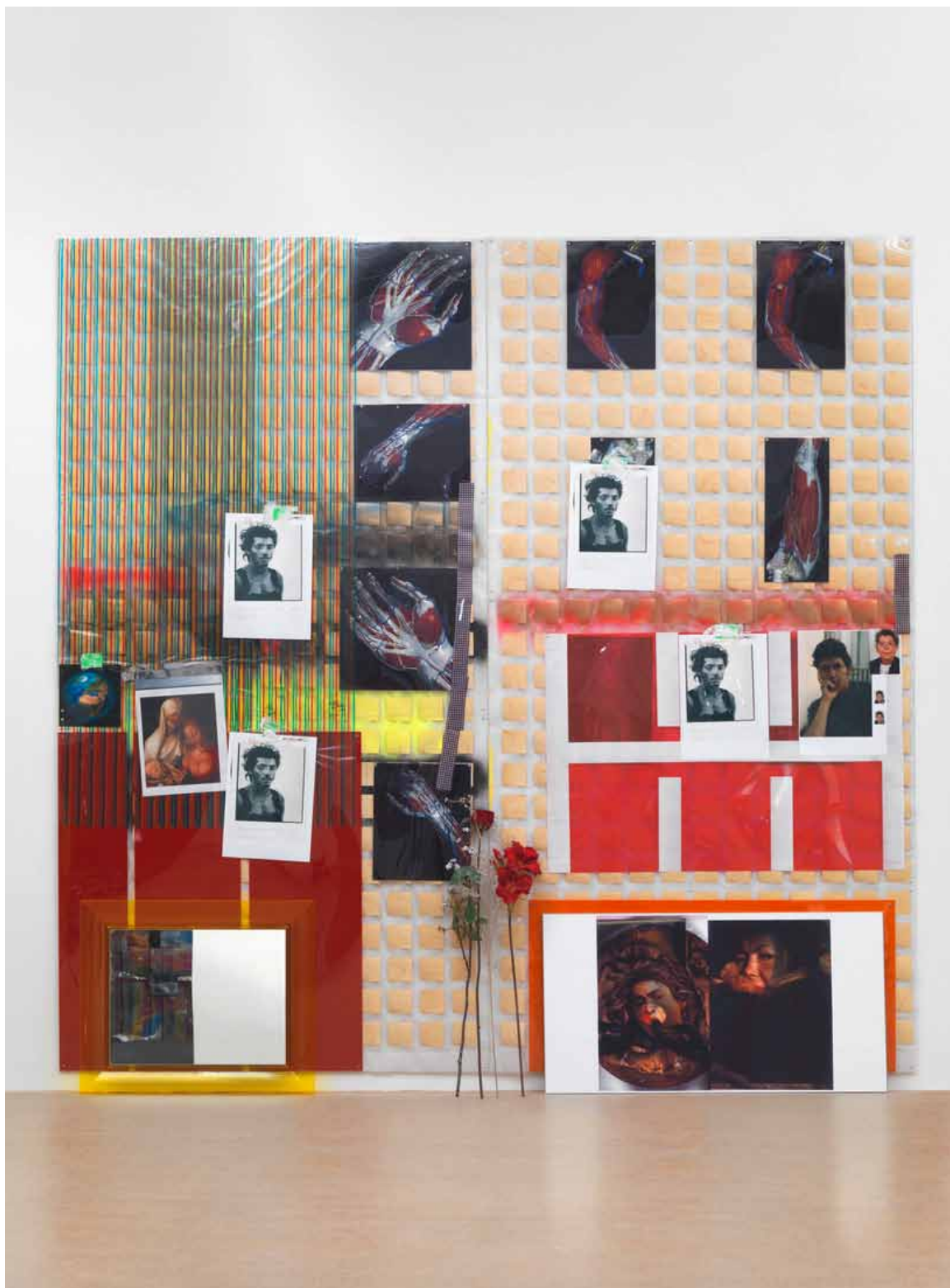
UNTITLED 2012 MIRROR, PLASTIC, COLOUR PRINTS, TAPE, PAINT, RIBBON, THREAD, ARTIFICIAL FLOWERS, SPRAYPAINT, PHOTOGRAPHS, FRAMES, PERSPEX 280 x 288.5 CM / 110 1/4 x 113 5/8 IN