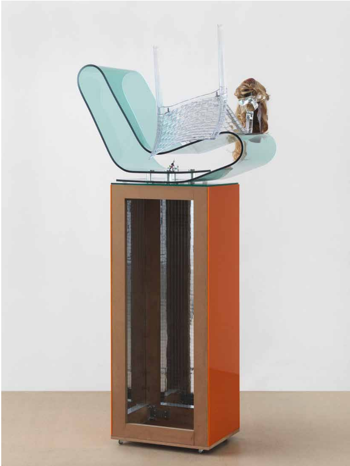
UNTITLED 2012 MDF, PLASTIC, GLASS, MIRROR FOIL, PERSPEX, GLASS AND PLASTIC FIGURES, MASK, TAPE, ARTIFICIAL HAIR, CASTERS 237 x 95 x 113 CM / 93 1/4 x 37 3/8 x 44 1/2 IN