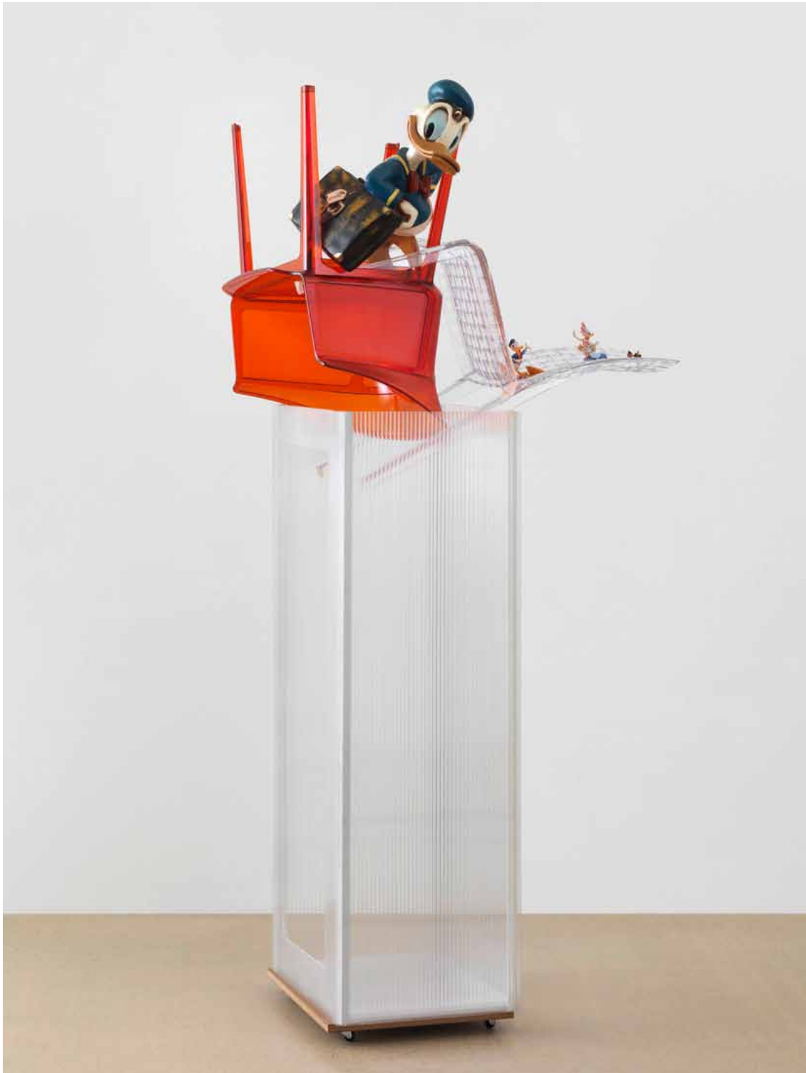
UNTITLED 2012 MDF, PLASTIC, GLASS, PERSPEX, PLASTIC, GLASS AND METAL FIGURES, STRING, ACRYLIC PAINT, CASTERS 225 x 102 x 62 CM / 88 5/8 x 40 1/8 x 24 3/8 IN