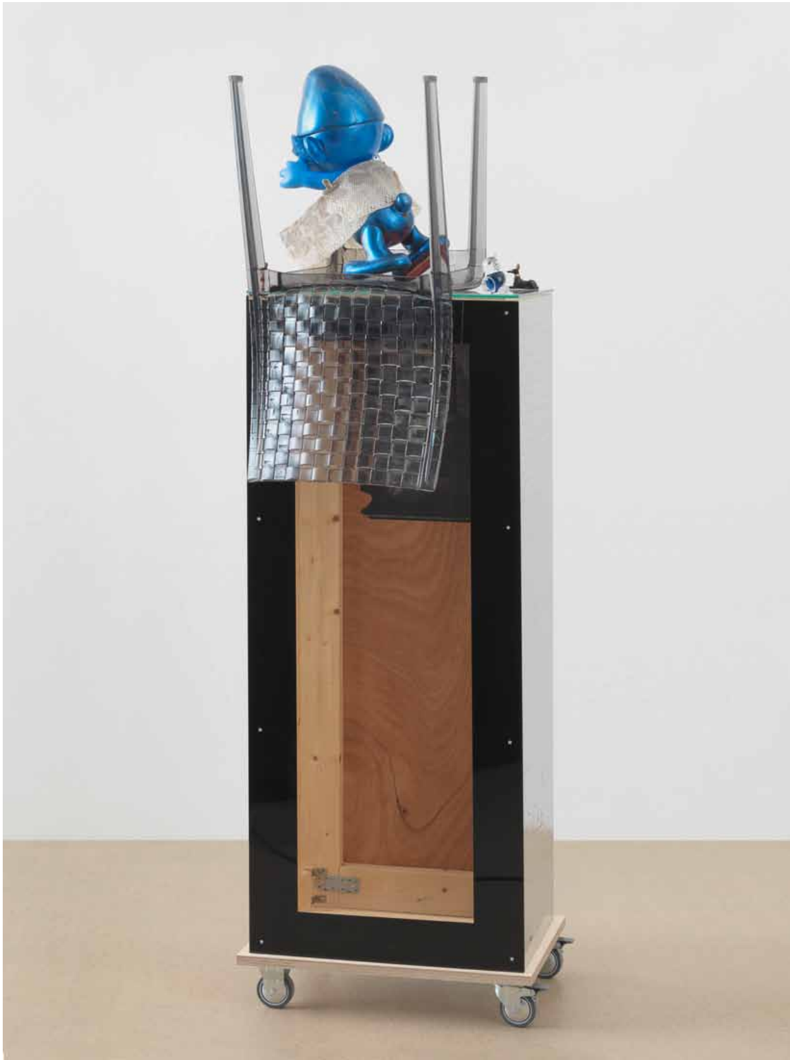
UNTITLED 2012 MDF, MIRROR FOIL, PERSPEX, PLASTIC, SNAKE SKIN, PLASTIC AND GLASS FIGURES, METAL, GLASS, SPRAYPAINT, CASTERS 200 x 62 x 63 CM / 78 3/4 x 24 3/8 x 24 3/4 IN