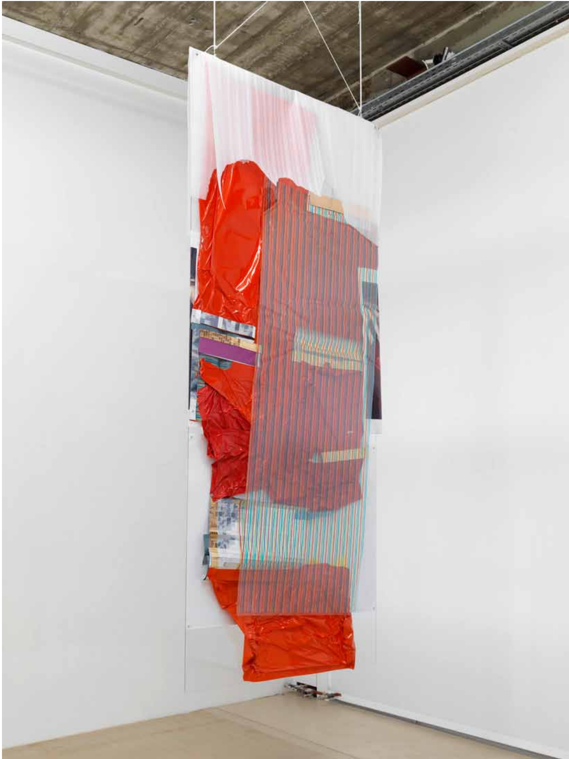
UNTITLED 2012 MIRROR FOIL, PLASTIC, COLOUR PRINTS, PAINT, PERSPEX 275 x 104 x 10 CM / 108 1/4 x 41 x 3 7/8 IN