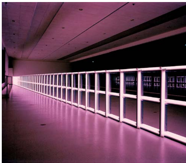
Dan Flavin, untitled , 1974. © 2018 Stephen Flavin/Artists Rights Society (ARS), New York. Courtesy Museum Boijmans Van Beuningen, Rotterdam

Opening reception: Thursday 15 November, 6–8 PM Press preview: Wednesday 14 November, 3 PM