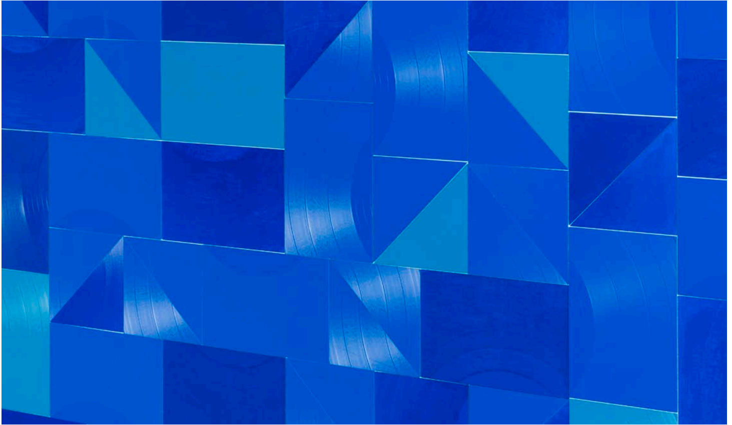
Ins Blaue (detail), 2018. Cut vinyl records, acrylic, canvas, wood 192 x 140 x 4.1 cm | 75.6 x 55.1 x 1.6 in