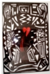
Hurt II , 2011