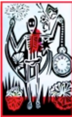
Tidlös I , 2012

Photography Ed. 3 + 1 AP 46 1/4 x 32 3/8 in.( 118,5 x 83,7 cm.) incl. frame