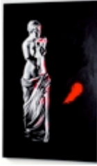
Venus med fjäder , 2012

Acrylic and marker pen on canvas 72 x 48 in.( 183 x 122 cm.)