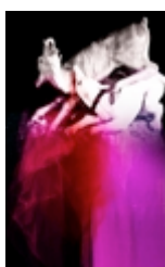
Attack III , 2012

47 3/8 x 72 1/16 in. ( 121,8 x 183,5 cm.)