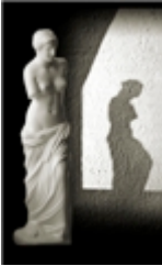
Venus med skugga , 2012

Acrylic and marker pen on canvas 72 x 48 in.( 183 x 122 cm.)