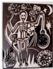
Tidlös II , 2011