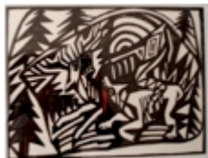
Attack II , 2011