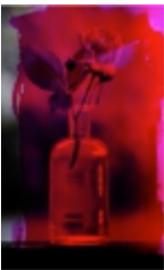
Karmosin , 2012

Acrylic and marker pen on canvas 72 x 48 in.( 183 x 122 cm.)