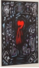
Hurt I , 2012

Acrylic and marker pen on canvas 72 x 48 in.( 183 x 122 cm.)