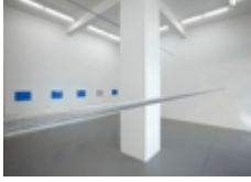
IVAR VALGARÐSSON Power Lines , 2012 aluminium power lines, diasec laminated c-prints Dimensions variable