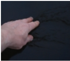
IVAR VALGARÐSSON Straumur / Current , 2012 inkjet print on archival paper paper: 30.3 x 32.6 cm framed: 33 x 34.7 cm edition of 30