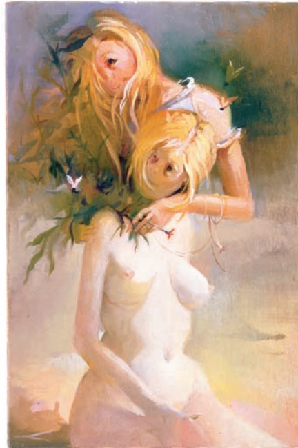
Little Kingdom , 2005. Oil on linen, 12 × 8 inches (30.5 × 20.3 cm)

large canvases, and yet others are one-of-a-kind compositions that only exist on an intimate scale. As places for experimenting with color, form, and characters as well as a variety of supports—including stretched and unstretched linen, canvas boards, wood, and paper—they play a remarkably dynamic and protean role within her work and continuously inspire new pictorial developments.