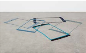
Latifa Echakhch Frames (bleu-noir, turquin, denim, ardoise, marine) , 2012 Floor installation of 5 carpets' borders Variable dimensions NG2450