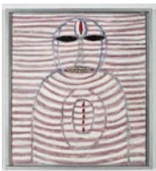
Hans Schärer Madonna, 1975 Mixed media on hardboard 35 3/8 x 31 1/2 inches (89.9 x 80 cm) 37 3/4 x 34 1/4 x 2 inches (95.8 x 87 x 5.1 cm) framed Signed and dated recto NG2313