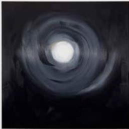
Ann Craven Moon (1/7/12, 10:55 PM), 2012 Oil on linen 72 x 72 inches (182.9 x 182.9 cm) NG2416