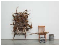
Kim Jones Mudman Structure (large), 1974, 1974 Structure: wood, tape, twine, cheesecloth, wax, paint and shellac. Head sculpture: mud, rope, foam, rubber, shellac and acrylic. Boots. Bucket. 75 x 95 x 20 inches (190.5 x 241.3 x 50.8 cm) NG2454