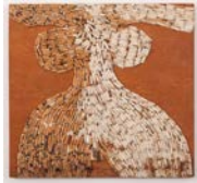
Al Hansen Quattrocento, 1978 Cigarettes on wood with gel medium 24 x 25 3/8 x 1 1/4 inches (61 x 64.5 x 3.2 cm) Signed and dated, with title verso NG2322