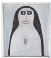
Hans Schärer Madonna 6, 1973 Mixed media on masonite 35 1/2 x 31 1/4 inches (90.2 x 79.4 cm) 38 5/8 x 33 3/4 x 2 inches (98.1 x 85.7 x 5.1 cm) framed Signed and dated recto NG2333