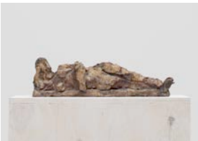
Hans Josephsohn Untitled , 1976 Brass 9 5/8 x 34 5/8 x 9 3/4 inches (24.4 x 87.9 x 24.8 cm) NG2306