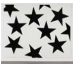
Joe Bradley Untitled, 2012 Screenprint on canvas 96 x 120 inches (243.8 x 304.8 cm) NG2429