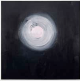
Ann Craven Moon (2/5/12, 10:55 PM), 2012 Oil on linen 72 x 72 inches (182.9 x 182.9 cm) NG2412

Reception Gallery (clockwise from entrance)