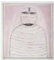
Hans Schärer Madonna, 1976 Mixed media on hardboard 35 5/8 x 31 1/2 inches (90.5 x 80 cm) 38 1/8 x 34 5/8 x 2 inches (96.8 x 87.9 x 5.1 cm) framed Signed and dated recto NG2345