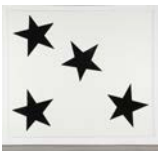
Joe Bradley Untitled, 2012 Screenprint on canvas 118 x 104 inches (299.7 x 264.2 cm) NG2430