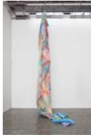
Sam Gilliam Close to Trees, 1990-2011 Acrylic on polypropylene Fabric: 228 x 72 x 72 inches (579.1 x 182.9 x 182.9 cm) Installation dimension variable NG2407