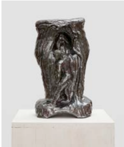
Andrew Lord Untitled , 2004 Ceramic 15 3/4 x 9 x 9 inches (40 x 22.9 x 22.9 cm) AND128