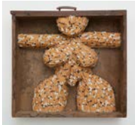
Al Hansen Androgyne Venus, 1986 Cigarette butts in wood drawer 18 3/4 x 19 3/4 x 4 1/2 inches (47.6 x 50.2 x 11.4 cm) Signed and dated, with title recto NG2319