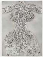
Al Hansen Silver Lady, 1976 Cigarette butts and spray enamel on wood 22 1/2 x 16 1/2 x 1 3/4 inches (57.2 x 41.9 x 4.4 cm) Title and date recto, signed and titled verso NG2318