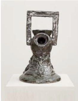
Andrew Lord Untitled, 2004 Ceramic, epoxy and silver leaf 19 1/4 x 11 1/2 x 12 inches (48.9 x 29.2 x 30.5 cm) NG2334

13 1/4 x 10 x 18 inches (33.7 x 25.4 x 45.7 cm) AND129