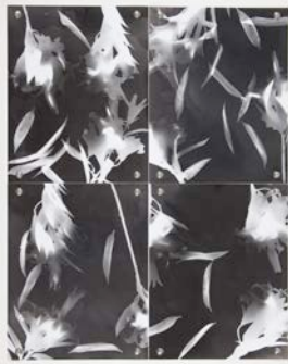
Amy Granat Lily #4 , 2012 B&W photo on RC paper 4 prints: 20 x 15 7/8 inches (50.8 x 40.3 cm) each 40 x 31 3/4 inches (101.6 x 80.6 cm) overall NG2446