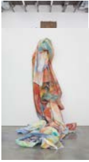
Sam Gilliam Wall Cascade, 1990-2011 Acrylic on polypropylene Fabric: 72 x 60 x 24 inches (182.9 x 152.4 x 61 cm) Installation dimension variable NG2406