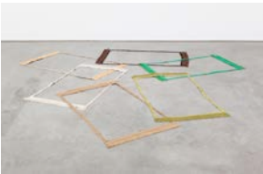
Latifa Echakhch Frames (olive, miel, beige, vert, brun, paille) , 2012 Floor installation of 7 carpets' borders Variable dimensions NG2451