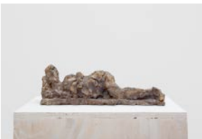
Hans Josephsohn Untitled , 1972 Brass 5 1/4 x 16 7/8 x 4 3/8 inches (13.3 x 42.9 x 11.1 cm) NG2309