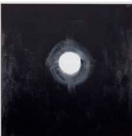
Ann Craven Moon (1/8/12, 9:30 PM, Mirrored), 2012 Oil on linen 72 x 72 inches (182.9 x 182.9 cm) NG2415