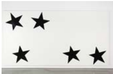
Joe Bradley Untitled, 2012 Screenprint on canvas 200 x 106 inches (508 x 269.2 cm) NG2428