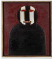
Hans Schärer Madonna, 1976 Mixed media 35 1/2 x 31 1/2 inches (90.2 x 80 cm) 38 3/8 x 34 1/4 x 2 inches (97.5 x 87 x 5.1 cm) framed Signed and dated recto NG2340