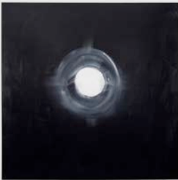
Ann Craven Moon (1/8/12, 9:30 PM), 2012 Oil on linen 72 x 72 inches (182.9 x 182.9 cm) NG2414