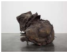
Peter Buggenhout The Blind Leading the Blind #35, 2010 Mixed media (polyurethane, epoxy, foam, polyester, polystyrene, household dust) 86 5/8 x 90 5/8 x 126 inches (220 x 230 x 320 cm) NG2327