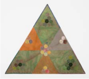
Alan Shields Cotten Pickin' Cotton Picker , 1979-80 Acrylic, thread on canvas 54 1/2 x 64 5/8 inches (138.4 x 164.1 cm) NG2434