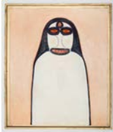
Hans Schärer Madonna, 1978 Mixed media on Fiberboard 47 1/4 x 39 1/4 inches (120 x 99.7 cm) 51 x 43 1/8 x 2 inches (129.5 x 109.5 x 5.1 cm) framed Signed and dated recto NG2341