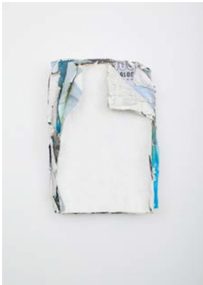
Klara Liden Untitled (Poster Painting), 2012 Posters and wheat paste 33 x 24 x 8 inches (83.8 x 61 x 20.3 cm) NG2457