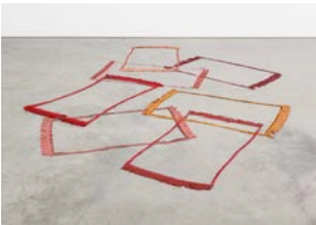
Latifa Echakhch Frames (sang, cuivre, vieux rose, carmin, tomette, mauve, grenat) , 2012 Floor installation of 7 carpets' borders Variable dimensions NG2409