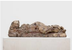
Hans Josephsohn Untitled , 1993 Brass 10 7/8 x 38 1/2 x 9 5/8 inches (27.6 x 97.8 x 24.4 cm) NG2307