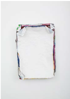
Klara Liden Untitled (Poster Painting), 2012 Posters and wheat paste 33 x 25 x 5 1/2 inches (83.8 x 63.5 x 14 cm) NG2458