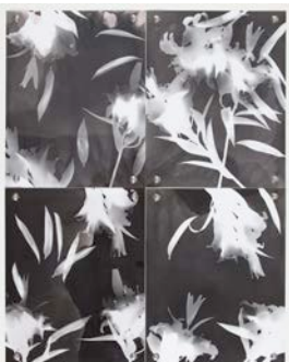
Amy Granat Lily #3 , 2012 B&W photo on RC paper 4 prints: 20 x 15 7/8 inches (50.8 x 40.3 cm) each 40 x 31 3/4 inches (101.6 x 80.6 cm) overall NG2445