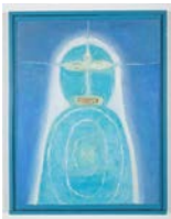
Hans Schärer Madonna, 1970/1974 Mixed media on fiberboard 35 1/2 x 27 3/8 inches (90.2 x 69.5 cm) 39 1/8 x 30 3/8 x 2 inches (99.4 x 77.2 x 5.1 cm) framed Signed and dated recto NG2342