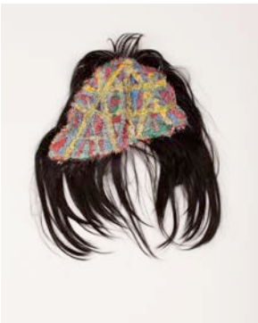
Kim Jones Mop 3 , 2009 Mixed media 24 1/2 x 18 x 1 3/8 inches (62.2 x 45.7 x 3.5 cm) NG2452