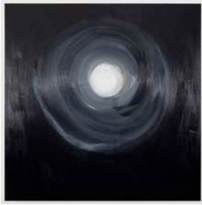
Ann Craven Moon (1/7/12, 10:55 PM, Mirrored) , 2012 Oil on linen 72 x 72 inches (182.9 x 182.9 cm) NG2417