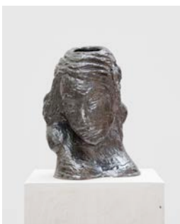
Andrew Lord Untitled , 2004 Ceramic