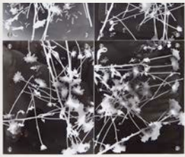
Amy Granat Pom Pom #2 , 2012 B&W photo on RC paper 4 prints: 20 x 15 7/8 inches (50.8 x 40.3 cm) each 40 x 31 3/4 inches (101.6 x 80.6 cm) overall NG2411