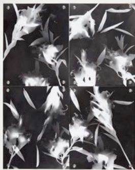
Amy Granat Lily #1 , 2012 B&W photo on RC paper 4 prints: 20 x 15 7/8 inches (50.8 x 40.3 cm) each 40 x 31 3/4 inches (101.6 x 80.6 cm) overall NG2443