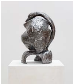
Andrew Lord Untitled , 2004 Ceramic, epoxy and silver leaf 16 1/4 x 12 x 11 inches (41.3 x 30.5 x 27.9 cm) NG2337