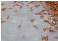
Martin Boyce Evaporated Pools, 2009 Paraffin coated crepe paper Installation dimensions variable NG2426