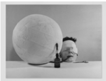
Rudolf Schwarzkogler 3. Aktion, Summer 1965 Silver gelatin print, mounted on cardboard 13 Parts: 11 5/8 x 15 1/4 inches (30 x 40) Edition of 40 NG2312