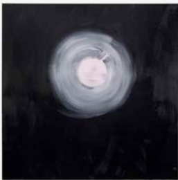
Ann Craven Moon (2/5/12, 10:55 PM, Mirrored), 2012 Oil on linen 72 x 72 inches (182.9 x 182.9 cm) NG2413