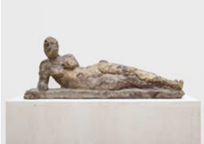
Hans Josephsohn Untitled , 1968 Brass 10 3/4 x 27 1/4 x 7 1/2 inches (27 x 69 x 19 cm) NG2311