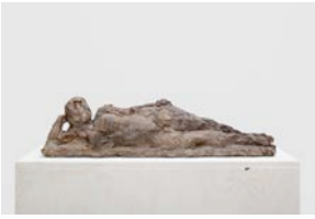
Hans Josephsohn Untitled , 1972 Brass 6 1/2 x 26 5/8 x 6 1/8 inches (16.5 x 67.6 x 15.6 cm) NG2310