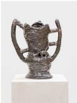
Andrew Lord Untitled , 2004 Ceramic 18 1/4 x 12 x 15 1/2 inches (46.4 x 30.5 x 39.4 cm) Signed and dated verso NG2331