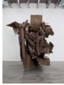
Peter Buggenhout The Blind Leading the Blind #48, 2012 Mixed media (household dust over a core of waste material) Approx. 157 1/2 x 118 1/8 x 118 1/8 inches (400 x 300 x 300cm) NG2329