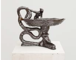
Andrew Lord Untitled , 2004 Ceramic, epoxy and silver leaf 15 1/2 x 18 3/4 x 16 3/4 inches (39.4 x 47.6 x 42.5 cm) NG2352

18 x 10 1/2 x 10 inches (45.7 x 26.7 x 25.4 cm) AND131