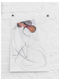
Giulio Delvè Untitled , 2012 Collage, graphyte on paper 59.4 x 42 cm (23 3/8" x 16 1/2") Unique