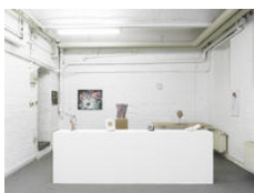
Giulio Delvè Azione Meccanica_ Exhibition View_ Supportico Lopez 2012, 2012 Unique