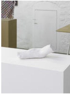
Giulio Delvè Mimi , 2012 Plaster 34 x 13 x 13.5 cm (13 3/8" x 5 1/8" x 5 3/8") Unique