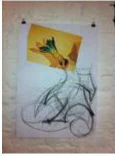
Giulio Delvè Untitled , 2012 collage, graphyte on paper 59.4 x 42 cm (23 3/8" x 16 1/2") Unique