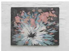
Giulio Delvè La parata dei rosa elefanti (Numero Uno) , 2012 Acrylic colors, plaster on mdf 63.5 x 79.5 x 3 cm (25" x 31 1/4" x 1 1/8") Unique