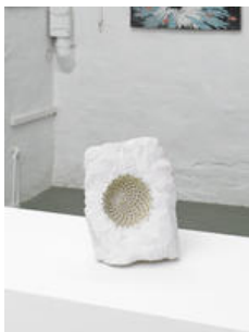
Giulio Delvè Settimo Chakra , 2012 Resin, plaster 23.5 x 20 x 19.5 cm (9 1/4" x 7 7/8" x 7 5/8") Unique