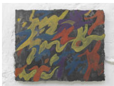
Giulio Delvè La parata dei rosa elefanti (Numero Due) , 2012 Acrylic colors, plaster on canvas 41 x 52 x 2 cm (16 1/8" x 20 1/2" x 3/4") Unique