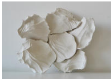
Giulio Delvè Untitled (mani) , 2011 Plaster 23 x 19 x 9 cm (9" x 7 1/2" x 3 1/2") Unique