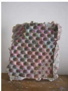
Giulio Delvè Untitled (suono) , 2011 plaster, pigments, mdf 39 x 37 x 10.5 cm (15 3/8" x 14 5/8" x 4 1/8") Unique