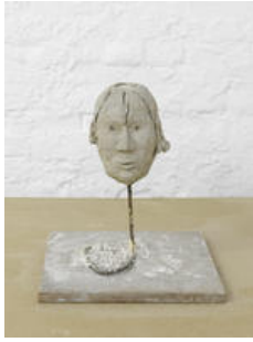
Giulio Delvè The head is on the table , 2012 Clay, iron, wood 40 x 37 x 39 cm (15 3/4" x 14 5/8" x 15 3/8") Unique