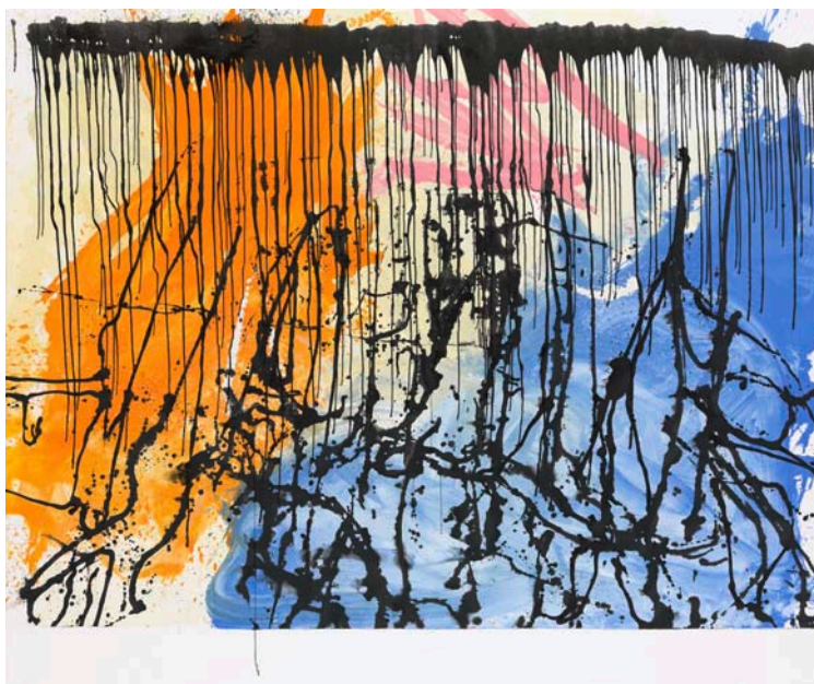
Georg Baselitz , Sandteichdamm , 2009 Oil on canvas, 250 x 300 cm © Georg Baselitz