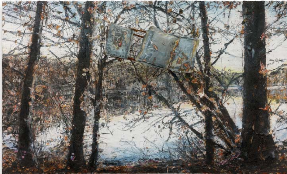
Anselm Kiefer, Untitled, 2015-2016 Huile, acrylique, émulsion, gomme-laque, plomb et métal sur toile 470 x 760 x 80 cm