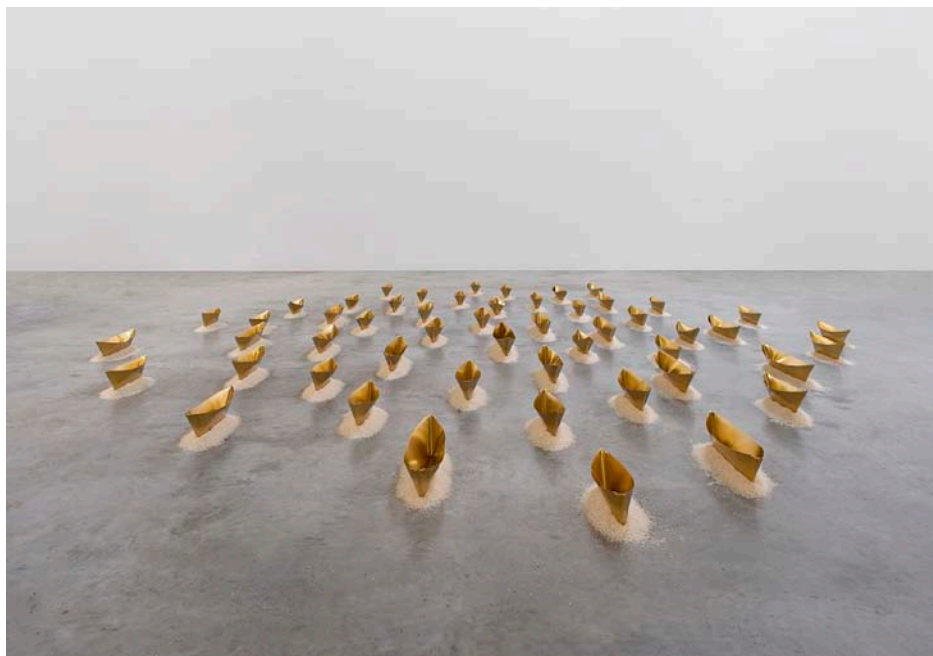
Wolfgang Laib, Passageway. Inside - Downside, 2011-12 52 Brass ships, rice each ship 13 x 15 x 56 - 76 cm