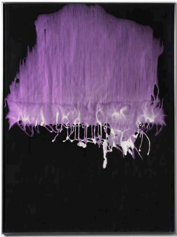
Sigmar Polke, Untitled , ca. 2000 Mixed media on paper, 199,5 x 150,3 x 5,5 cm © The Estate of Sigmar Polke