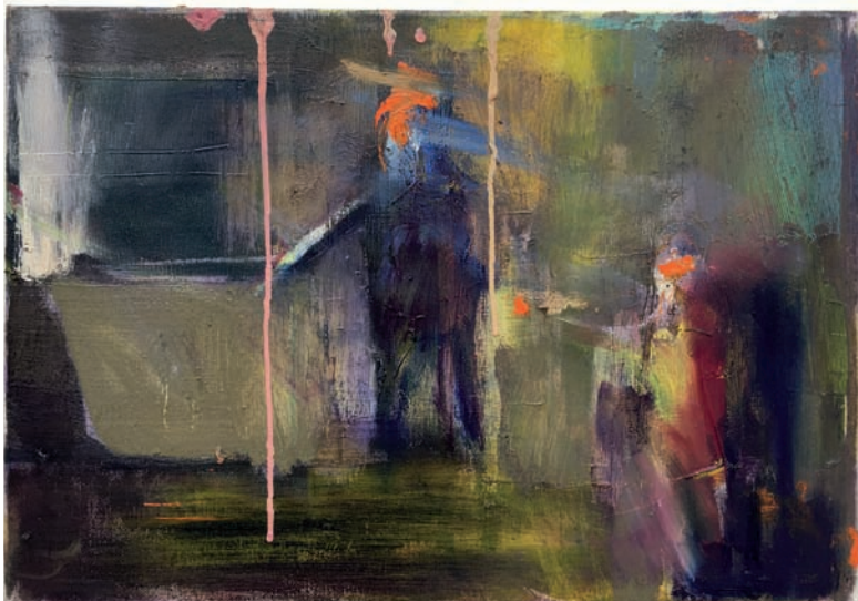
Lesson 1, 2018, oil on canvas, 35 x 50 cm