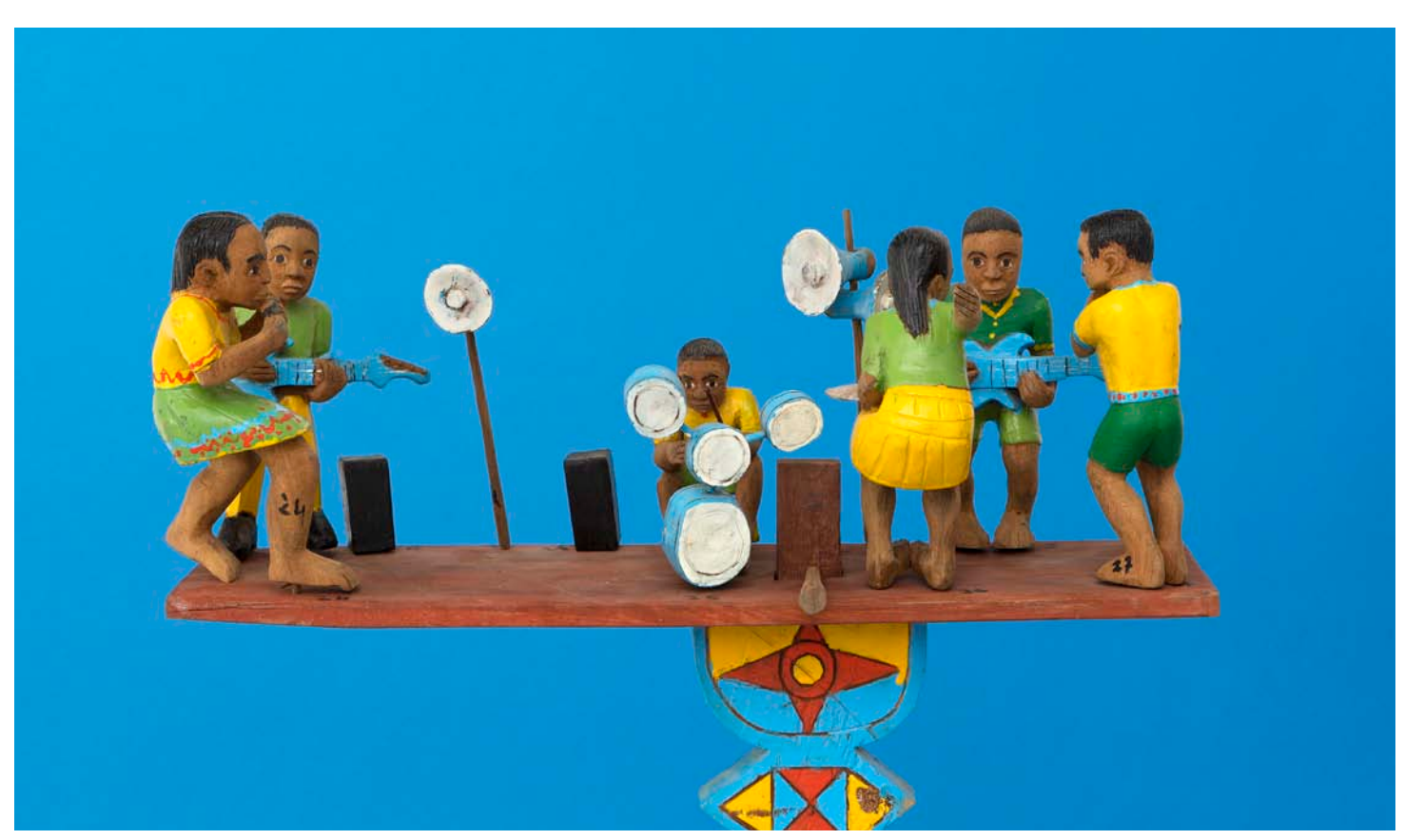
Jean Terry Efiaimbelo, "Tsapiky music band" 2016. Wood, paint. 177 x 54 x 20 | 69 11/16 x 21 1/4 x 7 7/8 in.