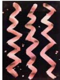
Untitled (#189-11) , 2011 Mixed media on paper 20 x 14 1/4 inches