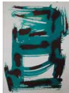
Untitled (#103-10) , 2010 Mixed media on paper 14 1/4 x 10 1/4 inches