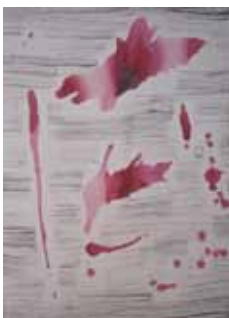
Untitled (#131-07), 2007 Mixed media on paper 17 x 13 inches