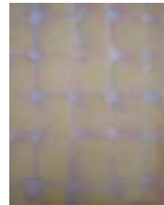
Untitled (#144-11) , 2011 Mixed media on paper 16 x 12 1/4 inches