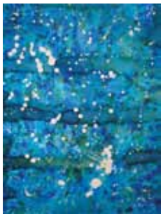
Untitled (#154-08) , 2008 Mixed media on paper 19 3/4 x 14 3/4 inches