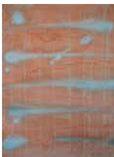
Untitled (#163-10), 2010 Mixed media on paper 24 x 18 inches