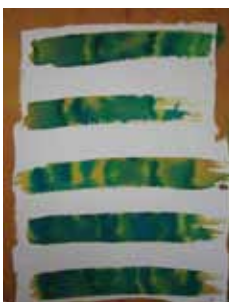
Untitled (#194-11), 2011 Mixed media on paper 20 x 14 1/4 inches