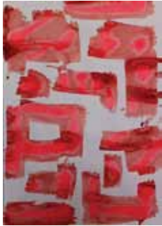
Untitled (#215-11) , 2011 Mixed media on paper 24 x 18 inches