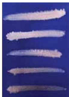
Untitled (#146-10) , 2010 Mixed media on paper 16 x 12 1/4 inches