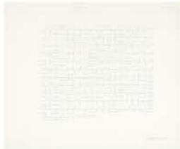
Guy de Cointet Stered our feet... , 1977 Ink and pencil on Paxton Bond paper 19 x 24 inches