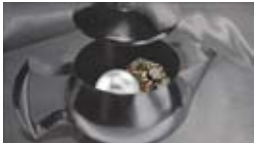
Agnieszka Polska The Plunderer's Dream 2011 HD video, 03:56 min