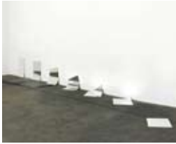
Alicja Kwade Vom zukünftigen Hintergrund unter anderer Bedingung betrachtet (7) , 2010 Mirrored-glass, seven parts 29 3/4 x 393 2/3 x 63 inches