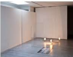
Alicja Kwade Teleportation (Nachttischlampe) , 2010 Glass, found lamp 49 1/4 x 47 1/4 x 31 1/2 inches