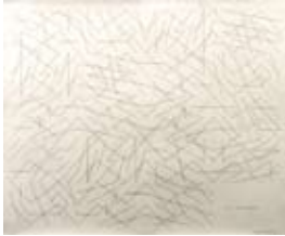
Guy de Cointet This is the new kitchen , 1980 Ink and pencil on paper 22 x 30 inches