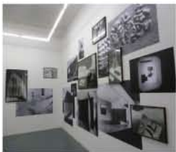
Alexandra Leykauf Untitled , 2012 Posters and silver print photographs Dimensions variable