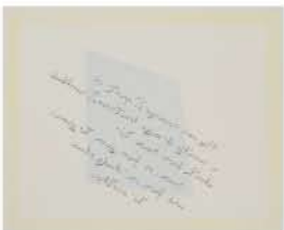
Guy de Cointet My own mornings I spent in a variety of ways , c. 1982 Ink and pencil on Arches paper 20 x 26 inches