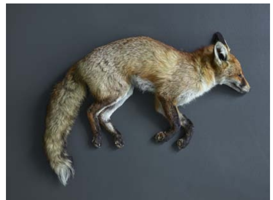
Thomas Struth, Rotfuchs (Vulpes vulpes) , Leibniz IZW, Berlin, 2017