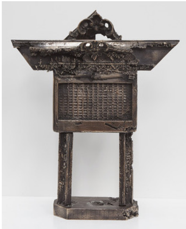
Joris Van de Moortel, Incense altar II , 2018. Bronze, 50 × 35 × 10 cm (16 7/8 × 13 3/4 × 3 7/8 in.)

Along with religion, music is the other main thread of Joris Van de Moortel's exhibition. It is present in his video Dance of life, must be heaven? , as well as in his various interpretations of the Dance of death and the Proverbs, which depict rather "loud" excesses to say the least. Music is there also in the series made after liturgical objects: gongs used during religious ceremonies ( Mezzo Spiral GONG and Straight GONG ), and altars in Incense altar I and II , which represent elements of past musical performances like speakers, amplifiers and cables, cast in bronze. Music goes hand in hand with religious rite. Joris Von de Moortel experienced it as a child when he assisted during mass and sang in choirs. Although remote, the experience continues to impact him, and occasioned a series of recent performances that resulted in the work SMOKE , from A Sunday Mass; De 7 sacramenten (glass, fire, white, smoke, nature, vandal) , in which the artist revisits the seven sacraments of the Catholic Church.