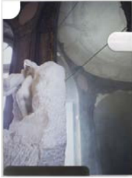
Buhuu Suite (love & ceiling) 2012 C-print, clip frame, stainless steel clips 11 3/4 x 15 3/4 inches; 30 x 40 cm (TBG 13703)