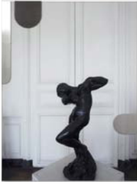
Buhuu Suite (dancer & door) 2012 C-print, clip frame, stainless steel clips 11 3/4 x 15 3/4 inches; 30 x 40 cm (TBG 13707)