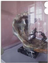
Buhuu Suite (Claudel wave) 2012 C-print, clip frame, stainless steel clips 11 3/4 x 15 3/4 inches; 30 x 40 cm (TBG 13709)