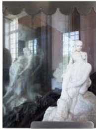
Buhuu Suite (Eternal Idol mirrored) 2012 C-print, clip frame, stainless steel clips 11 3/4 x 15 3/4 inches; 30 x 40 cm (TBG 13622)