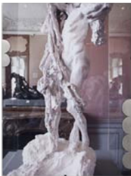
Buhuu Suite (Greisin) 2011 C-print, clip frame, stainless steel clips 11 3/4 x 15 3/4 inches; 30 x 40 cm (TBG 13704)