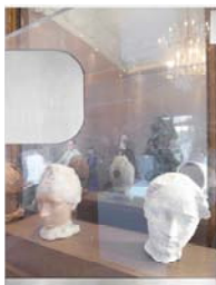
Buhuu Suite (white heads in vitrine) 2011 C-print, stainless steel clips, clip frame 15 3/4 x 11 3/4 inches; 40 x 30 cm (TBG 13661)