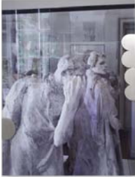
Buhuu Suite (Calais 3) 2012 C-print, clip frame, stainless steel clips 11 3/4 x 15 3/4 inches; 30 x 40 cm (TBG 13708)