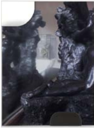
Buhuu Suite (big black) 2011 C-print, clip frame, stainless steel clips 11 3/4 x 15 3/4 inches; 30 x 40 cm (TBG 13702)