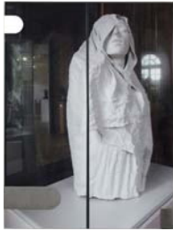
Buhuu Suite (split ghost) 2012 C-print, clip frame, stainless steel clips 11 3/4 x 15 3/4 inches; 30 x 40 cm (TBG 13623)