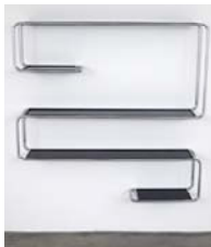
Wasserwandregal (#1) 2012 chrome-plated steel tubing, powdercoated zinc, water 59 x 61 x 12 3/4 inches; 150 x 155 x 32.5 cm (TBG 13620)