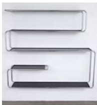
Wasserwandregal (#2) 2012 chrome-plated steel tubing, powdercoated zinc, water 59 x 67 x 12 3/4 inches; 150 x 170 x 32.5 cm (TBG 13621)