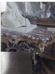
Buhuu Suite (marble table) 2012 C-print, clip frame, stainless steel clips 11 3/4 x 15 3/4 inches; 30 x 40 cm (TBG 13706)