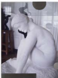
Buhuu Suite (marble girl) 2012 C-print, clip frame, stainless steel clips 11 3/4 x 15 3/4 inches; 30 x 40 cm (TBG 13710)