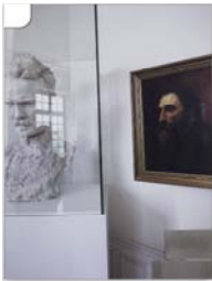
Buhuu Suite (Rochefort & painting) 2012 C-print, clip frame, stainless steel clips 11 3/4 x 15 3/4 inches; 30 x 40 cm (TBG 13705)