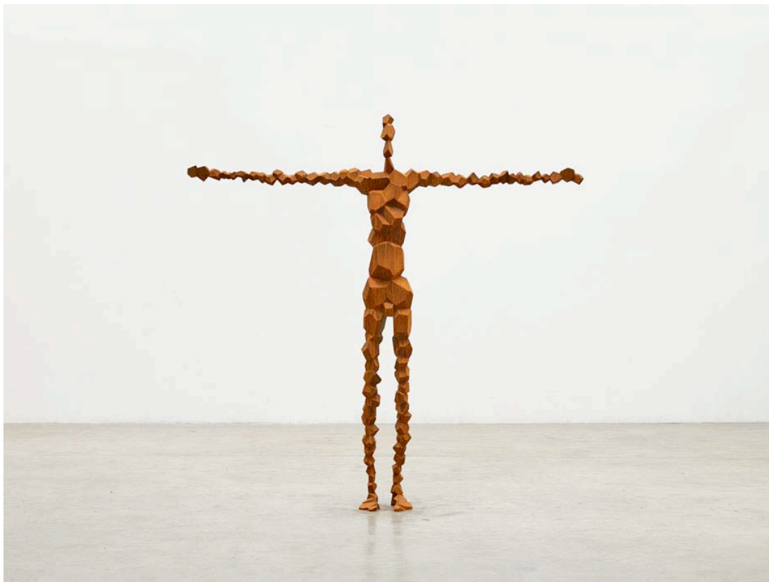
Antony Gormley, FIX , 2017, Cast iron, 194 x 194 x 26 cm © the artist.