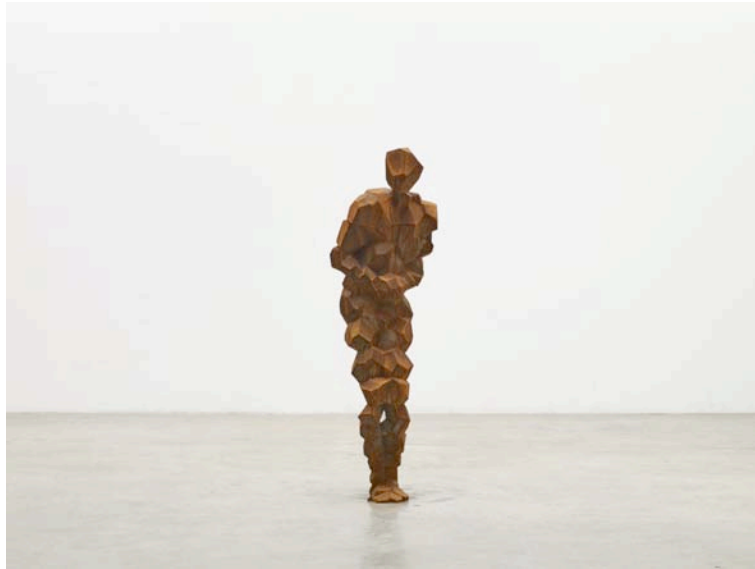
Antony Gormley , CONTRACT , 2016, Cast iron, 172,4 x 52,5 x 46,3 cm (67,87 x 20,67 x 18,23 in), Ed. 1 of 5