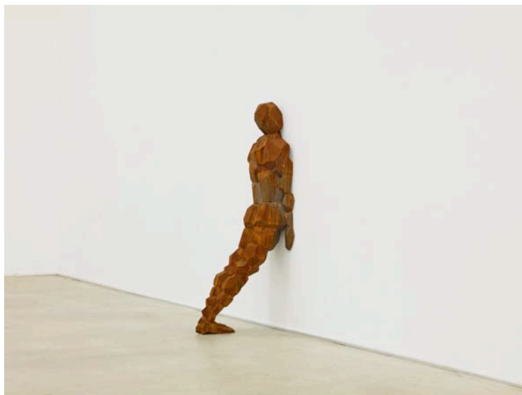
Antony Gormley , FRONT , 2016, Cast iron, 675 kg, 185 x 55,5 x 72 cm (72,83 x 21,85 x 28,35 in), Ed. 3 of 5

© the artist. Photograph by Stephen White, London Courtesy Galerie Thaddaeus Ropac London-Paris-Salzburg