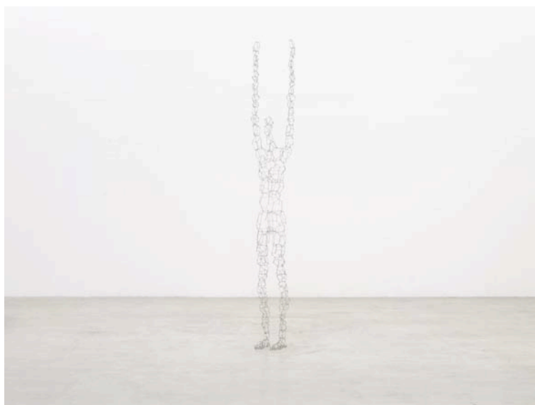
Antony Gormley , BOLT (NET) , 2017, 1,5 mm square section stainless steel bar, 1,2 kg, 252 x 37 x 28 cm (99,21 x 14,57 x 11,02 in)