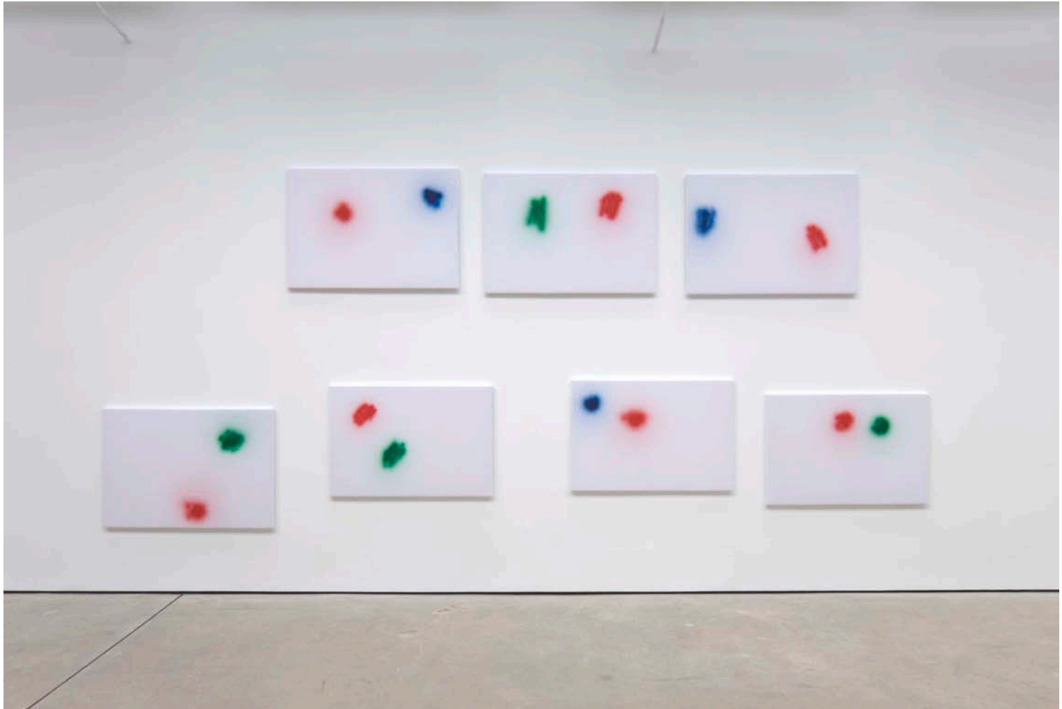
Pádraig Timoney Séan's Greens and Jack's Blues 2012 Sheep marking paint on polyester fleece 4 parts: each 71 x 101.5 x 2 cm, 3 parts: each 66 x 96.5 x 2 cm TMI-TIMOP-31351