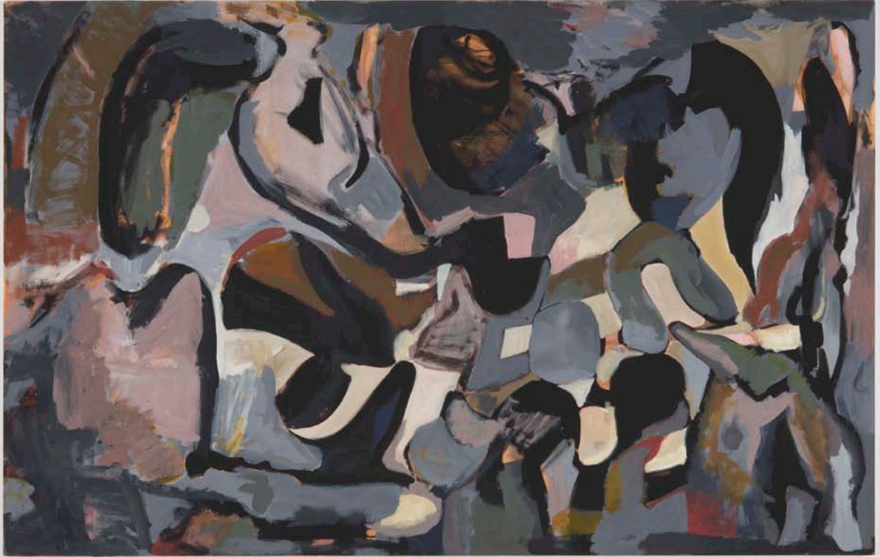
Pádraig Timoney Socotra 2012 Acrylic on Canvas 127 x 198.1 cm TMI-TIMOP-31049