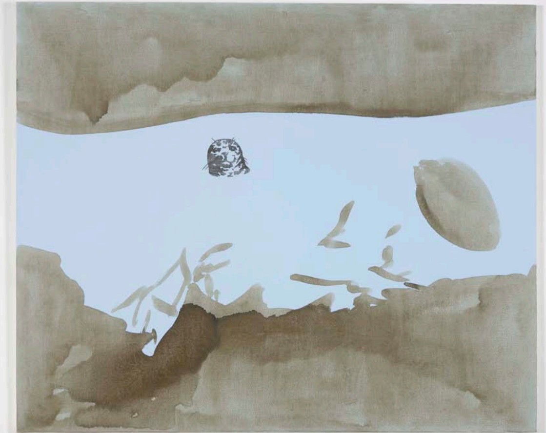
Pádraig Timoney Song to the Seals 2012 Acrylic and ink on canvas 134.6 x 162.6 cm TMI-TIMOP-31050