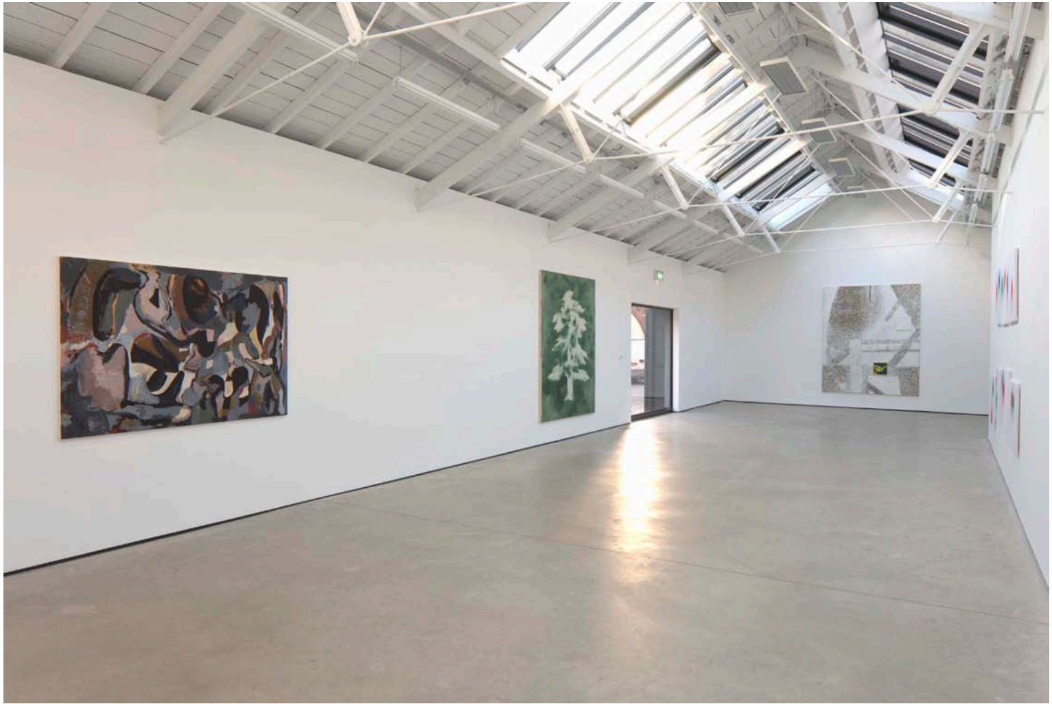
Pádraig Timoney Installation view Shepard Tone, The Modern Institute/Toby Webster Ltd, Glasgow, 2012