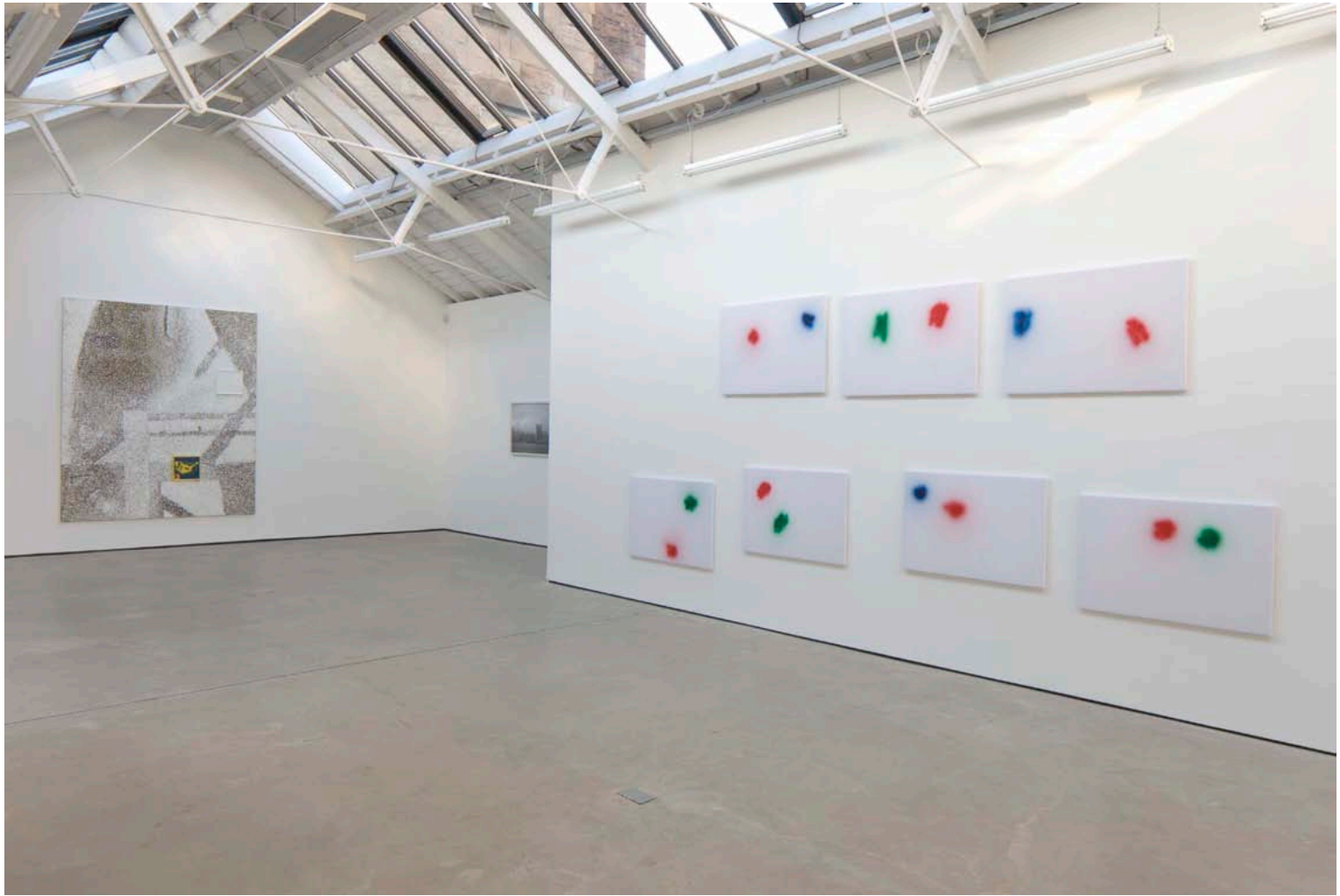
Pádraig Timoney Installation view Shepard Tone, The Modern Institute/Toby Webster Ltd, Glasgow, 2012