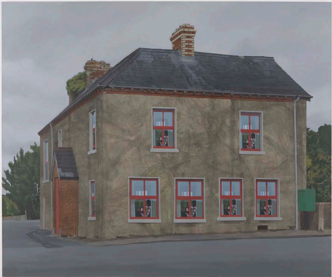
Pádraig Timoney The Great Supper 2012 Oil on Canvas 182.9 x 218.4 cm TMI-TIMOP-31048