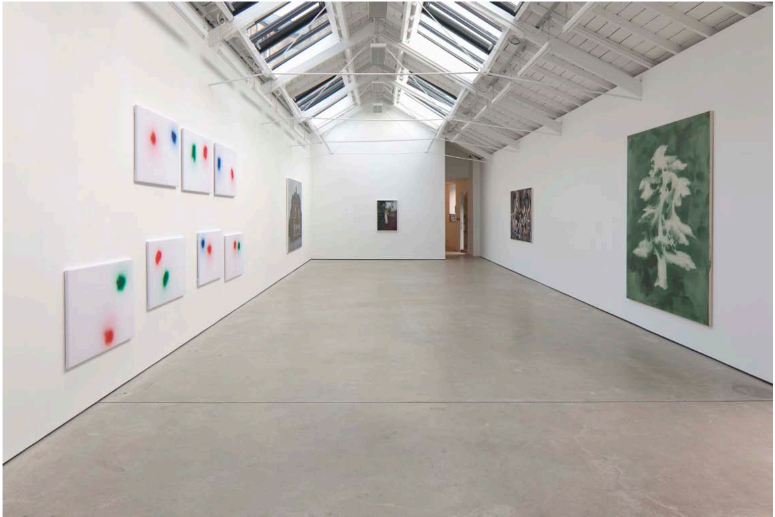
Pádraig Timoney Installation view Shepard Tone, The Modern Institute/Toby Webster Ltd, Glasgow, 2012