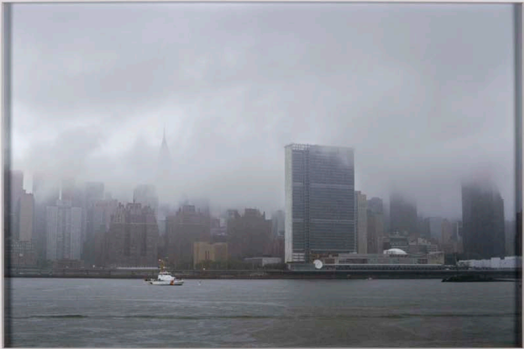
Pádraig Timoney 23 September 2012 CFlex on Dibond 66 x 99.1 cm unframed TMI-TIMOP-31052