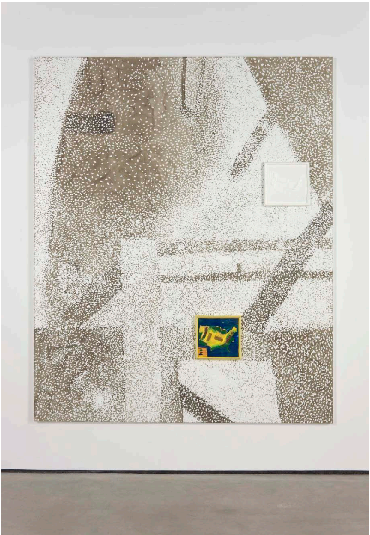
Pádraig Timoney Impact Crater 2012 Oil and Ink on canvas, plastic cast 259.1 x 210.8 cm TMI-TIMOP-31046