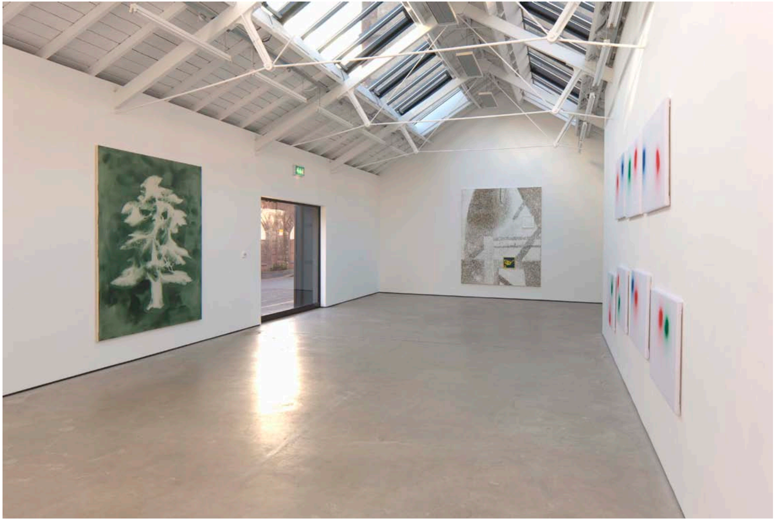
Pádraig Timoney Installation view Shepard Tone, The Modern Institute/Toby Webster Ltd, Glasgow, 2012