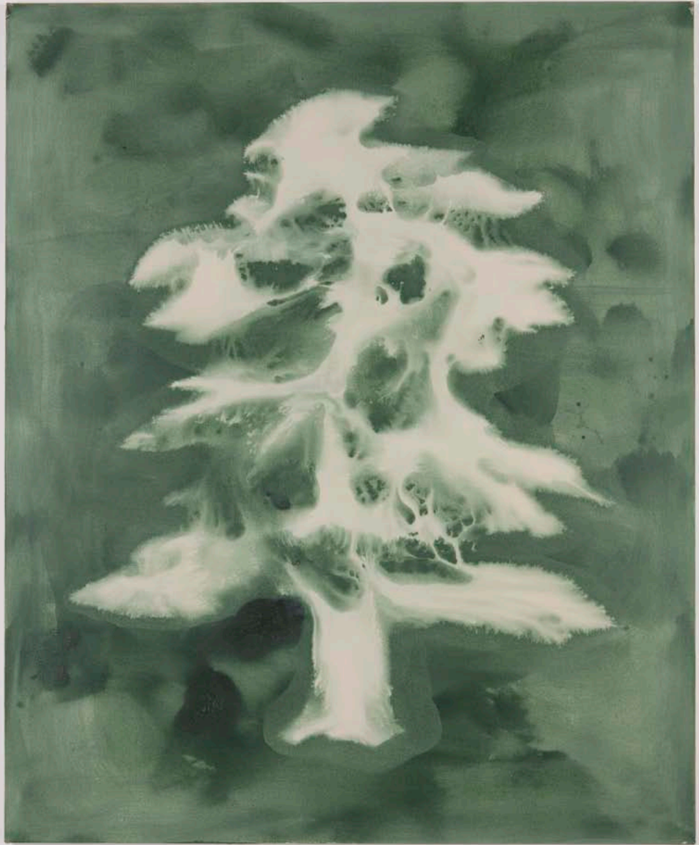
Pádraig Timoney Slow Fountain 2012 Rabbitskin glue and pigments on canvas 228.6 x 188 cm TMI-TIMOP-31047