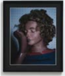
3CMAMR No.21, 2012 C print on Baryt, framed Paper size: 51 x 41 cm / 20 x 16 1/8 ins Framed: 62.5 x 52.5 cm / 24 5/8 x 20 5/8 ins