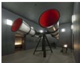
POLYMORPHOUS ORATORY , 2012