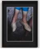
3CMAMR No.8, 2012 C print on Baryt, framed Paper size: 31.5 x 23.5 cm / 12 3/8 x 9 1/4 ins Framed: 42.5 x 32.5 cm / 16 3/4 x 12 3/4 ins Edition of 45 plus 5 APs