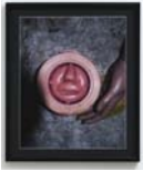
3CMAMR No.20, 2012 C print on Baryt, framed Paper size: 51 x 41 cm / 20 x 16 1/8 ins Framed: 62.5 x 52.5 cm / 24 5/8 x 20 5/8 ins