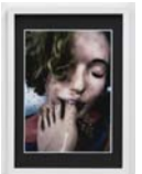
3CMAMR No.5, 2012 C print on Baryt, framed Paper size: 31.5 x 23.5 cm / 12 3/8 x 9 1/4 ins Framed: 42.5 x 32.5 cm / 16 3/4 x 12 3/4 ins