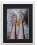
3CMAMR No.4, 2012 C print on Baryt, framed Paper size: 38 x 29 cm / 15 x 11 3/8 ins Framed: 52.5 x 42.5 cm / 20 5/8 x 16 3/4 ins