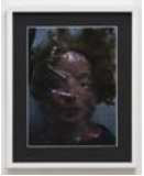
3CMAMR No.6, 2012 C print on Baryt, framed Paper size: 38 x 29 cm / 15 x 11 3/8 ins Framed: 52.5 x 42.5 cm / 20 5/8 x 16 3/4 ins