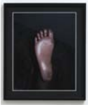
3CMAMR No.24, 2012 C print on Baryt, framed Paper size: 51 x 41 cm / 20 x 16 1/8 ins Framed: 62.5 x 52.5 cm / 24 5/8 x 20 5/8 ins