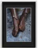
3CMAMR No.22, 2012 C print on Baryt, framed Paper size: 31.5 x 23.5 cm / 12 3/8 x 9 1/4 ins Framed: 42.5 x 32.5 cm / 16 3/4 x 12 3/4 ins