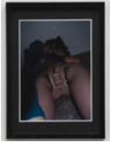
3CMAMR No.7 (Sleep), 2012 C print on Baryt, framed Paper size: 31.5 x 23.5 cm / 12 3/8 x 9 1/4 ins Framed: 42.5 x 32.5 cm / 16 3/4 x 12 3/4 ins