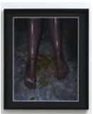
3CMAMR No.9, 2012 C print on Baryt, framed Paper size: 51 x 41 cm / 20 x 16 1/8 ins Framed: 62.5 x 52.5 cm / 24 5/8 x 20 5/8 ins