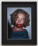
3CMAMR No.23, 2012 C print on Baryt, framed Paper size: 38 x 29 cm / 15 x 11 3/8 ins Framed: 52.5 x 42.5 cm / 20 5/8 x 16 3/4 ins