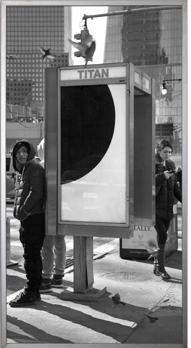
Water Tower 26"x50", Stolen advertising frame, Giclee print. 2015