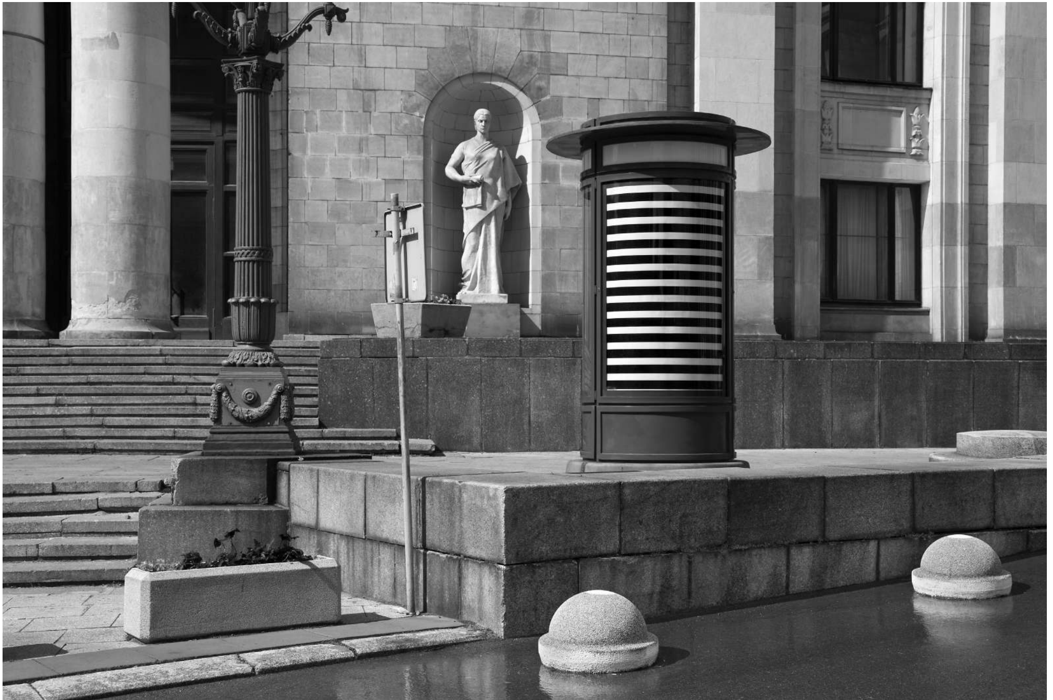
Republika: Warsaw, Poland. 2017 (27"x40" Edition of 5+2AP, 40"x60" Edition of 5+2AP. Giclee print with digital augmentation)