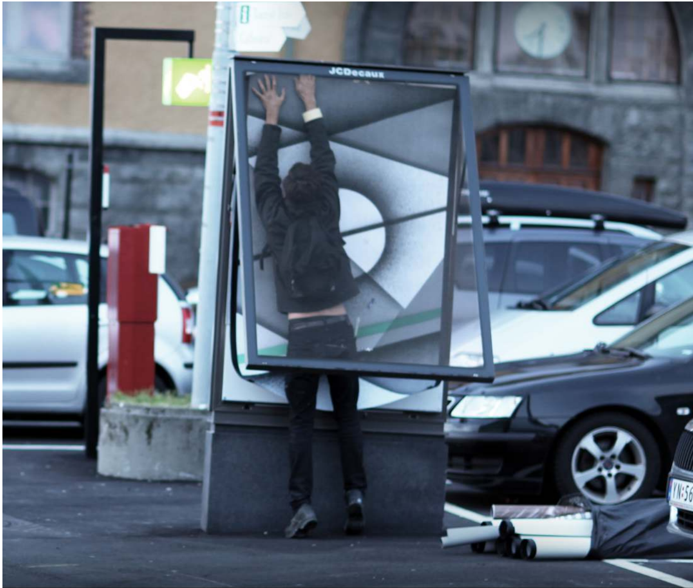
Unauthorized Installation, Stavanger , Norway 2012