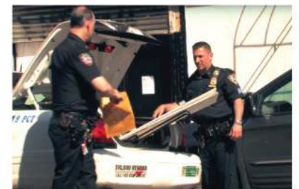
NYSAT: (New York Street Advertising Takeover) large scale participatory civil disobedience project, New York, 2009