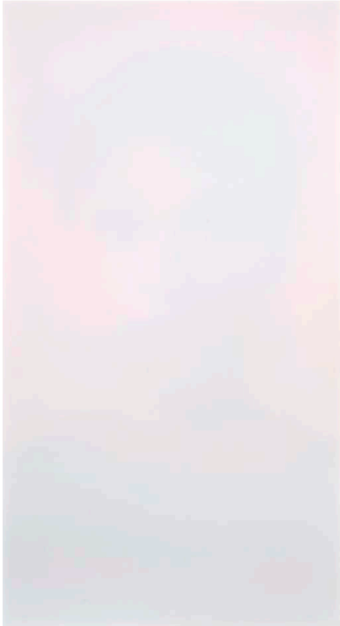
Insecure 26"x48.25" 2017 (stolen advertising, stolen plexi-glass, paint)

The works from his newest series "Labor," are equally direct. In the back of the gallery, the noise of the city is replaced by the silence of the white cube as these works blend into the walls. Context, environment and the need for attention are stripped away in reductive illustrations that remove advertising first from public space and then of its own image. The result is minimal, and the effort to remove the advertisement immense. These are subtle works that are simultaneously obscure and heavy like the sense of civic duty Seiler employs in a generous approach to making art. The labor pieces are made by dressing up as a worker and driving around the city stealing advertising and the plexiglass that normally sits behind the ads to diffuse the backlighting that illuminates them at night. The advertisements are then taken into the studio where the text is painted out leaving only image. The plexi is then sanded down until it is cleaned of any blemishes and feels as close to a marble surface as possible. Each sanded piece is then layered on top of the ad until it is obscured to a point of satisfaction. Sometimes this makes it difficult to tell what you are looking at. The ghost ad images are tangible representations of the labor we all put in on a daily basis in the service of advertising and commercial media, consciously, but more often subconsciously.