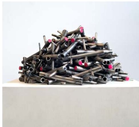
PublicAccess: Functional key sculptures, 2015-ongoing (metal, rubber, dimensions variable)

Over more than 15 years, clear motivation has matured into an extremely social and often participatory form of practice. Part of this practice involves the production of resources, tools and the initiation of large-scale collaborations such as “NOAD” or “NYSAT”. The other, focuses on the creation of personal bodies of work, which explore the locations, materials and messages involved in the reclaiming of physical public space and the potential revealed by an absence of advertising. This duality is perhaps best articulated in his ongoing series of “PublicAccess” sculptures, which incidentally act as skeleton keys for most public advertising frames. While these are art objects and not intended for use, following their purchase, hundreds of buyers around the world have sent the artist images of their ad takeovers.