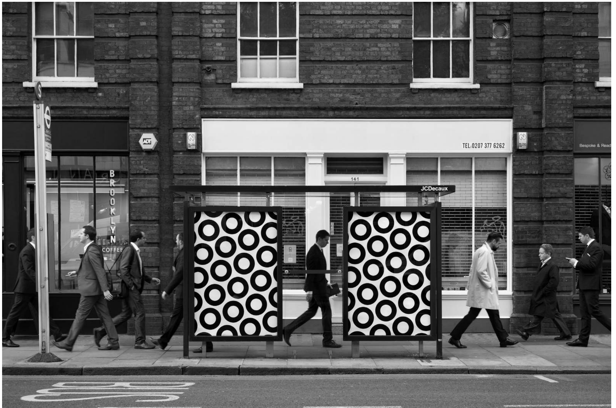
Suited : London, England, 2016 (27"x40" Edition of 5+2AP, Giclee print with digital augmentation)