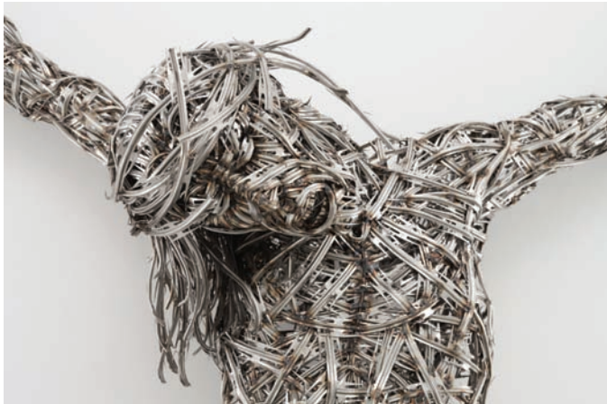
Décor , 2012 (detail). Razor wire.

Four elements, each: 86 x 70 x 24 inches (218.4 x 177.8 x 61 cm).