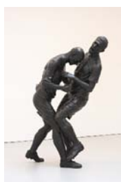
Adel Abdessemed coup de tête , 2012 Resin 88 1/2 x 62 x 37 1/2 inches 224.8 x 157.5 x 95.3 cm Certificate of Authenticity ABDAD0378