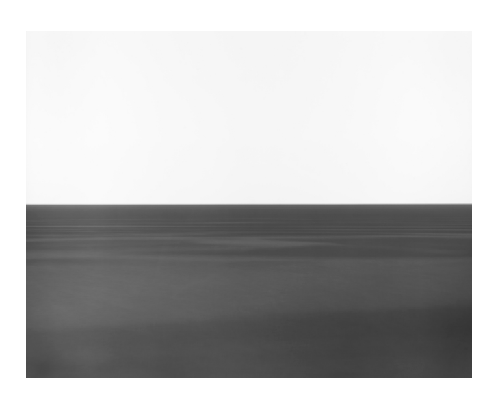
Tasman Sea, Marion Bay, 2017 Gelatin Silver Print, Neg. #604, 47 \times 58 3/4 in. (119.4 x 149.2 cm) Ed. of 5

Snow White, a new limited edition book published by Damiani, will be launched at Librairie Marian Goodman, Paris, on the 28<sup>th</sup> of October from 5:30 to 6:00pm, before the opening reception at the gallery. The artist will be present.