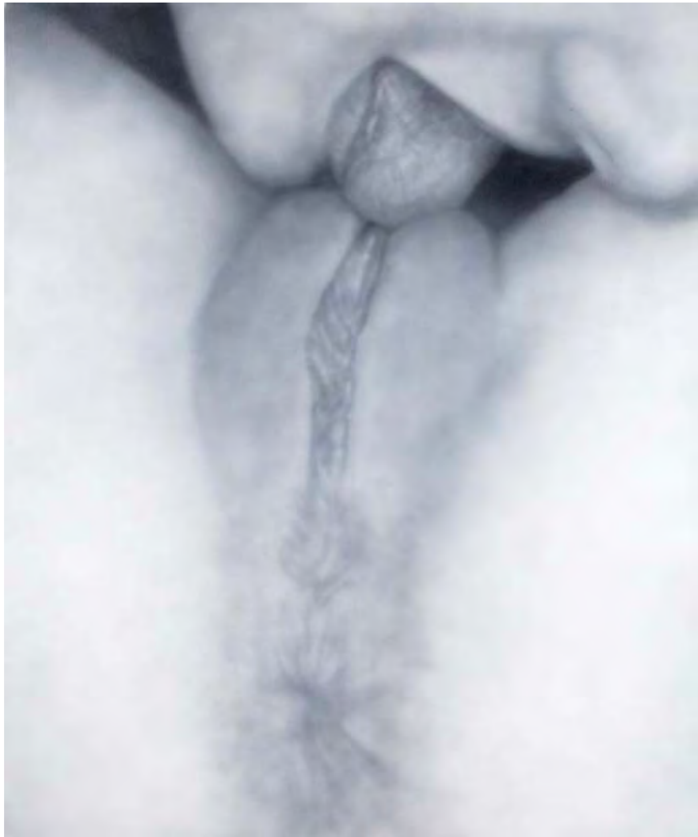
Girl on girl painting #4 2011 Acrylic on Canvas 182.9 x 152.4 cm 72 x 60 in