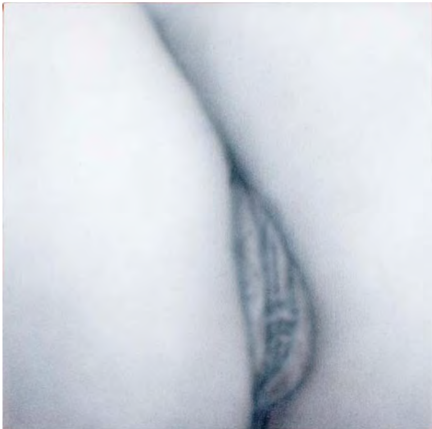
Pussy Painting #10 2011 Acrylic on Canvas 40.6 x 40.6 cm 16 x 16 in