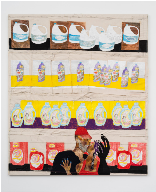
Tschabalala Self, Fresh , 2017, acrylic, watercolour, flashe, coloured pencil, crayon, hand-coloured photocopy, hand-coloured canvas and faux jewel on canvas, 243.8 x 213.3 cm

Pilar Corrias Gallery is pleased to present Tschabalala Self's inaugural solo exhibition, Bodega Run , which focuses on the socio-political site of the New York City bodega.