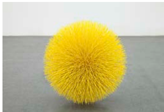
Untitled (sun), 2012