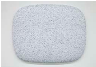
Untitled (pixelated static), 2012 Styrofoam and paint A sheet of Styrofoam was carved into a form simulating the curvature of an old television screen. A grid was then drawn onto the surface. A photograph of television static was pixelated, then printed as a value reference for squares cut out of paint adhered to the surface within the grid. 35 x 43 1/2 x 3 3/4 inches (88.9 x 110.49 x 9.53 cm)