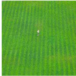
Untitled (kite), 2012