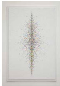
Untitled (bscsb), 2012 Styrofoam, paint and paper on board 60 1/4 x 39 1/2 inches (153.04 x 100.33 cm)