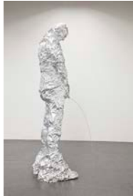
Untitled (peeing figure), 2012 Stainless steel Edition 1 of 3 From an edition of 3 and 2 artist's proofs Figure: 96 x 30 x 27 inches (243.84 x 76.2 x 68.58 cm) Urine stream: 56 x 10 x 1/2 inches (142.24 x 25.4 x 1.27 cm)