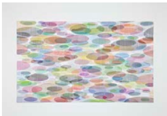
Untitled (lily pads), 2012 Collage Three separate collages, each the same size, were made with circles cut from various magazines. Each collage was then cut into 1/8 inch strips and combined systematically into one collage. 41 3/4 x 71 inches (106.05 x 180.34 cm)