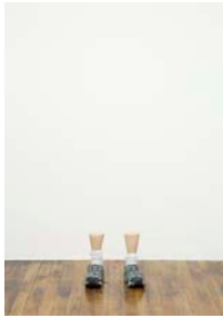
Untitled (nobody), 2012 Styrofoam and paint 13 x 16 1/2 x 11 1/2 inches (33.02 x 41.91 x 29.21 cm)