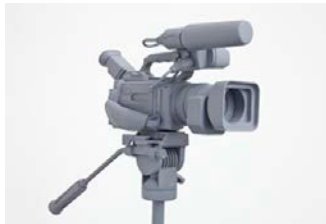
Untitled (video camera), 2012