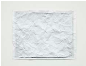
Untitled (wrinkled photo), 2012 Unique black and white photograph 16 7/8 x 21 11/16 inches (42.86 x 55.09 cm)