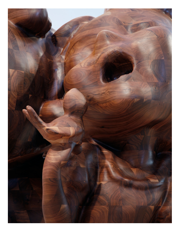
Here, McCarthy has become the producer of a parallel Hollywood, employing tactics of the film industry to recast adored icons in deviant roles. Behind the endearing, prepackaged Disney façade that dictates the American surface lurk wild, untamed urges that McCarthy unleashes with deftness and humor.

The exhibition presents these works in juxtaposition with a group of McCarthy's Brown Rothkos, sculptural, monochromatic wall hangings comprised of carpet covered in foam and sprayable polyurethane coating. Carpet, a regularly used ground material supporting the artist's large-scale performative installations, has been 'elevated' here from the floor to the walls, and repurposed as a medium for expression. During the making of the vast set for 'WS,' McCarthy's monumental multimedia work presented at the Park Avenue Armory in 2013, McCarthy intentionally placed carpets under the forest's fantastical trees, allowing residue from their fabrication to adhere to the surface of the carpets. As the individual trees were rotated and sprayed with coating, the foam and polyurethane dropped onto the carpets, a deliberate action orchestrated by the artist. Over the course of the formation of the forest, McCarthy examined the carpets and moved them accordingly to achieve desired variations in surface, texture, and thickness. The final collection of specifically selected wall hangings on view in this exhibition showcases the boundlessness of McCarthy's own performance as 'artist' and the purposeful transfer of energy leading to an ensuing action of calculated creation.