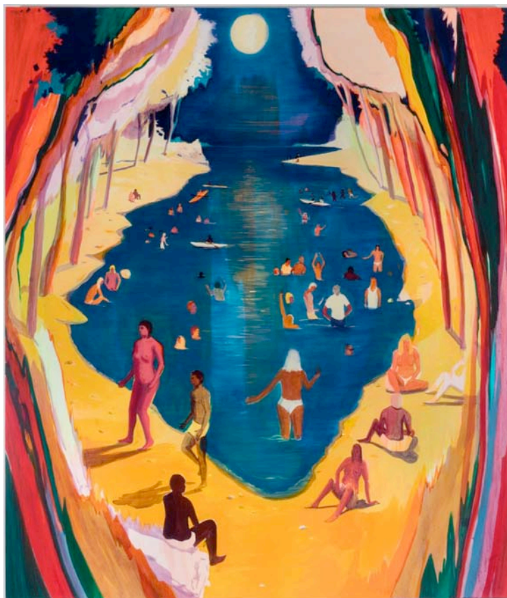
Jules de Balincourt , Cradle Cove , 2017, Oil on panel, 152,4 x 177,8 cm Courtesy Galerie Thaddaeus Ropac London·Paris·Salzburg © Jules de Balincourt. Photo: Artist Studio