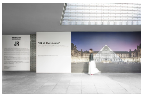
Facade of Perrotin Tokyo by JR.

Pierre Le-Tan is an internationally renowned illustrator who came to prominence in 1968 at the age of eighteen when he produced the first of what was to be many covers for The New Yorker. He has contributed to several other periodicals including Vogue, The New York Times, The Washington Post, Harper's Bazaar, Town and Country and Rolling Stone, and has authored and illustrated many books. Le-Tan has conceived among others three books with his friend Patrick Modiano (recipient of the 2014 Nobel Prize in Literature) and he will publish a book on the city of Paris next year. Le-Tan's drawings delicately unveil the quintessence of the parisian spirit of the past & the present... His work has been shown at numerous museums and galleries, including the Museo Nacional Centro de Arte Reina Sofia in Madrid, which presented a major retrospective exhibition in 2004. Pierre Le-Tan was born in 1950, he lives in Paris.