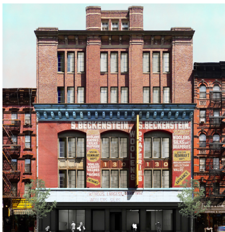
New York 130 Orchard Street, Lower East Side