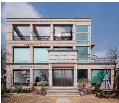
Seoul 5 Palpan-Gil, Jongno-Gu