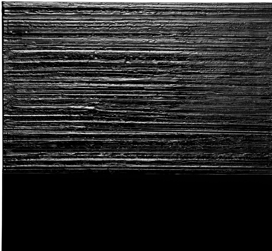
"Peinture, 149 x 165 cm, 3 janvier 2017" Acrylic on canvas. 149 x 165 cm / 58 11/16 x 64 15/16 in

His radically abstract painting makes reference neither to images nor to language. It offers neither representation, nor figuration, nor narration, nor message, and yet it is not pure formalism: it accepts that the viewer interprets it freely for himself. An absolutely original body of work, forcefully disruptive, that does not resort to the crutch of a reference, even indirect, to the outside world, either in its forms or its titles, as opposed to many of the informal or non-figurative abstract works of the period. By the same token, Soulages' œuvre requires its viewer to address the question of meaning himself. In 1948, on the occasion of the exhibition in Germany, Soulages wrote this striking formula: Painting is an organization, a collection of relationships between forms (lines, colored surfaces) on which the meanings we attribute to it come together and break apart.