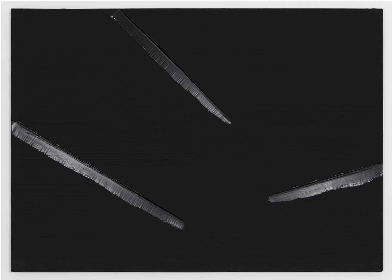
"Peinture, 157 × 222 cm, 28 février 2011". Acrylic on canvas, 157 × 222 cm / 61 13/16 × 87 3/8 in

On the occasion of the opening of Perrotin Tokyo, the gallery is honored to present a solo exhibition of Pierre Soulages, bringing together a collection of recent paintings.