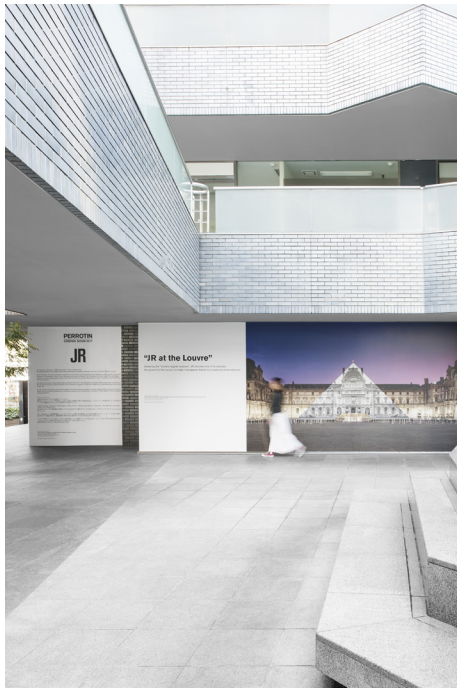
Facade of Perrotin Tokyo by JR. ©JR-ART.NET Photo: MASA (PHOEBE)