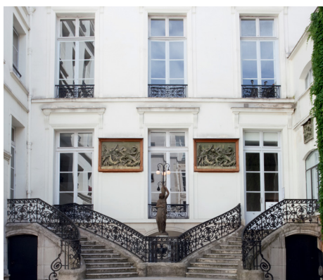
Paris 76 rue de Turenne, Marais