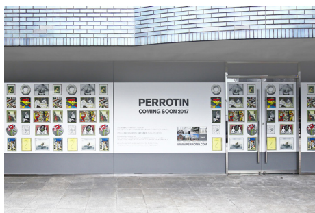
Facade of Perrotin Tokyo at Piramide Building, Wallpaper by Pierre Le-Tan.