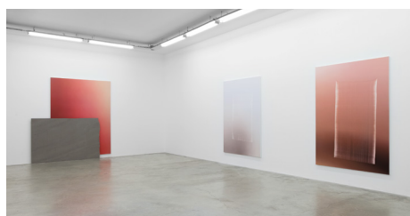
Pieter Vermeersch exhibition at Perrotin Paris

Solo shows of JR's work have been exhibited in galleries and museums worldwide, including The Rath Museum in Geneva (Switzerland), Tokyo's Watari Museum (Japan), The Contemporary Art Museum in Dallas (USA), The Contemporary Arts Center in Cincinnati (USA), the Museum Frieder Burda, Baden-Baden (Germany), Power Station of Arts in Shanghai (China), and "Au Panthéon", Paris (France) a monumental installation surrounds the drum of the Pantheon's dome until the end of its renovation.