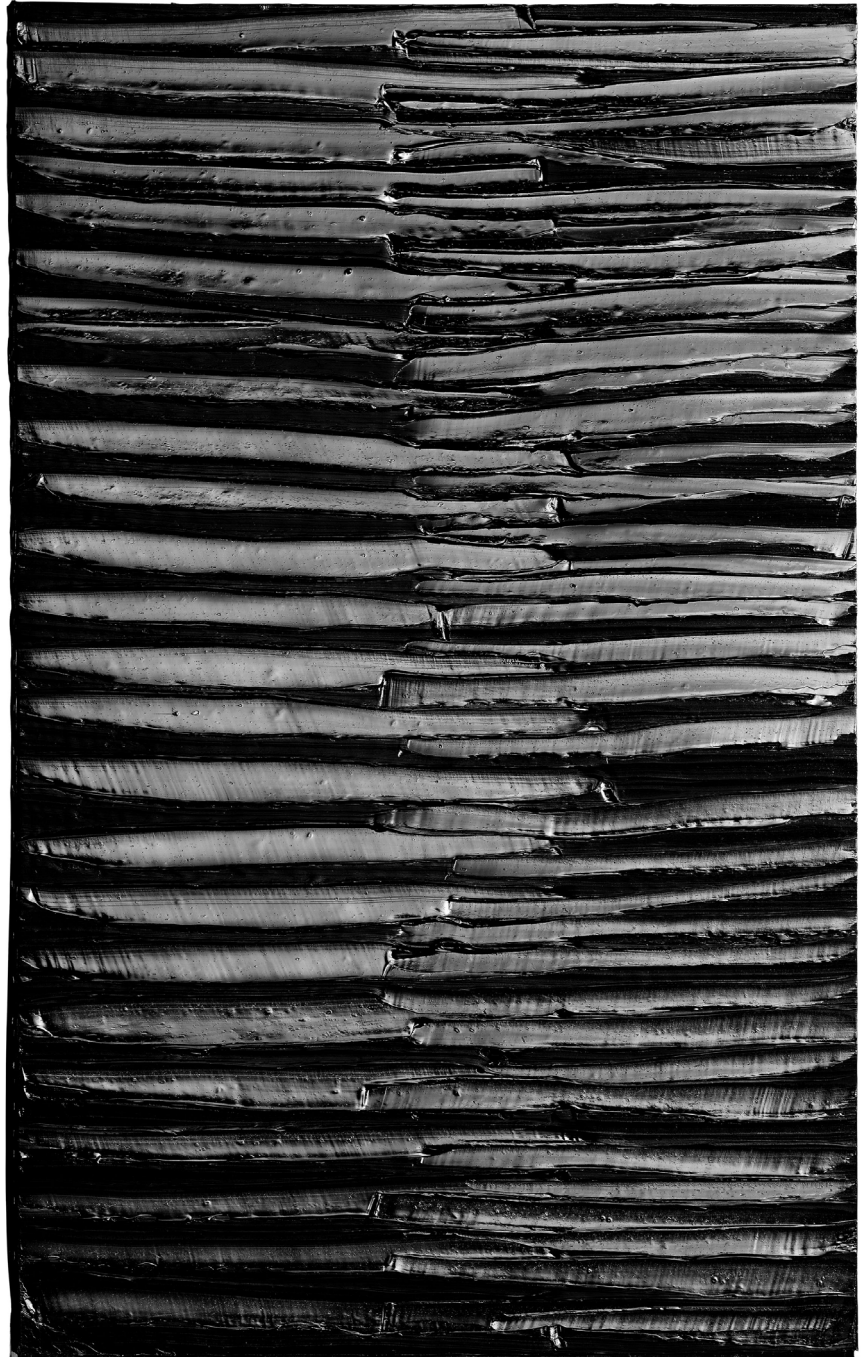
Pierre Soulages "Peinture, 222 x 137 cm, 22 septembre 2013" Acrylic on canvas. 222 x 137 cm / 87 3/8 x 53 15/16 in

On the occasion of the opening, Perrotin Tokyo is honored to present a solo exhibition of the 97 year-old master Pierre Soulages, bringing together a collection of recent paintings. Three years ago, Perrotin New York held a comprehensive presentation of Pierre Soulages new works, spanning a celebrated career within the first American exhibition in ten years.