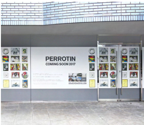
Tokyo Piramide Building, 6-6-9 Roppongi, Minato-Ku