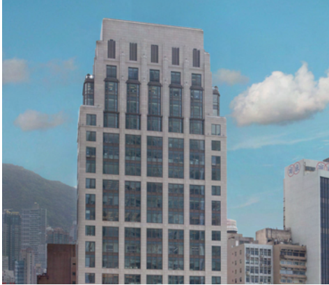
Hong Kong 50 Connaught Road Central