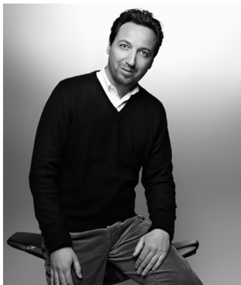
Emmanuel Perrotin