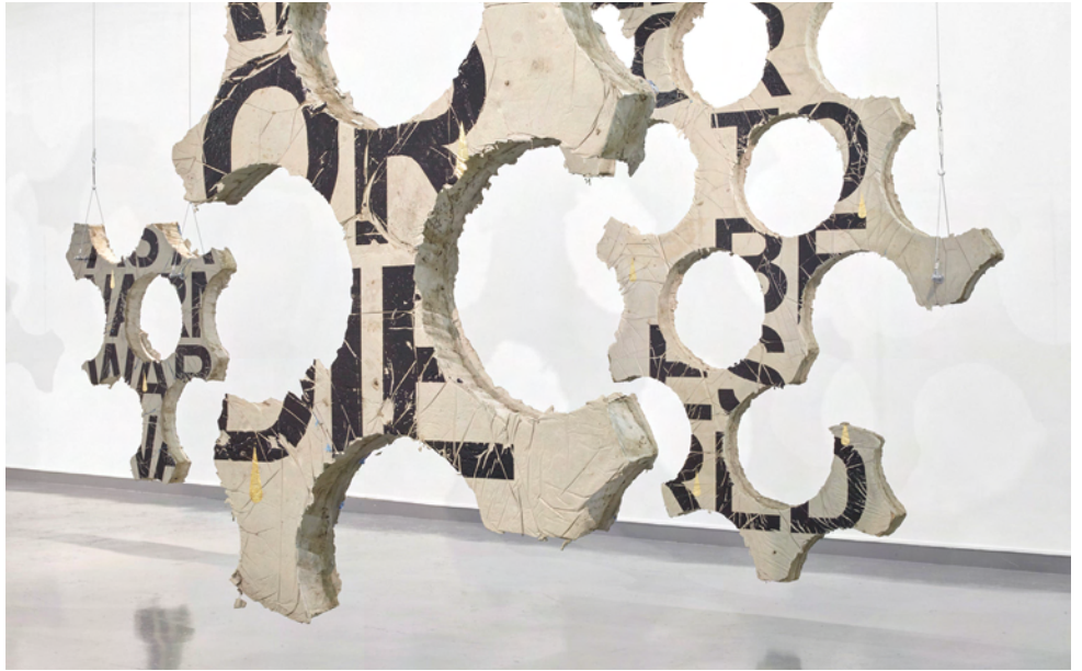
View of the solo show "Sírnete de mi, sírveme de ti" at Proyecto Amil Lima (Peru), 2016