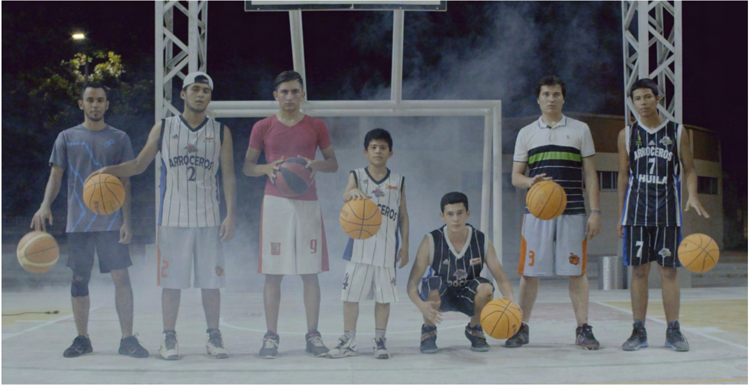
Iván Argote “As Far As We Could Get” (still), 2017. Video HD

When I was a kid, someone told me that a man dug a hole so deep that he stepped out of it on the other side of the world. Standing on firm ground, I wondered why this man, in fact, did not fall out of the earth and exit it upside down. In Iván Argote's new film “As Far As We Could Get” which contains documentary and fictional elements, he digs an imaginary channel from Indonesia to Colombia, or from the municipality of Palembang to a town called Neiva. The two cities are exact antipodes (a rare coincidence that only six more cities share worldwide). In both locations, the artist rented large billboards to announce simultaneously a feature film named, “La Venganza Del Amor” (The Revenge of Love). As if in a novel by Jorge Luis Borges, the title of his gallery show in New York is announced through a pyramid of interrelated information—stemming from a billboard announcing a fictional film documented by the artist's camera, we read the title of the art exhibition that we are currently visiting.