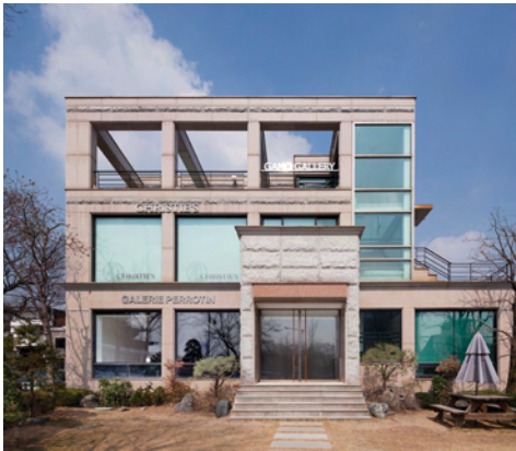
Seoul 5 Palpan-Gil, Jongno-Gu