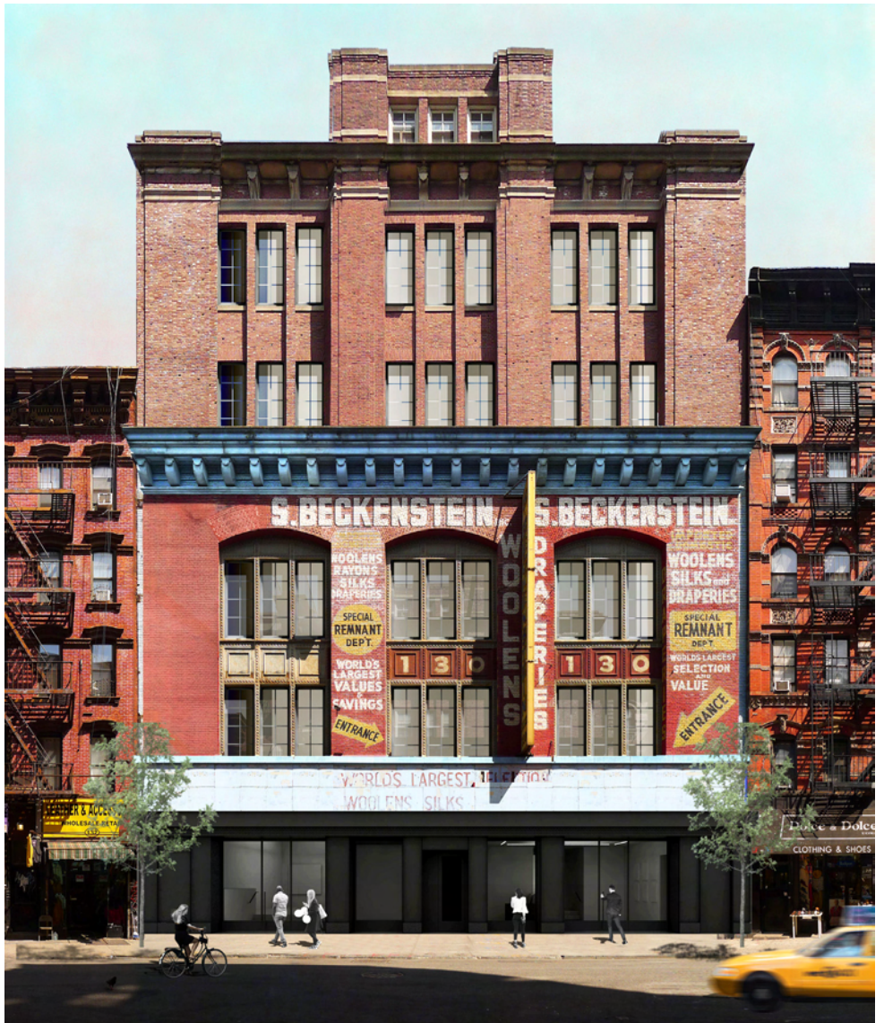
Facade of Perrotin gallery, 130 Orchard Street, New York

Along with the Paris, Hong Kong, Seoul and forthcoming Tokyo-based galleries, this new location will offer greater flexibility and will enable Perrotin to continue staging ambitious projects and large-scale exhibitions for its world-renowned artists. The new space will offer great flexibility to the gallery's varied group of artists for their exhibitions. The move affirms the gallery's loyal to its programming and passion towards discovering new talent since its establishment in Paris in 1989. The new location will serve as the base for a growing New York team.