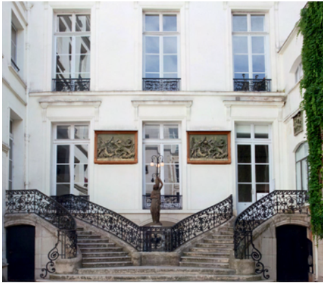
Paris 76 rue de Turenne, Marais