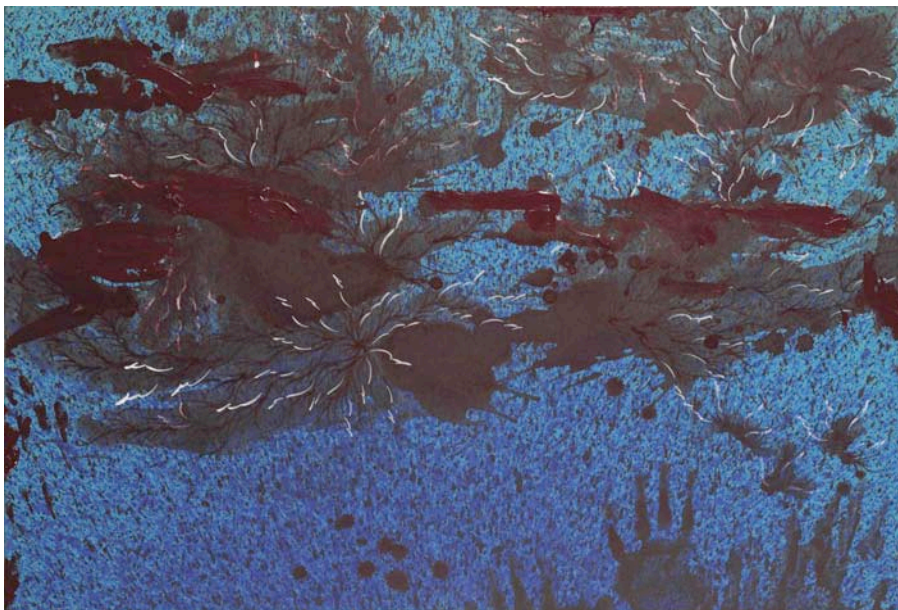
Imran Qureshi, Untitled , 2017, Acrylic and emulsion paint on canvas, 61 x 91,4 cm

Courtesy Galerie Thaddaeus Ropac London·Paris·Salzburg © Imran Qureshi. Photo: Usman Javaid