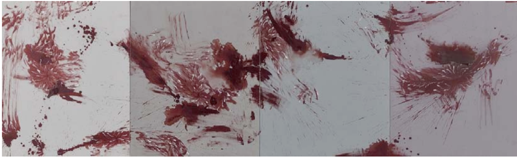
Imran Qureshi, Untitled , 2017, Acrylic and emulsion paint on canvas, 4-parts Overall 92,7 x 304,8 cm, each panel 92,7 x 76,2 cm Courtesy Galerie Thaddaeus Ropac London·Paris·Salzburg © Imran Qureshi. Photo: Usman Javaid