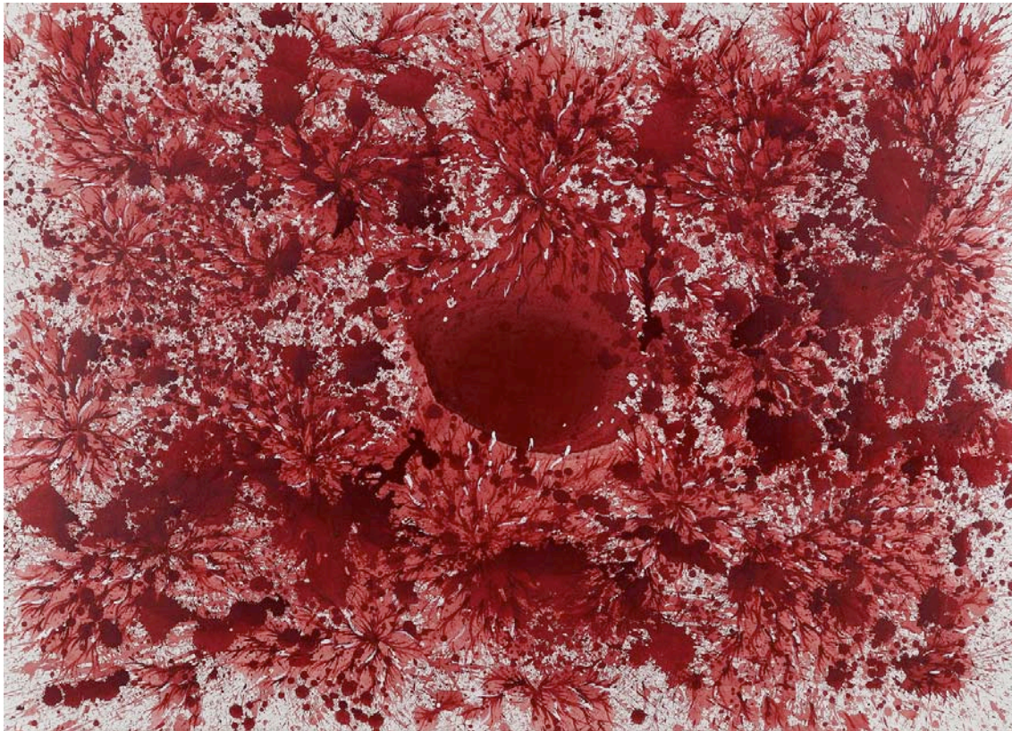
Imran Qureshi , Blessings upon the land of my love , 2016, Acrylic on canvas, 182,9 x 259,1 cm Courtesy Galerie Thaddaeus Ropac London·Paris·Salzburg © Imran Qureshi. Photo: Usman Javaid