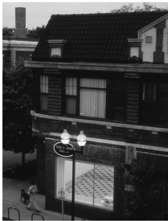
Left: © Julia Fish, First plan for floor [flore] - section two , 1998, detail. Gouache on laser-printed paper, 11 3/4 x 23 1/4 in. Right: Installation view, floor [flore] , at Ten in One Gallery, Chicago, 1998.