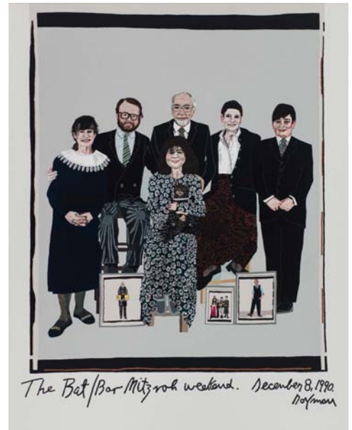
The Bat/Bar Mitzvah Weekend , 2016, oil and acrylic on canvas, 88 x 69 inches.