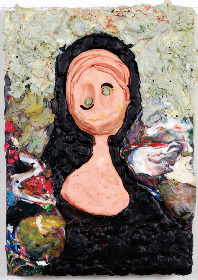
"Untitled", 2007. Plasticine on wood. 41 x 28 x 4.5 cm / 16 1/8 x 11 1/16 x 1 3/4 inches.