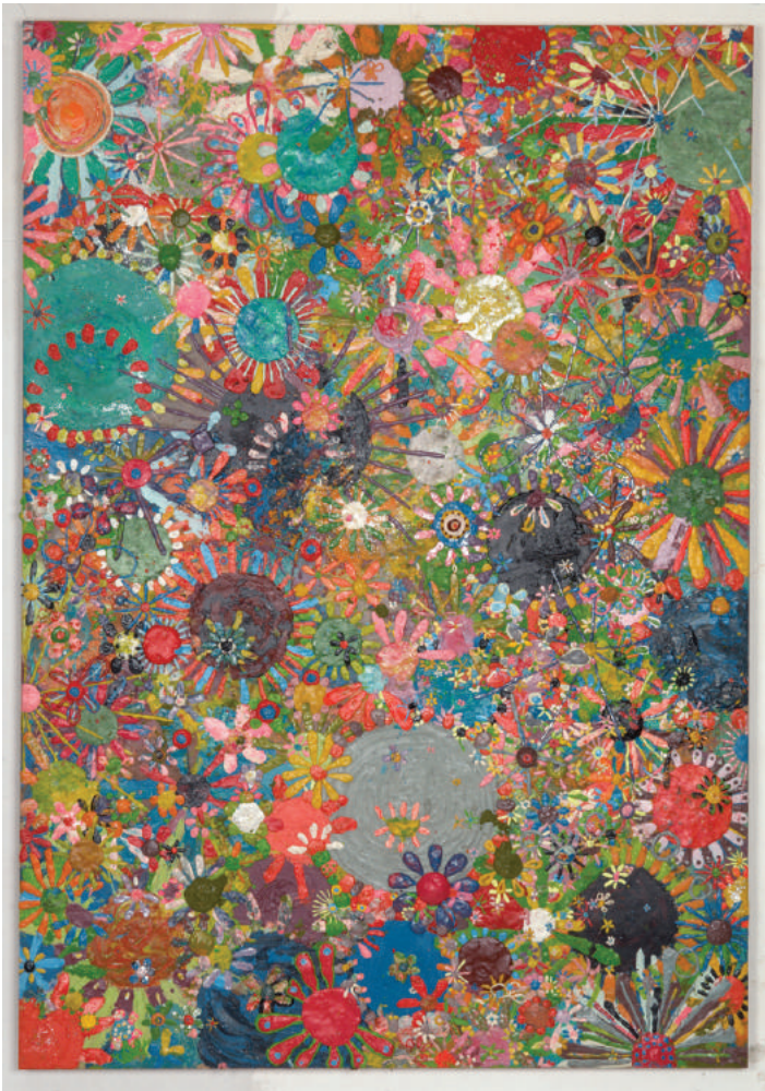
"Untitled", 2010. Plasticine on wood. 207 x 144 x 10 cm / 81 1 / 2 x 56 11 / 16 x 3 15 / 16 inches.