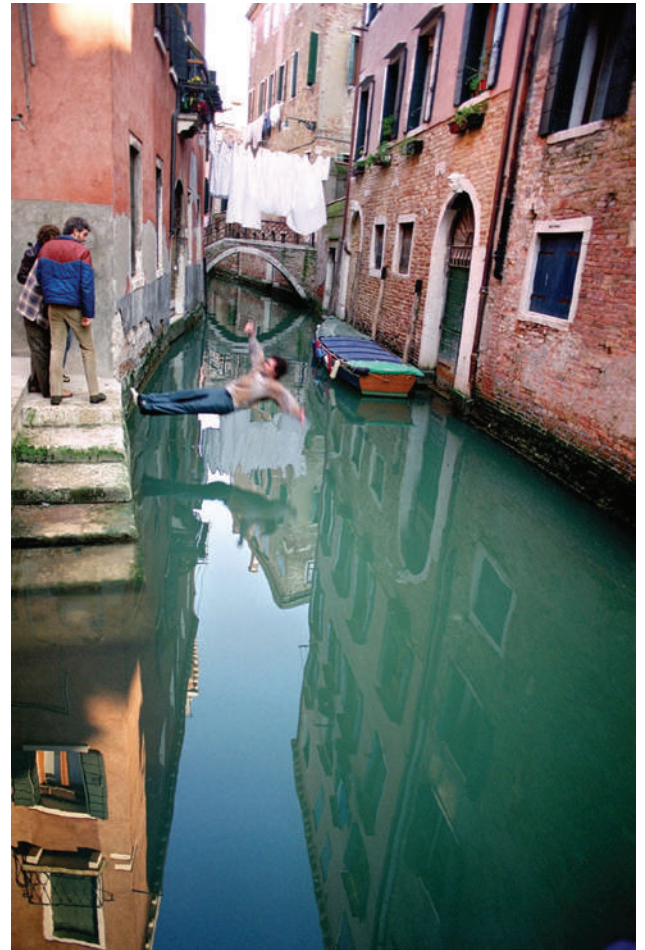
"Nellanutella", 2001. Lambda c-print. 50 x 75 cm / 19 11/16 x 29 1/2 inches.