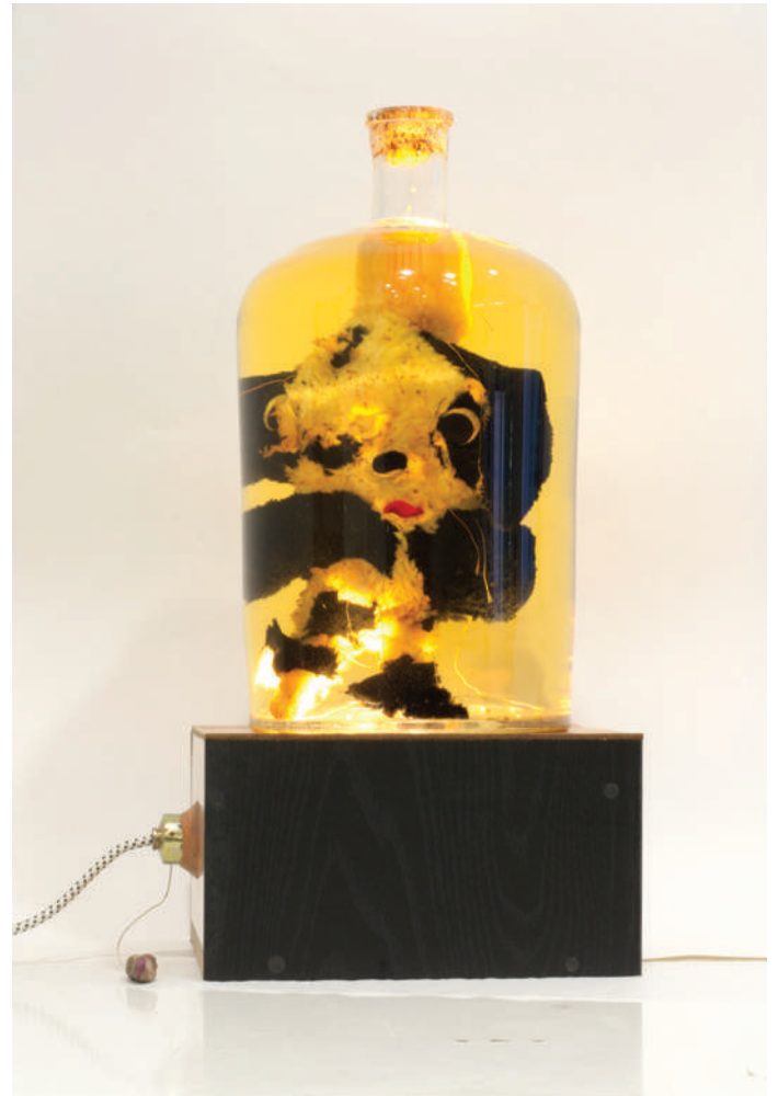
"Untitled", 2006. Glass jar, soft toy, oil, light box. 63 x 33 x 27.5 cm / 24 3 / 16 x 13 x 10 3 / 16 inches.