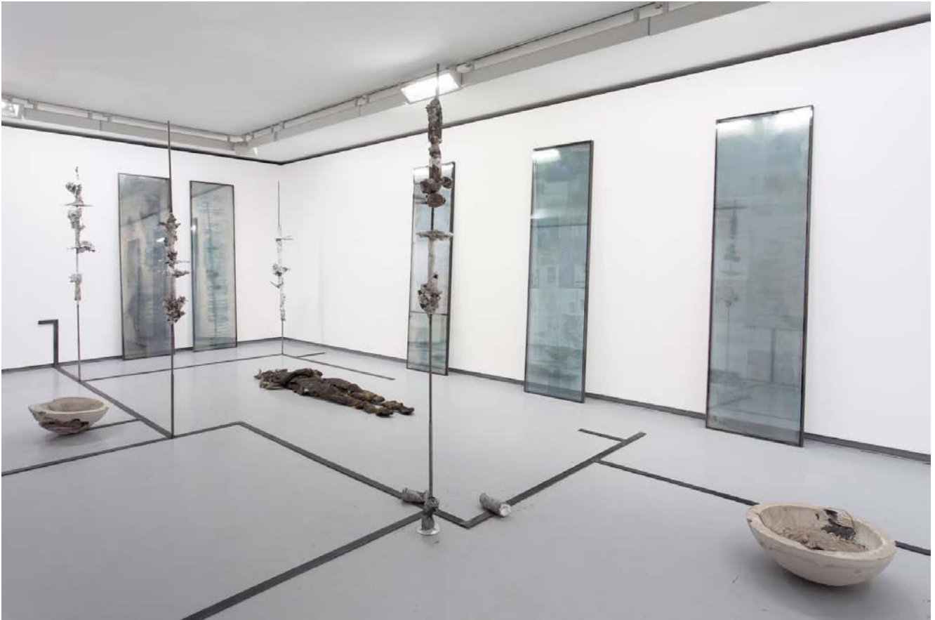
Exhibition view " black dance " Valentin gallery, Paris, France, 2016.