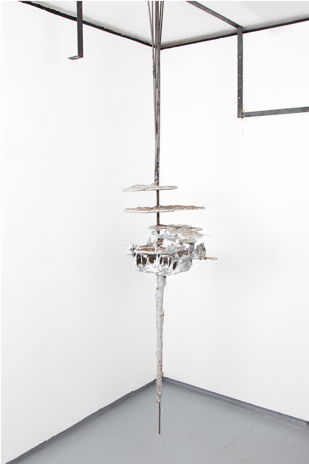
Antoine Renard "Untitled (Vulcan Raven)", 2016 Aluminium, steel. / Aluminium, acier. 88 3/16 x 43 5/16 x 31 1/2 Inches. / 224 x 110 x 80 cm.