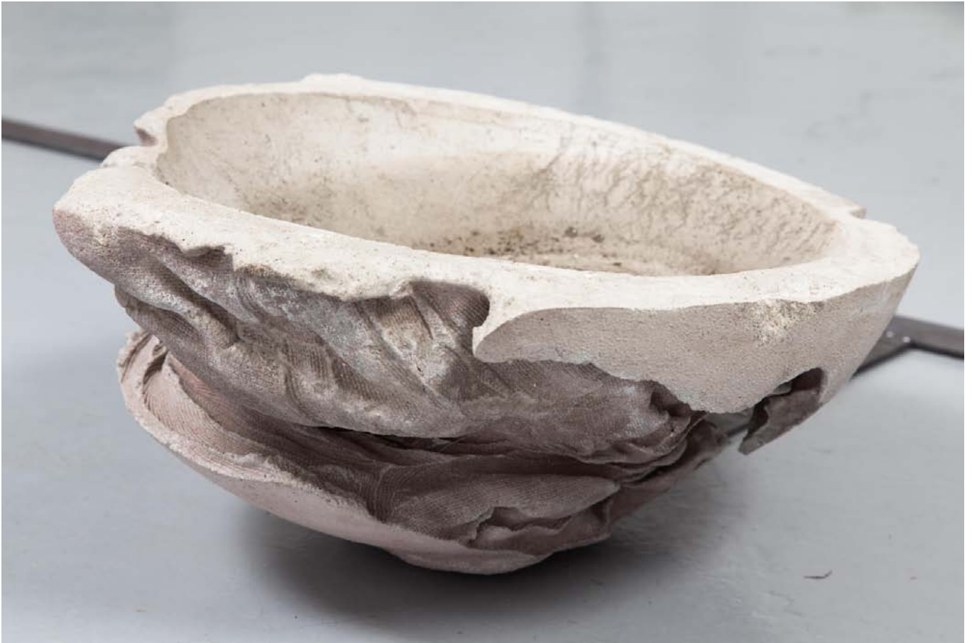
Antoine Renard "Stoup VII", 2016 Concrete, deionized water. / Béton, eau déminéralisée. 8 5/19 x 17 5/17 x 17 5/17 Inches. / 21 x 44 x 44 cm.