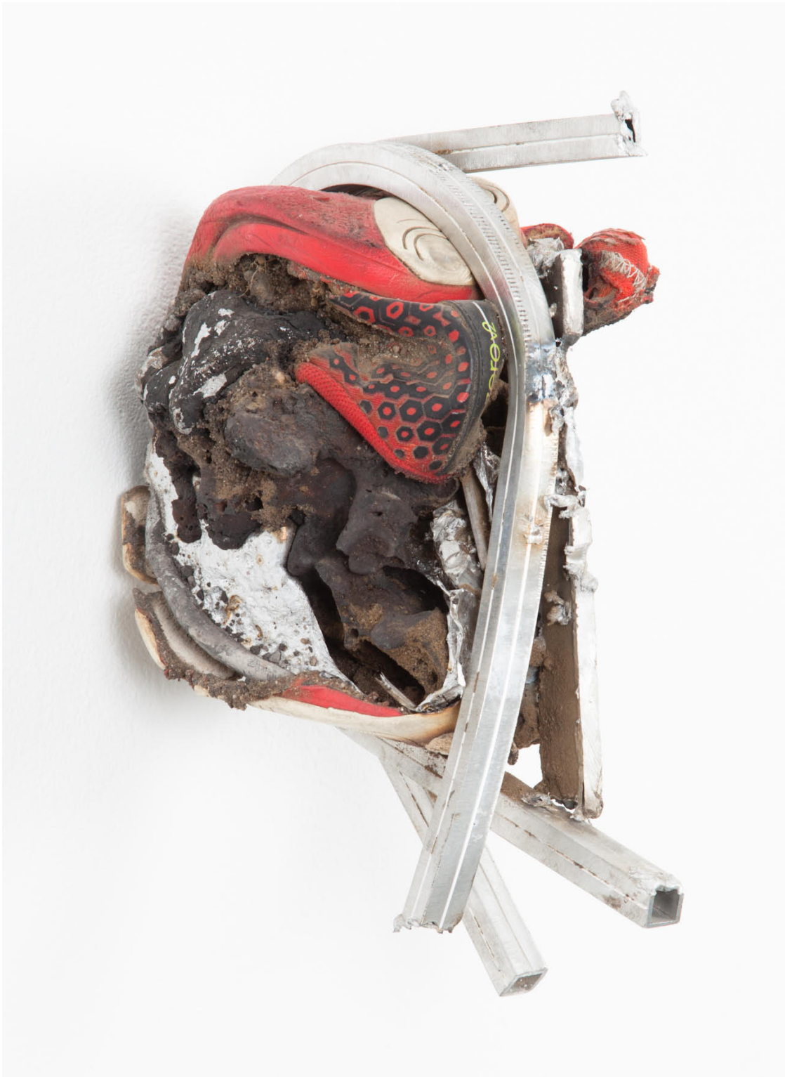
Antoine Renard "New Balance", 2016 Volcanic rock, shoe, aluminium. / Roche volcanique, chaussure, aluminium. 11 x 4 3/4 x 7 7/8 Inches. / 28 x 12 x 20 cm.