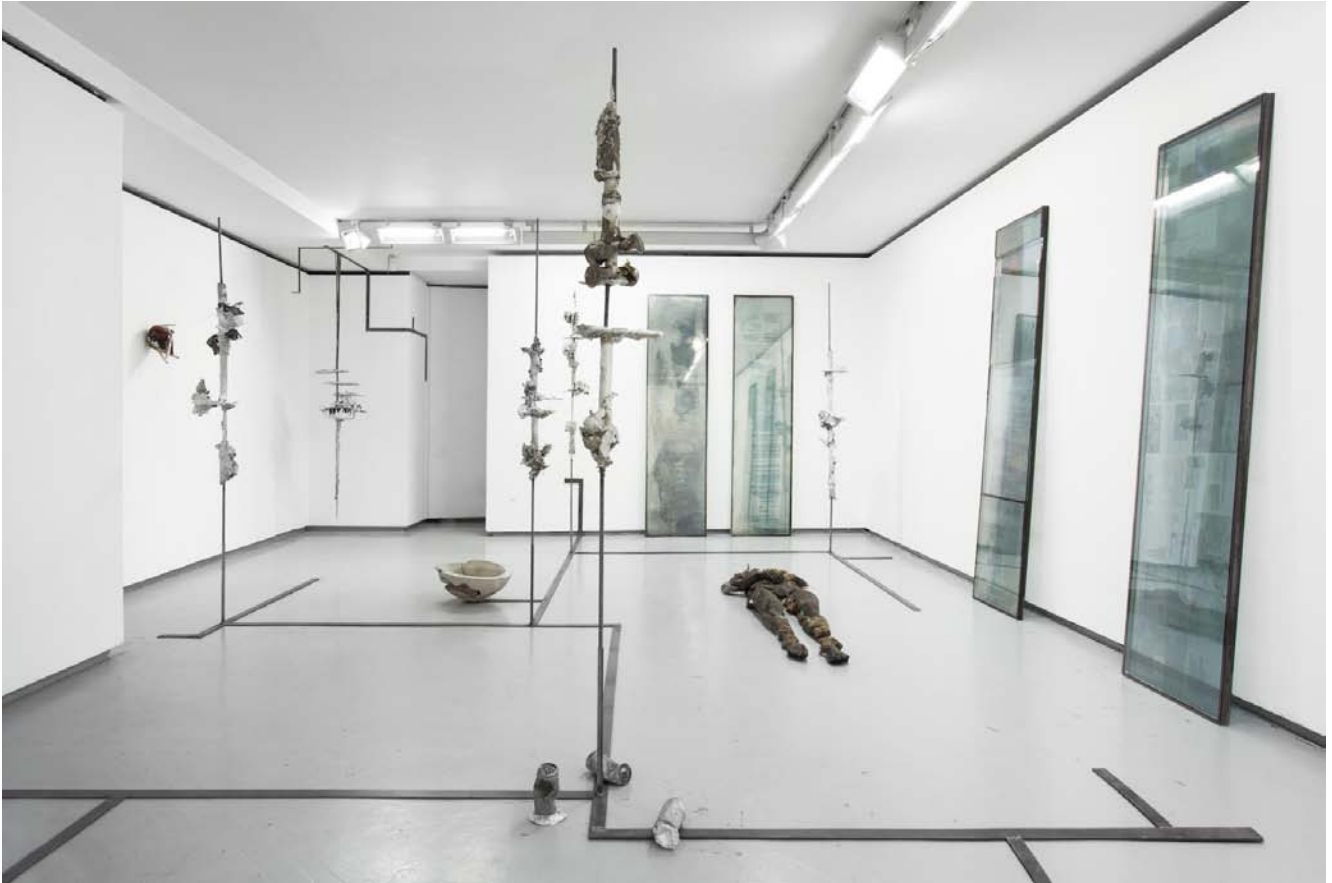
Exhibition view " black dance " Valentin gallery, Paris, France, 2016.