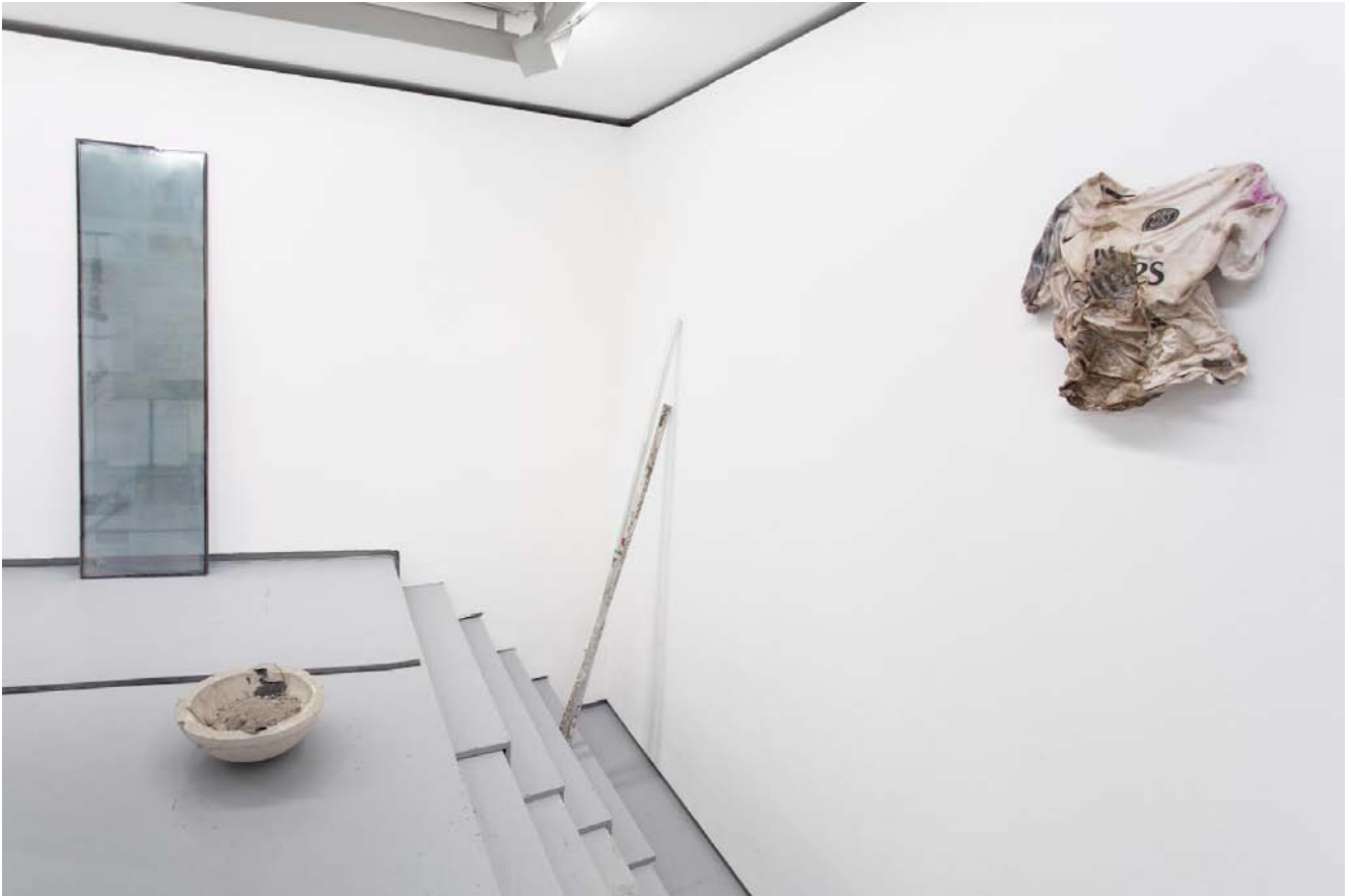
Exhibition view "black dance" Valentin gallery, Paris, France, 2016.