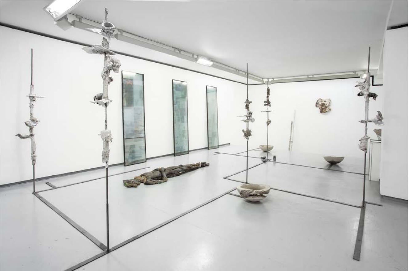
Exhibition view " black dance " Valentin gallery, Paris, France, 2016.