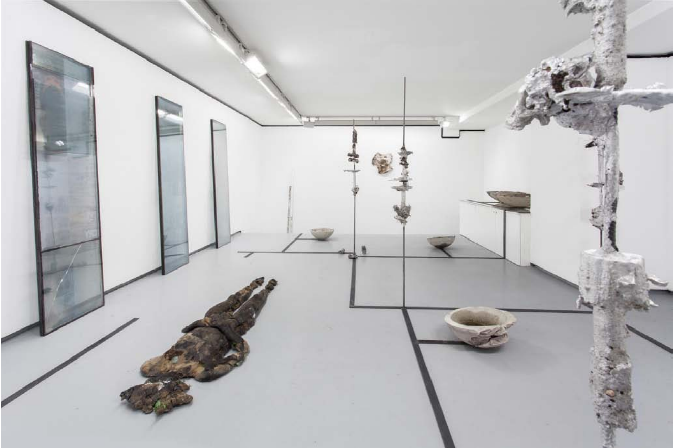
Exhibition view "black dance" Valentin gallery, Paris, France, 2016.