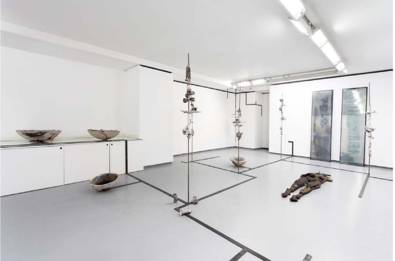
Exhibition view "black dance" Valentin gallery, Paris, France, 2016.