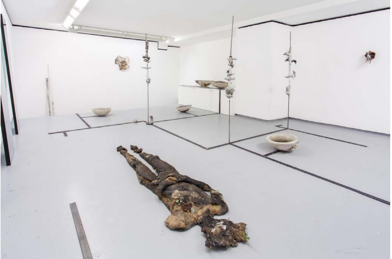
Exhibition view "black dance" Valentin gallery, Paris, France, 2016.