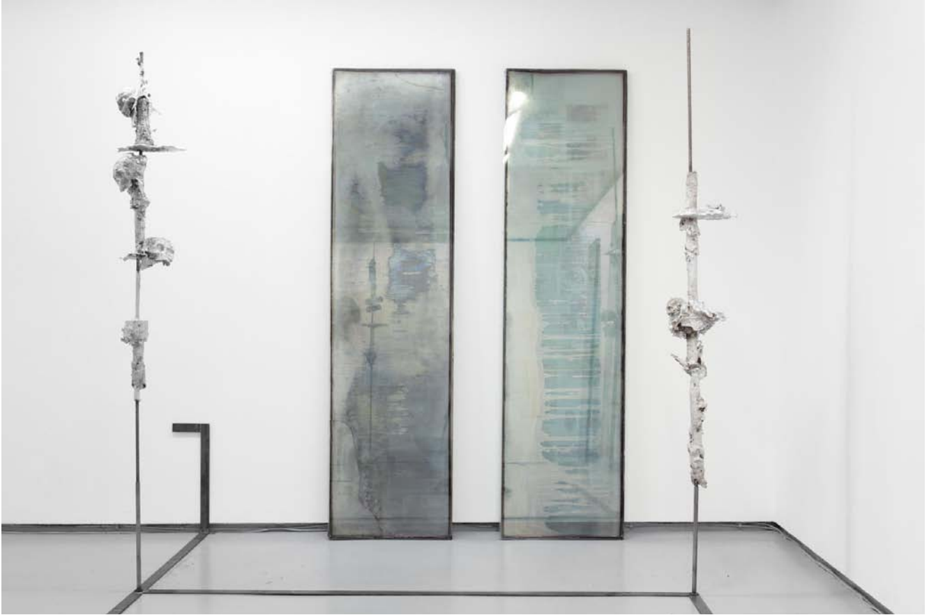
Exhibition view "black dance" Valentin gallery, Paris, France, 2016.