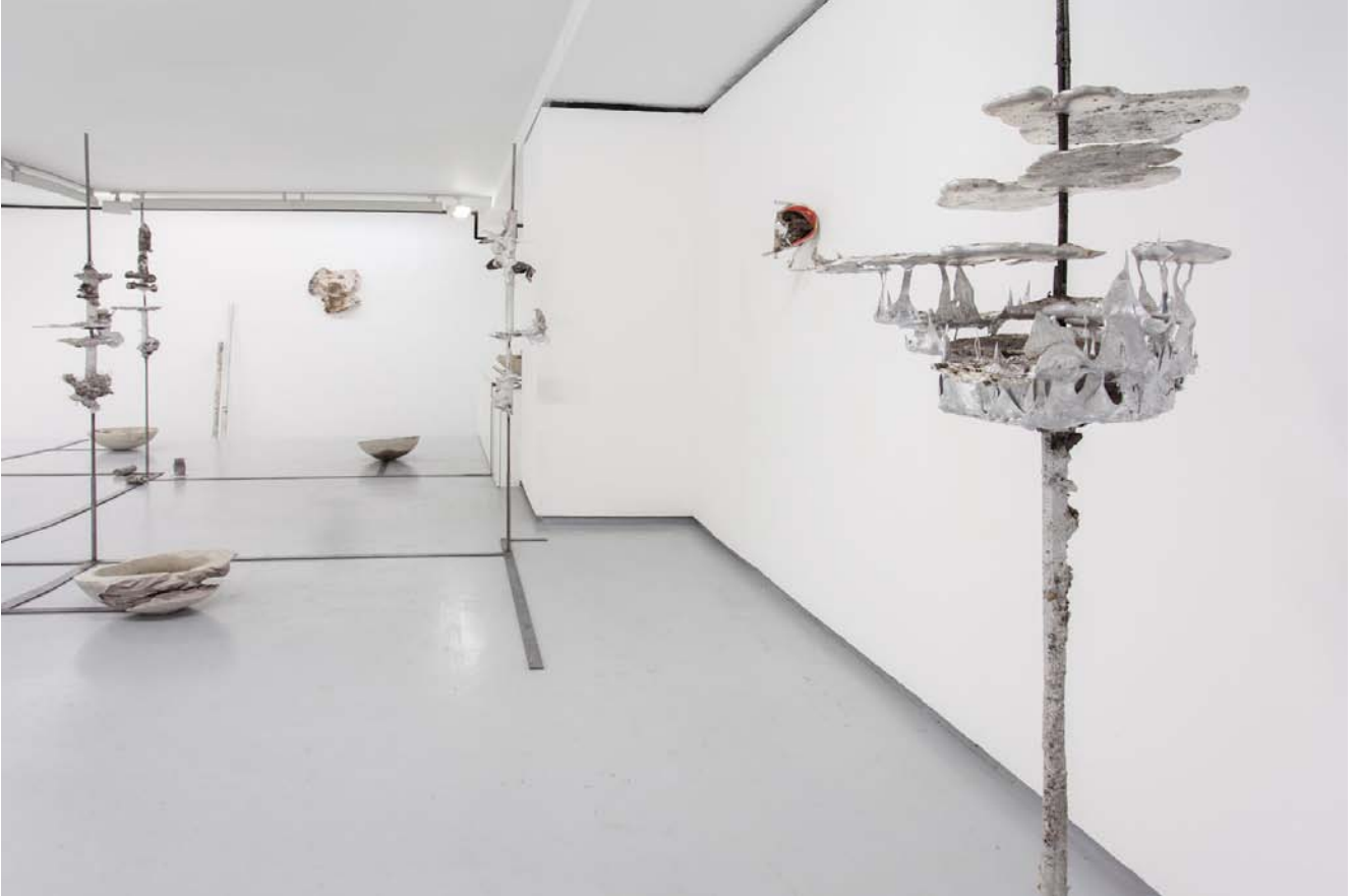
Exhibition view "black dance" Valentin gallery, Paris, France, 2016.