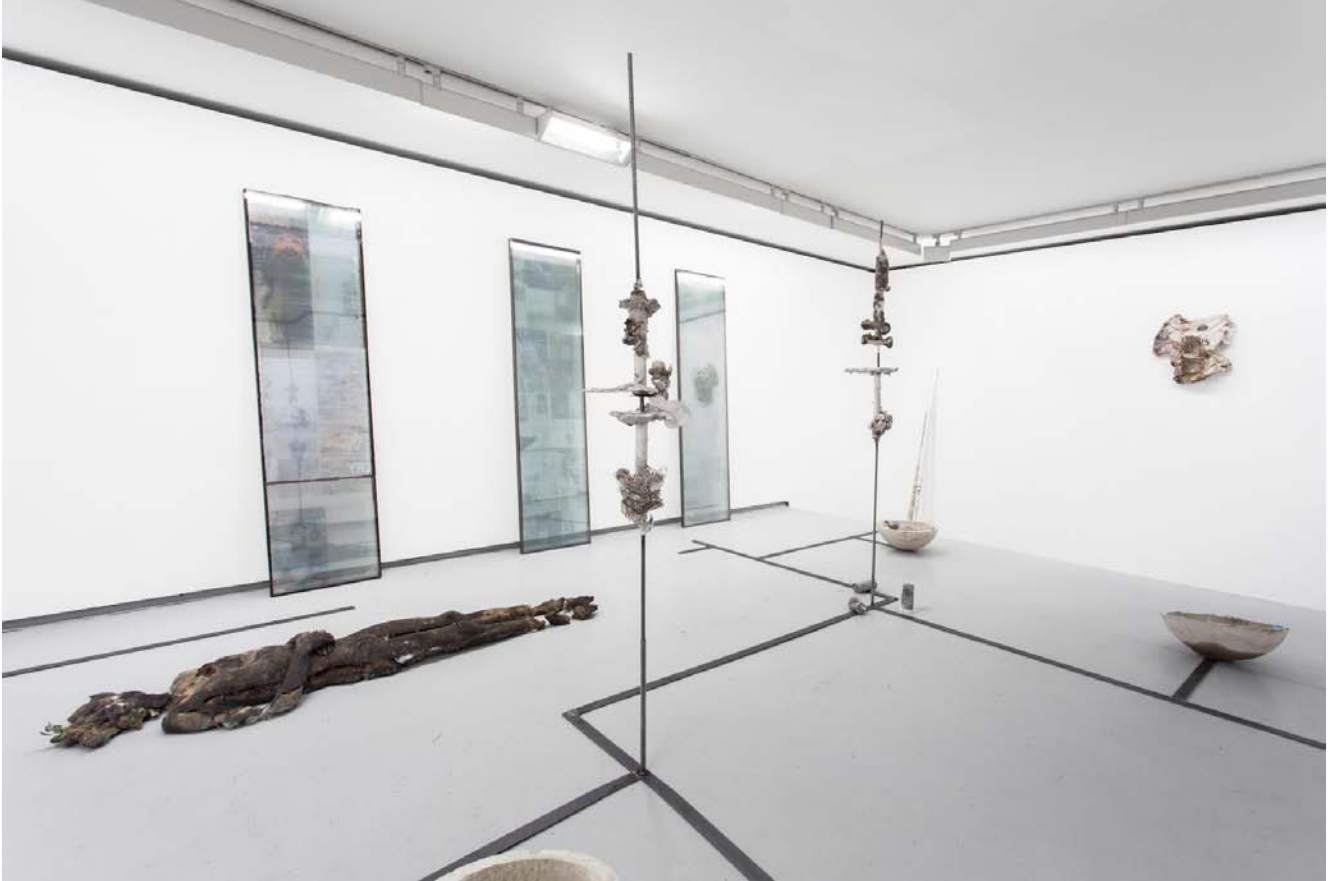
Exhibition view " black dance " Valentin gallery, Paris, France, 2016.