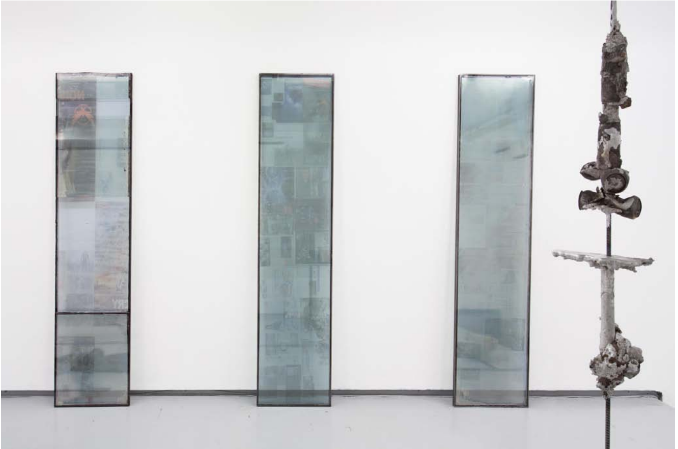
Exhibition view "black dance" Valentin gallery, Paris, France, 2016.