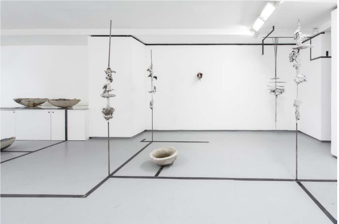
Exhibition view " black dance " Valentin gallery, Paris, France, 2016.