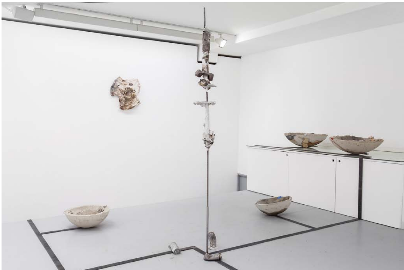
Exhibition view "black dance" Valentin gallery, Paris, France, 2016.