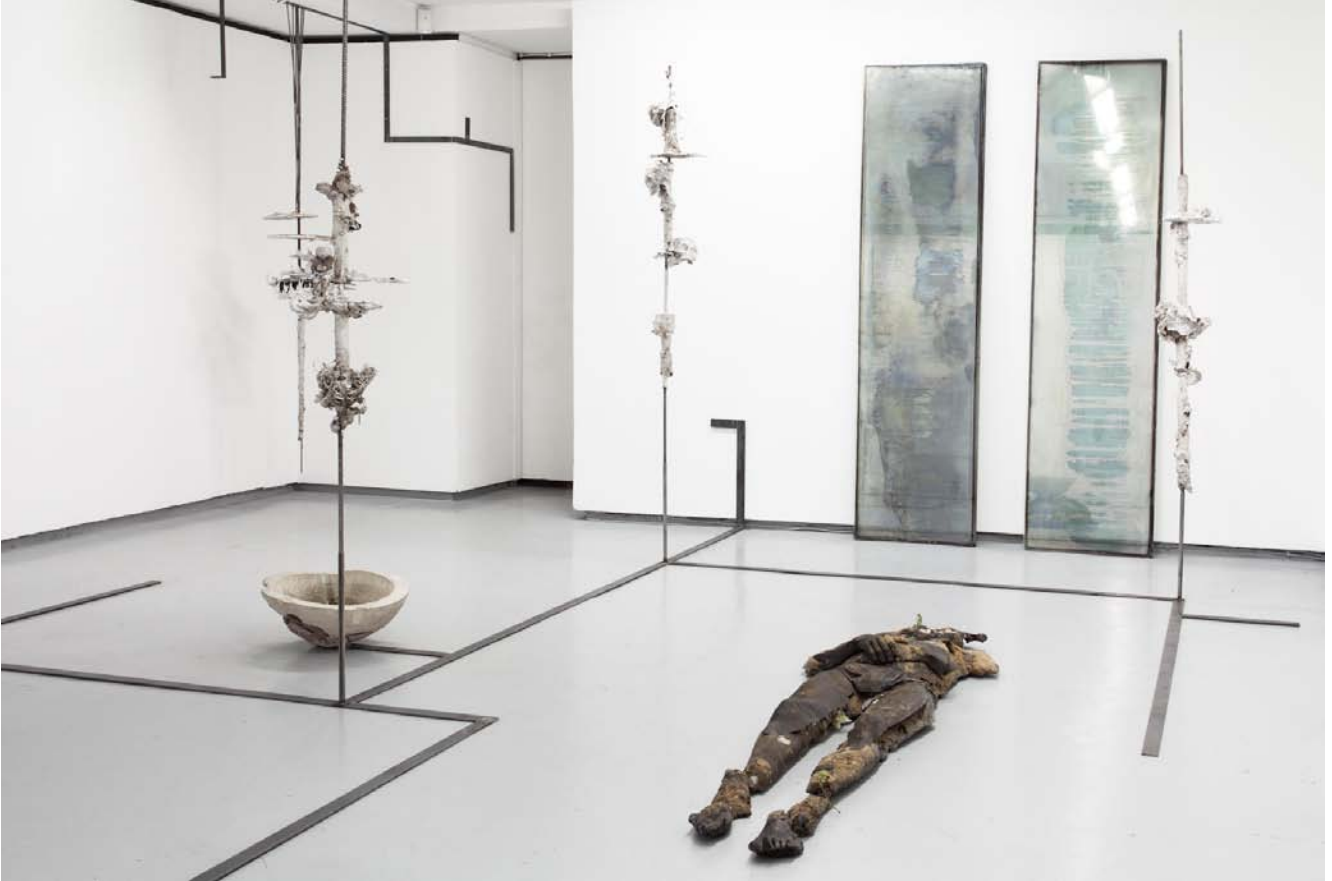
Exhibition view "black dance" Valentin gallery, Paris, France, 2016.