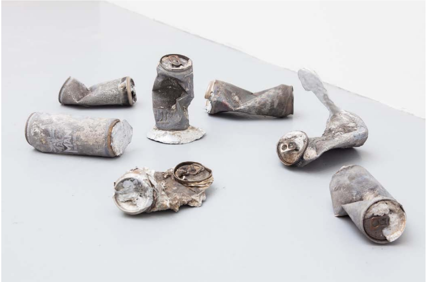
Antoine Renard "Untitled (Magic Man)", 2016 7 aluminium cast. / 7 fontes d'aluminium. Variable dimensions. / Dimensions variables.