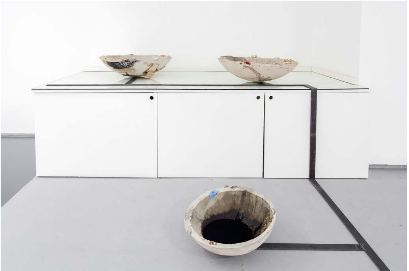
Exhibition view "black dance" Valentin gallery, Paris, France, 2016.