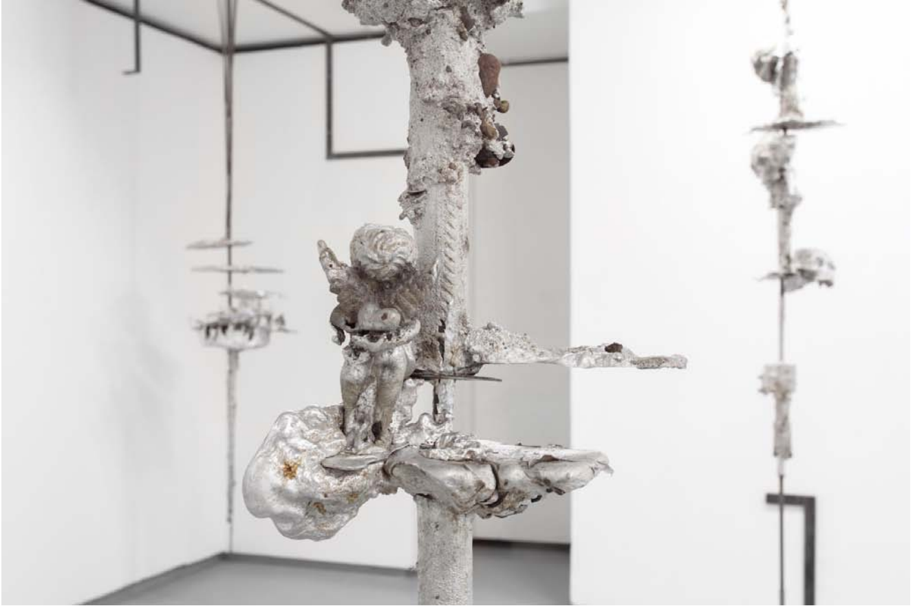
Exhibition view " black dance " Valentin gallery, Paris, France, 2016.