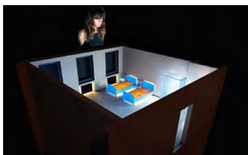
Martin Honert, Schlafsaal, Modell 1:5 , 2013 Wood, electrical devices, Styrodur, paper, ink on plastic foil, acrylic glass, Duratrans, light installation 154 x 152 x 116 cm

Based on an original photographic negative, Schlafsaal, Modell 1:5 refers to a dormitory from Honert's boarding school days. The model emulates the effect of a photographic negative by reversing light and shade: a bright glow emanates from below the dormitory beds with their blue frames and light orange mattresses. Honert addresses photography as a medium, making visible in three-dimensional form effects closely associated with photographic images.