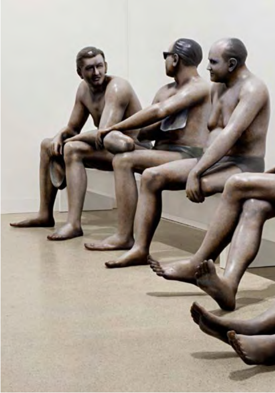
Martin Honert, VSG-Gruppe , 2015-16 (Detail) Polyurethane, sand, wood, oil paint 220 x 560 x 200 cm approx. overall

Johnen Galerie is pleased to present Martin Honert's fifth solo exhibition with the gallery. The exhibition will be on view from April 26 and continue through May 28, 2016. A special opening reception concurrently with 2016 Gallery Weekend Berlin will take place on Friday April 29 from 6–9 PM.