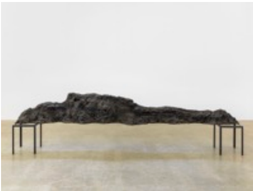
Massimo Bartolini Gacometti Landscape, 2016 Bronzo / Bronze 60 x 400 x 40 cm / 23 5/8 x 157 1/2 x 15 2/3 inches