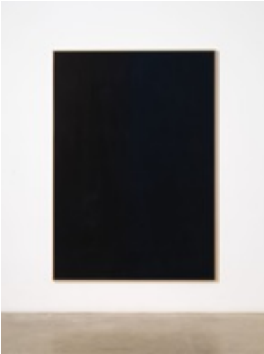
Massimo Bartolini Dew, 2015 Alluminio, vernice metallizzata, rugiada / Aluminium, metallic paint, dew 212 x 150 x 9.5 cm / 83 1/2 x 59 x 3 1/2 inches