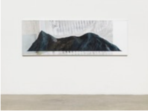
Massimo Bartolini Rocky, 2015 Acrilico su tela / Acrylic on canvas 92 x 278 cm / 36 1/2 x 109 1/2 inches