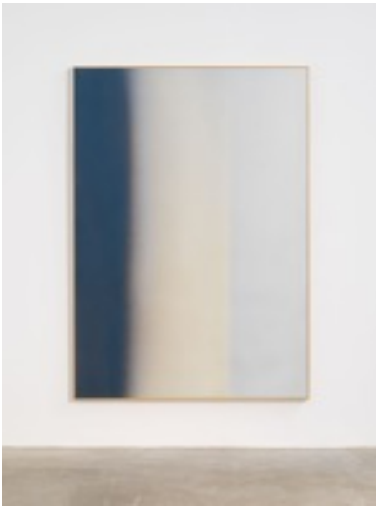
Massimo Bartolini Dew, 2015 Alluminio, vernice metallizzata, rugiada / Aluminium, metallic paint, dew 212 x 150 x 9.5 cm / 83 1/2 x 59 x 3 1/2 inches