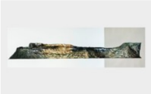
Massimo Bartolini Giacometti, 2014 Acrilico su tela / Acrylic on canvas 92 x 302.5 cm / 36 1/2 x 119 inches