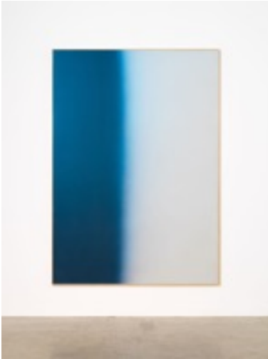
Massimo Bartolini Dew, 2015 Alluminio, vernice metallizzata, rugiada / Aluminium, metallic paint, dew 212 x 150 x 9.5 cm / 83 1/2 x 59 x 3 1/2 inches