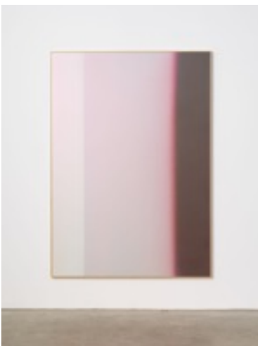
Massimo Bartolini Dew, 2015 Alluminio, vernice metallizzata, rugiada / Aluminium, metallic paint, dew 212 x 150 x 9.5 cm / 83 1/2 x 59 x 3 1/2 inches