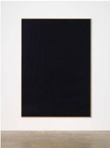
Massimo Bartolini Dew, 2015 Alluminio, vernice metallizzata, rugiada / Aluminium, metallic paint, dew 212 x 150 x 9.5 cm / 83 1/2 x 59 x 3 1/2 inches