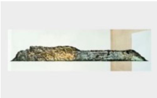
Massimo Bartolini Giacometti, 2014 Acrilico su tela / Acrylic on canvas 92 x 305 cm / 36 1/2 x 120 1/4 inches