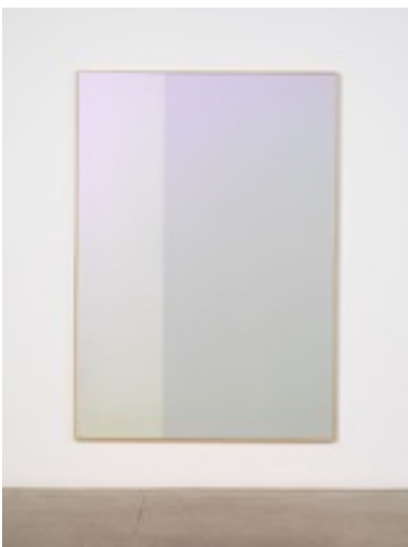
Massimo Bartolini Dew, 2015 Alluminio, vernice metallizzata, rugiada / Aluminium, metallic paint, dew 212 x 150 x 9.5 cm / 83 1/2 x 59 x 3 1/2 inches