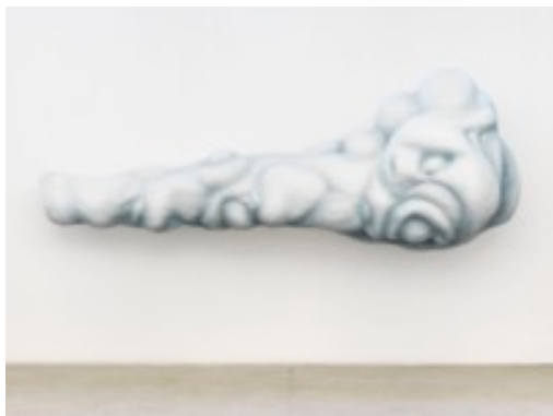
Massimo Bartolini Clouds club, 2015, Ex. 1/3 Cartapesta / Papier-mâché

160 x 430 x 110 cm / 45 1/3 x 169 1/3 x 35 1/2 inches