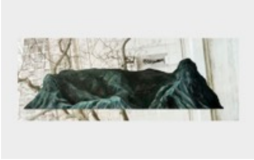
Massimo Bartolini The shade, 2015 Acrilico su tela / Acrylic on canvas 92 x 242 cm / 36 1/2 x 95 1/3 inches