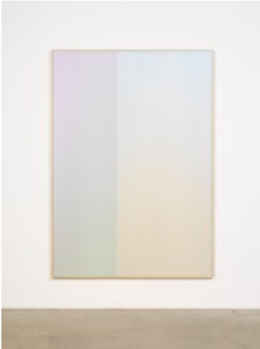
Massimo Bartolini Dew, 2015 Alluminio, vernice metallizzata, rugiada / Aluminium, metallic paint, dew 212 x 150 x 9.5 cm / 83 1/2 x 59 x 3 1/2 inches