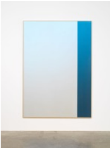
Massimo Bartolini Dew, 2015 Alluminio, vernice metallizzata, rugiada / Aluminium, metallic paint, dew 212 x 150 x 9.5 cm / 83 1/2 x 59 x 3 1/2 inches