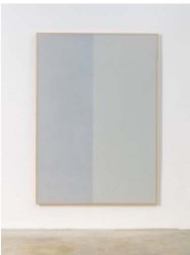
Massimo Bartolini Dew, 2015 Alluminio, vernice metallizzata, rugiada / Aluminium, metallic paint, dew 212 x 150 x 9.5 cm / 83 1/2 x 59 x 3 1/2 inches