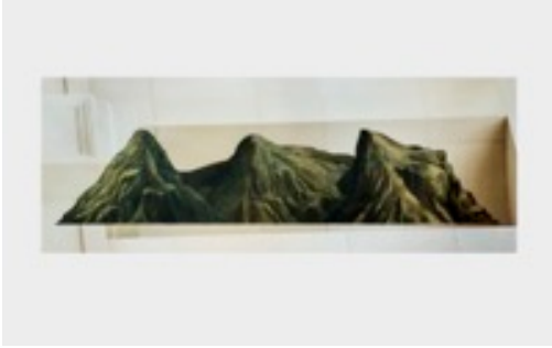
Massimo Bartolini Eva, 2015 Acrilico su tela / Acrylic on canvas 92 x 242 cm / 83 1/2 x 95 1/3 inches