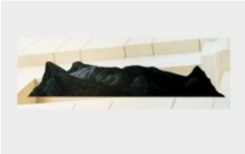
Massimo Bartolini The Age of Bronze, 2015 Acrilico su tela / Acrylic on canvas 90 x 270 cm / 36 1/2 x 106 1/2 inches