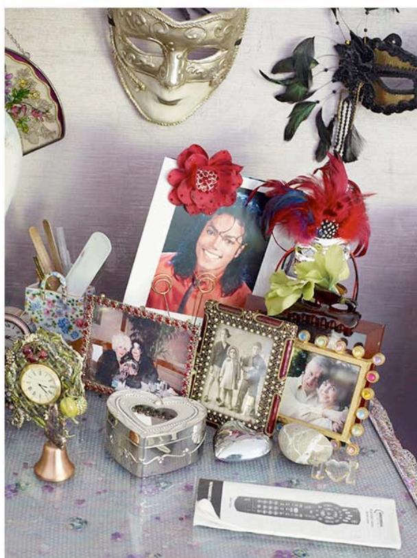
Bedside Table from the 700 Nimes Road Portfolio , 2010-11, pigment print, 24 x 20 in, 60.9 x 50.8 cm.

Portraits and Landscapes 536 West 22nd Street, New York