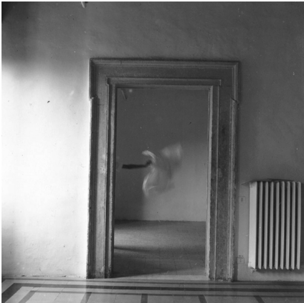
Images: (Overleaf) Alison Watt, Angel , 2010 [collection of the Uffizi Gallery] Francesca Woodman, Angel Series , Rome, 1977