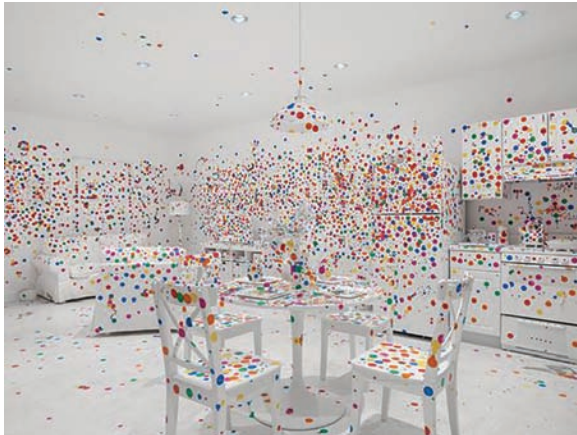
The obliteration room , 2002–present Collaboration between Yayoi Kusama and Queensland Art Gallery, Australia Commissioned by Queensland Art Gallery Gift of the artist through the Queensland Art Gallery Foundation 2012

Opening reception: Saturday, May 9, 6 – 8 PM