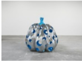
Yayoi Kusama PUMPKIN , 2015 Stainless steel and urethane paint 58 x 56 1/8 x 55 1/8 inches 147.3 x 142.6 x 140 cm KUSYA0246