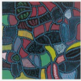
Yayoi Kusama WANTING TO DIE AT THE LAND OF GLORY , 2014 Acrylic on canvas 76 3/8 x 76 3/8 inches 194 x 194 cm Signed, titled, and dated verso KUSYA0293