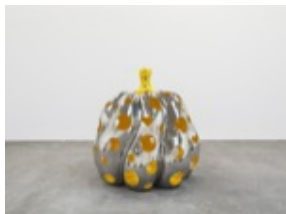
Yayoi Kusama PUMPKIN , 2015 Stainless steel and urethane paint 46 1/2 x 45 3/4 x 46 3/4 inches 118.1 x 116.2 x 118.7 cm KUSYA0242