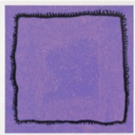
Yayoi Kusama MY LIFE , 2014 Acrylic on canvas 76 3/8 x 76 3/8 inches 194 x 194 cm Signed, titled, and dated verso KUSYA0281