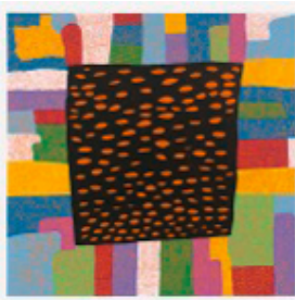
Yayoi Kusama MESSAGE FROM HADES , 2014 Acrylic on canvas 76 3/8 x 76 3/8 inches 194 x 194 cm Signed, titled, and dated verso KUSYA0276