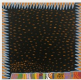
Yayoi Kusama I WHO HAVE TAKEN AN ANTIDEPRESSANT , 2014 Acrylic on canvas 76 3/8 x 76 3/8 inches 194 x 194 cm Signed, titled, and dated verso KUSYA0274