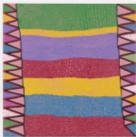
Yayoi Kusama MY LONGING, THE UNSEEN LAND OF DEATH , 2014 Acrylic on canvas 76 3/8 x 76 3/8 inches 194 x 194 cm Signed, titled, and dated verso KUSYA0275