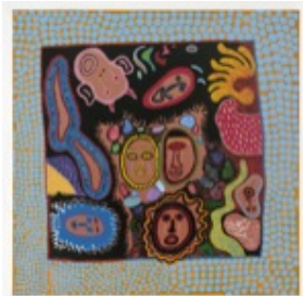
Yayoi Kusama I WHO CRY IN THE FLOWERING SEASON , 2015 Acrylic on canvas 76 3/8 x 76 3/8 inches 194 x 194 cm Signed, titled, and dated verso KUSYA0292