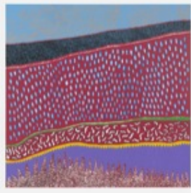
Yayoi Kusama RESTING AT THE RIVERSIDE , 2014 Acrylic on canvas 76 3/8 x 76 3/8 inches 194 x 194 cm Signed, titled, and dated verso KUSYA0280