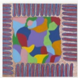
Yayoi Kusama CLOUDS ARE CONSIDERING , 2013 Acrylic on canvas 76 3/8 x 76 3/8 inches 194 x 194 cm Signed, titled, and dated verso KUSYA0272