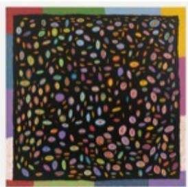
Yayoi Kusama FEAR OF YOUTH OVERWHELMED BY THE SPRING TIME OF LIFE , 2014 Acrylic on canvas 76 3/8 x 76 3/8 inches 194 x 194 cm Signed, titled, and dated verso KUSYA0278