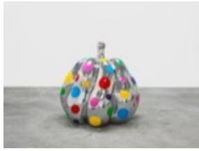
Yayoi Kusama PUMPKIN , 2015 Stainless steel and urethane paint 46 1/2 x 45 3/4 x 46 3/4 inches 118.1 x 116.2 x 118.7 cm KUSYA0243