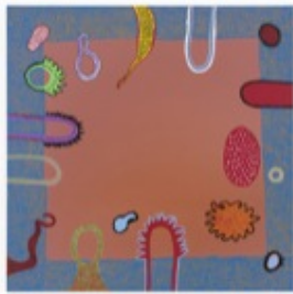
Yayoi Kusama THRONES OF GOD , 2015 Acrylic on canvas 76 3/8 x 76 3/8 inches 194 x 194 cm Signed, titled, and dated verso KUSYA0290