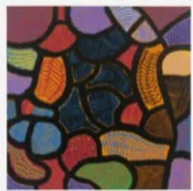
Yayoi Kusama I AM DYING NOW. THERE THE DEATH IS , 2014 Acrylic on canvas 76 3/8 x 76 3/8 inches 194 x 194 cm Signed, titled, and dated verso KUSYA0287