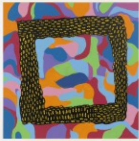
Yayoi Kusama MY HEART , 2013 Acrylic on canvas 76 3/8 x 76 3/8 inches 194 x 194 cm Signed, titled, and dated verso KUSYA0271