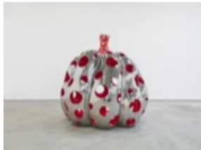
Yayoi Kusama PUMPKIN , 2015 Stainless steel and urethane paint 68 3/8 x 71 3/4 x 66 inches 173.7 x 182.2 x 167.6 cm KUSYA0244