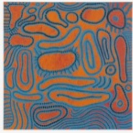
Yayoi Kusama FAR END OF DISAPPOINTMENT , 2015 Acrylic on canvas 76 3/8 x 76 3/8 inches 194 x 194 cm Signed, titled, and dated verso KUSYA0285