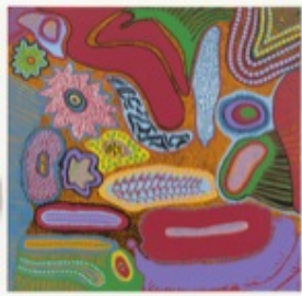
Yayoi Kusama WEDDING CEREMONY , 2014 Acrylic on canvas 76 3/8 x 76 3/8 inches 194 x 194 cm Signed, titled, and dated verso KUSYA0288