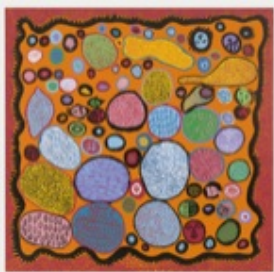
Yayoi Kusama ALL THE ETERNAL LOVE , 2014 Acrylic on canvas 76 3/8 x 76 3/8 inches 194 x 194 cm Signed, titled, and dated verso KUSYA0273