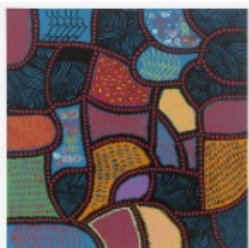
Yayoi Kusama VISIONARY DEATH , 2014 Acrylic on canvas 76 3/8 x 76 3/8 inches 194 x 194 cm Signed, titled, and dated verso KUSYA0279