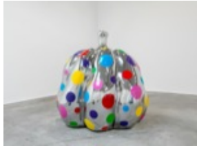
Yayoi Kusama PUMPKIN , 2015 Stainless steel and urethane paint 68 3/8 x 71 3/4 x 66 inches 173.7 x 182.2 x 167.6 cm KUSYA0245