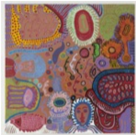
Yayoi Kusama GIVE ME LOVE , 2015 Acrylic on canvas 76 3/8 x 76 3/8 inches 194 x 194 cm Signed, titled, and dated verso KUSYA0289