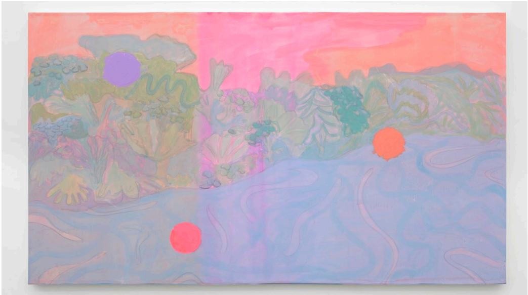
12 Pink River , 2015 acrylic and pencil on paper on canvas 91,4 x 162,6 cm