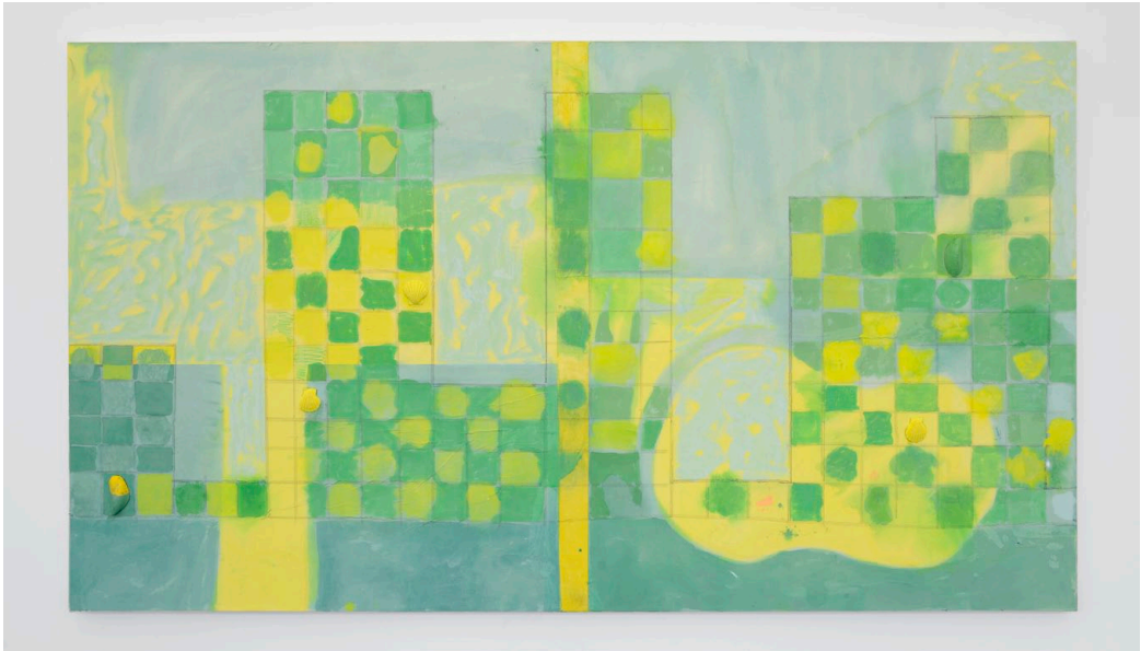
5 Green Cityscape , 2015 sea shells, acrylic and pencil on paper on canvas 91,4 x 162,6 cm