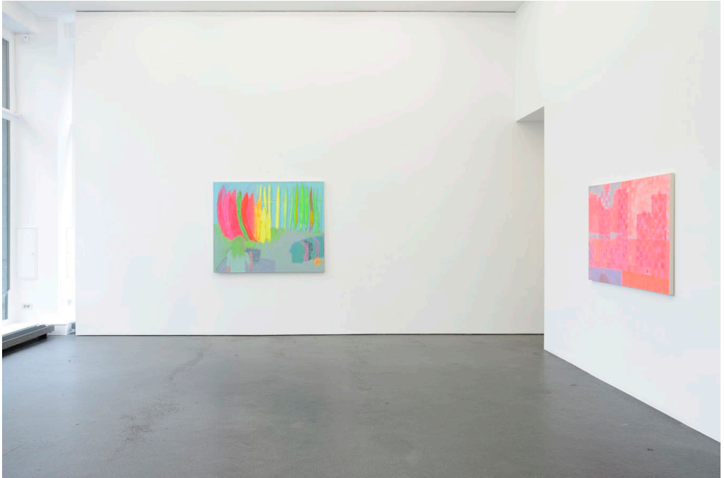
I installation view Tyson Reeder Office Baroque, Brussels, 2015