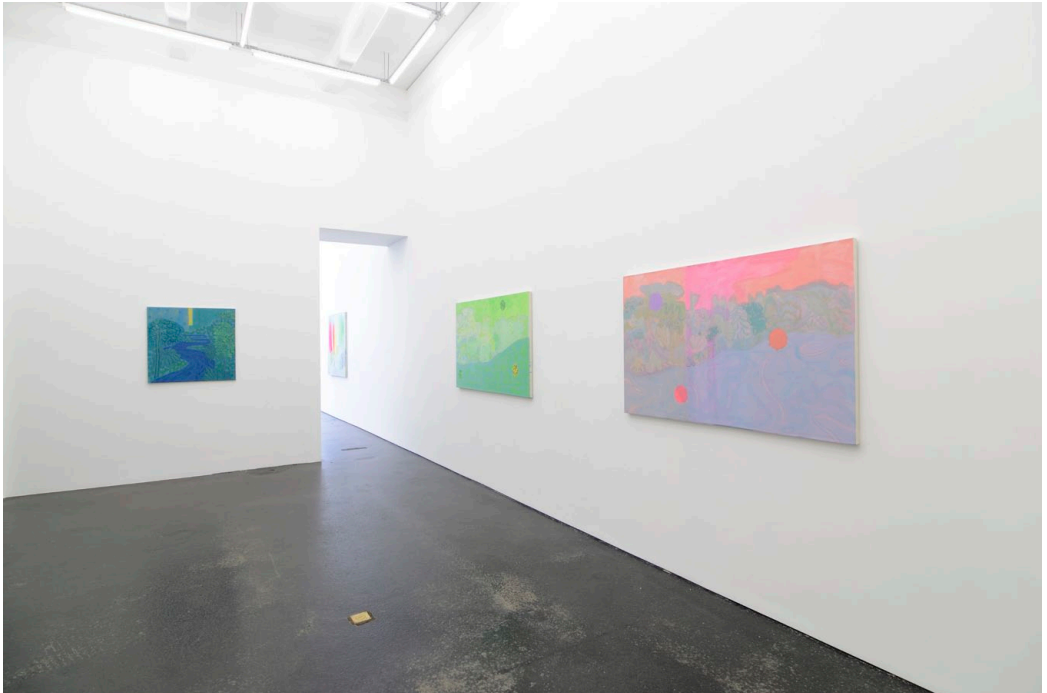
10 installation view Tyson Reeder Office Baroque, Brussels, 2015