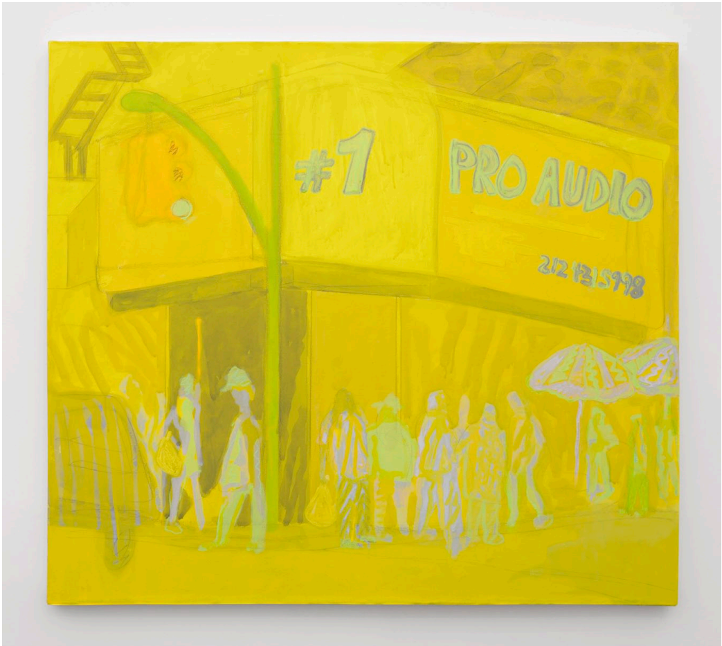
16 Pro Audio , 2015 gouache, pencil and acrylic on paper on canvas 81,5 x 91,5 cm