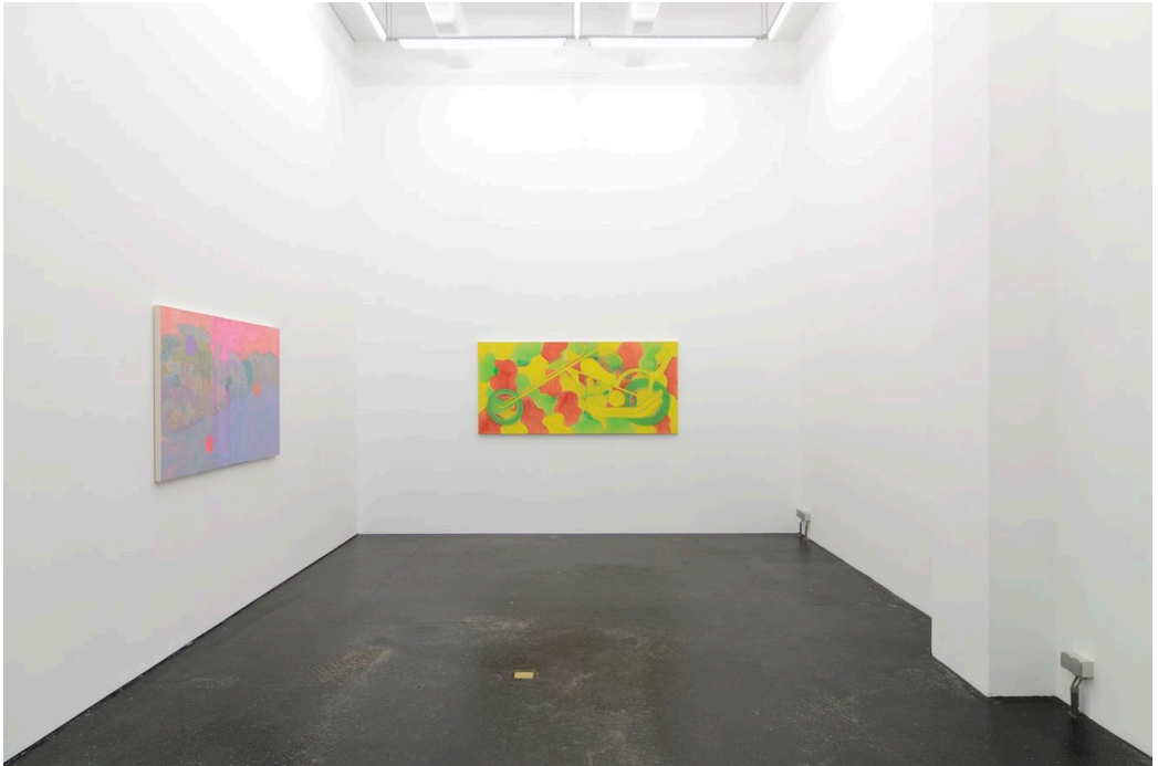
13 installation view Tyson Reeder Office Baroque, Brussels, 2015