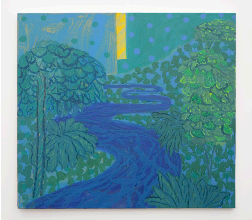
17 Untitled, 2015 acrylic and rabbit skin glue on canvas 81 x 91,5 cm