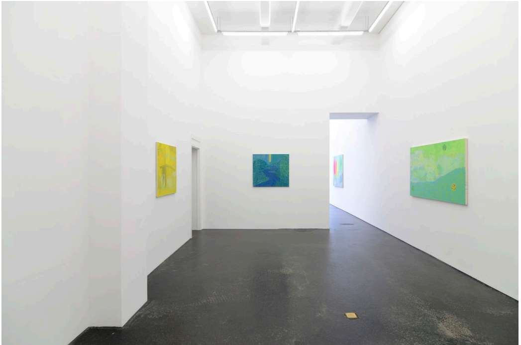
15 installation view Tyson Reeder Office Baroque, Brussels, 2015