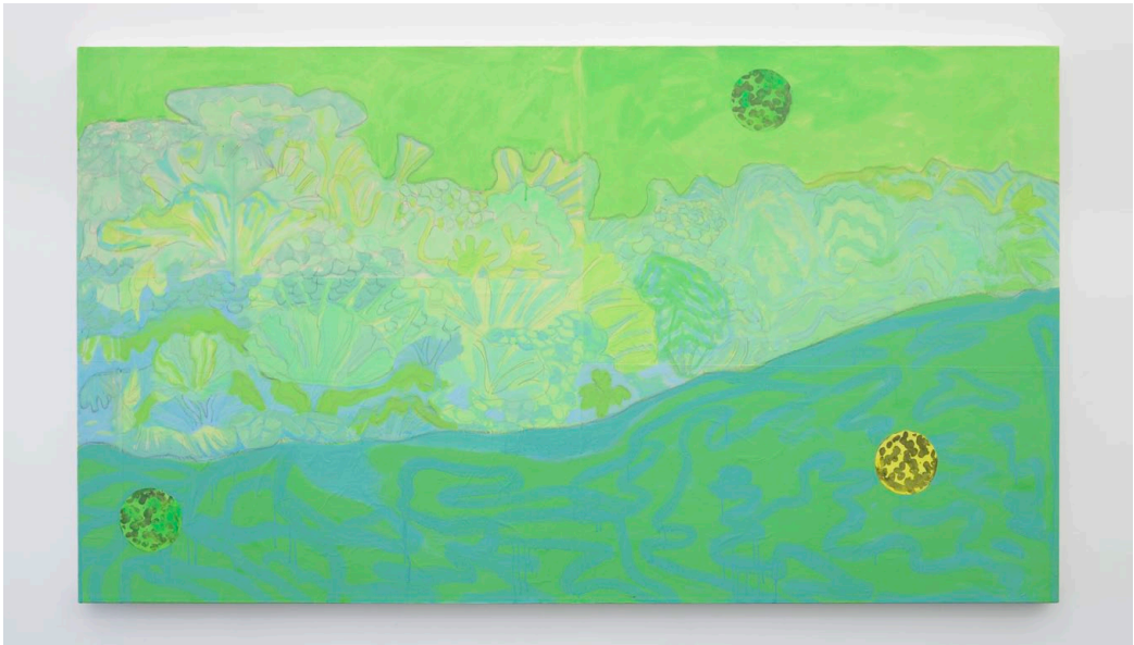
11 Green River , 2015 acrylic and pencil on paper on canvas 91,4 x 162,6 cm