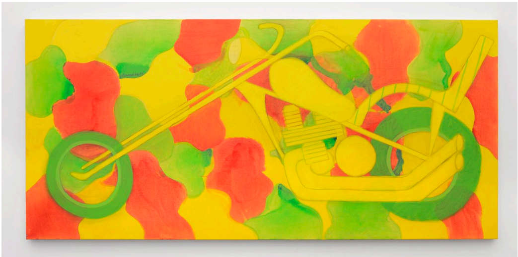
14 Red Yellow Green Chopper, 2015 acrylic and pencil on canvas 91,5 x 198 cm