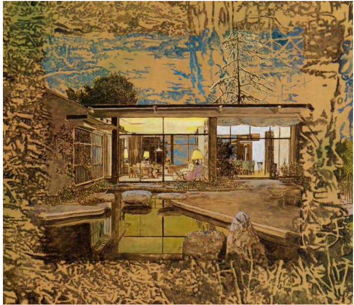
Running to stand still (detail), 2014

An exhibition of new paintings and works on paper by Stefan Kürten will open at Alexander and Bonin on April 18 th . The exhibition features Running to stand still (2014), a large scale painting depicting a grid of houses which emerge from a golden, abstracted thicket and represent Kürten's typography of 20 th Century homes.